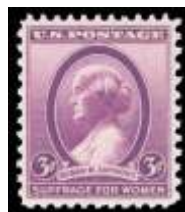
970 ★★ 1936, 3¢ Susan B. Anthony (Scott 784), o.g., never hinged, Superb; with 2023 P.F. certificate graded SUP 98 . SMQ $75. Estimate $50 - 75