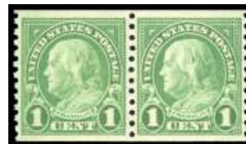
928 ★★ 1923, 1¢ Franklin, horizontal rotary press coil (Scott 597), a wonderfully well centered pair, o.g., never hinged, Extremely Fine to Superb; with 2009 P.S.E. certificate graded XF-SUP 95 . SMQ $105. Estimate $75 - 100