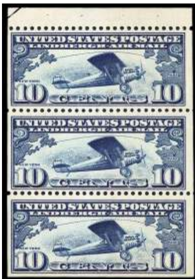
1113 ★★ Airmail, 1928, 10¢ Lindbergh, booklet pane of 3 (Scott C10a), position C, o.g., never hinged, nearly Very Fine. Scott $115. Estimate $40 - 60