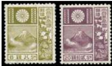
589 ★★ Japan, 1929, Mt. Fuji & Deer, 8s olive green and 20s brown violet, large ("old") die (J.S.C.A. 190, 191), o.g., never hinged, Very Fine. J.S.C.A. 114,000 yen ($820). Scott 174a, 176a; $385 for hinged. Estimate $150 - 200