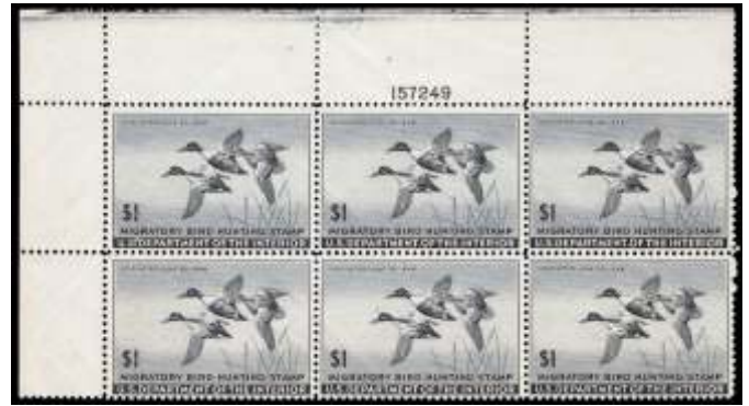
1175 ★★ Federal Duck Stamp, 1945, $1 Shoveller Ducks (Scott RW12), plate block of 6, o.g., never hinged, Very Fine. Scott $600. Estimate $200 - 300