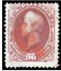
781 ○ 1873, 90¢ Perry, C.B.N.C. printing (Scott 166), red cancel, very bright and fresh, about Fine. Scott $365. Estimate $40 - 60