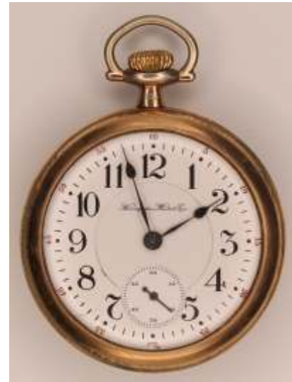
1319 Hampden Watch Co. vintage pocket watch. Railroad grade The Dueber Watch Co., model 3, 21 jewels. White enamel face (minor chip) with Arabic numerals and double sunk second sweep. Full plate in nickel. Keystone Watch Case Co. Victory 10kt rolled gold. Size 18, serial no. 2197834, circa 1906. Excellent condition, working at the time of cataloguing. Estimate $200 - 300