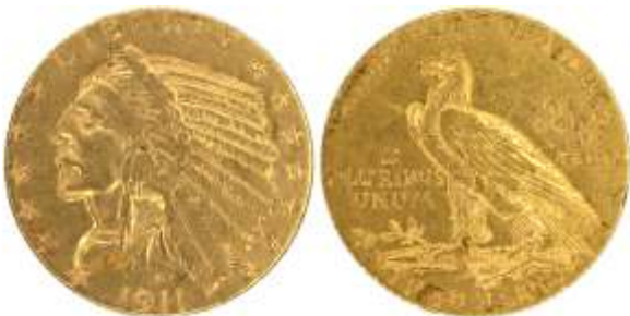
1266 1911-S Gold $5 Indian, Very Fine. Estimate $400 - 600