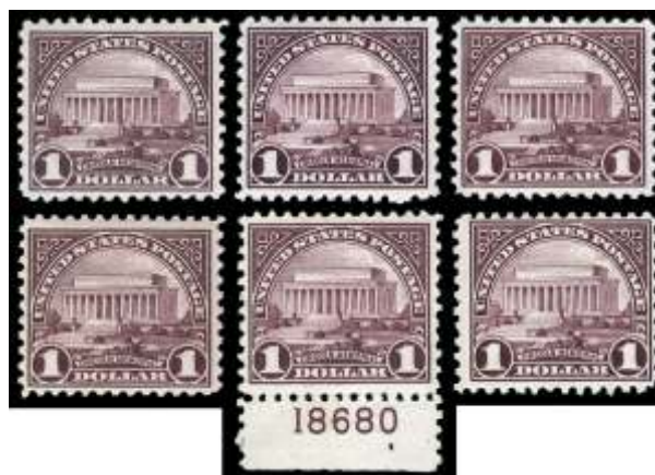
921 ★ 1923, $1 Lincoln Memorial, a group of 6 (Scott 571), o.g., hinged, Fine to Very Fine. Scott $210. Estimate $40 - 60