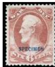
1149 S War Dept., 1875 Special Printing, 6¢ deep rose, overprinted "Specimen" (Scott O86SD), wonderfully well centered, without gum as issued, Very Fine to Extremely Fine; with 2021 P.S.A.G. certificate. Scott $1,400. Estimate $800 - 1,200