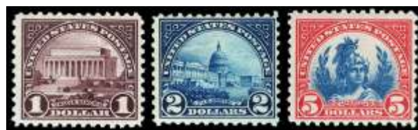
918 ★ 1923, $1 to $5 high values (Scott 571-573), set of 3, o.g., very lightly hinged, Fine to Very Fine. Scott $180. Estimate $50 - 75