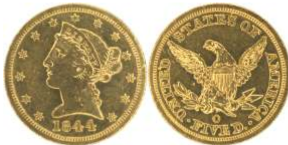
1259 1844-O Gold $5 Liberty, About Uncirculated. Estimate $400 - 600