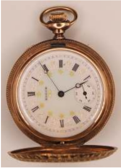
1293 Elgin National Watch Co. vintage pocket watch, 14kt yellow gold. Grade 133, model 2, 15 jewels. White decorative enamel face with Roman numerals and sunk second sweep. Partial plate in nickel. Guaranteed 25 year 14YG. Size 6, serial no. 7718807, circa 1899. Good condition, working at the time of cataloguing.