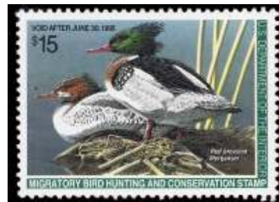
1194 ★★ Federal Duck Stamp, 1994, $15 Mergansers (Scott RW61), o.g., never hinged; cert mentions a trivial tiny natural ink spot at left, Extremely Fine; with 2022 P.S.E. certificate graded XF 90 . Scott $28. SMQ $45. Estimate $30 - 40