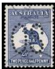
124 ○ Australia, Official, 1913, 2½d indigo, perforated "O.S." (SG O4), 1st watermark, Fine to Very Fine used. SG £180 ($230). Scott OA4; $145. Estimate $50 - 75