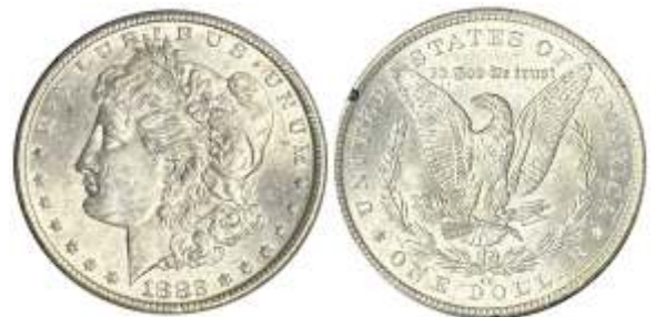
1245 1882-CC Morgan Dollar, in a lovely presentation box with papers of authenticity, Uncirculated. Greysheet $290 for MS62. Estimate $200 - 300