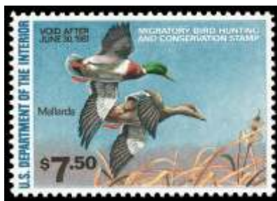
1191 ★★ Federal Duck Stamp, 1980, $7.50 Mallards (Scott RW47), perfect in every respect, o.g., never hinged, Superb; with 2018 P.S.E. certificate graded SUP 98 . Scott $13. SMQ $150. Estimate $100 - 150