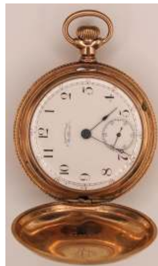
1343 Waltham Watch Co. vintage pocket watch. Grade P.S. Bartlett, model 1883, 17 jewels, side winding. White enamel face with Arabic numerals and double sunk second sweep. Full plate in nickel. Keystone Watch Case Co. gold plated. Size 18, serial no. 7580935, circa 1896. Very good condition, working at the time of cataloguing. Estimate $300 - 400