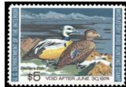
1189 ★★ Federal Duck Stamp, 1973, $5 Steller's Eiders (Scott RW40), o.g., never hinged, Extremely Fine to Superb; with 2004 P.S.E. certificate graded XF-SUP 95 . SMQ $80. Estimate $40 - 60