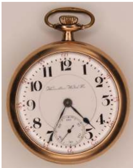
1314 Hamilton Watch Co. vintage pocket watch. Railroad grade 940, model 1, 21 jewels. White enamel face with Arabic numerals and double sunk second sweep. Damaskeened full plate in nickel. Philadelphia watch Co. guaranteed 20 year gold plated. Size 18, serial no. 216705, circa 1902. Excellent condition, working at the time of cataloguing. Estimate $300 - 400