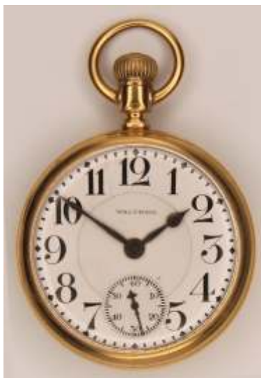
1344 Waltham Watch Co. vintage pocket watch. Railroad grade 645, model 1908, 21 jewels. White enamel face with Arabic numerals and double sunk second sweep. Bridge plate in nickel. Case is gold plated. Fahys Mantok guaranteed 20 year case. Size 16, serial no. 22083355, circa 1918. Very good condition, working at the time of cataloguing. Estimate $200 - 300