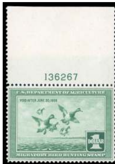
1169 ★★ Federal Duck Stamp, 1937, $1 Scaup Ducks (Scott RW4), plate number single, o.g., never hinged, Very Fine. Scott $300. Estimate $150 - 200