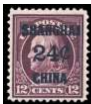
1145 ★ Offices in China, 1919, 24¢ on 12¢ brown carmine (Scott K11), o.g., lightly hinged, Fine to Very Fine. Scott $75. Estimate $40 - 60