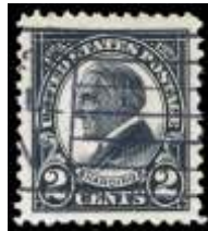
931 ★ 1923, 2¢ Harding, flat plate printing (Scott 610), outstandingly well centered within jumbo margins, with a neat machine cancel, Extremely Fine and choice; with 2022 P.S.E. certificate graded XF 90J . SMQ $30. Estimate $30 - 40