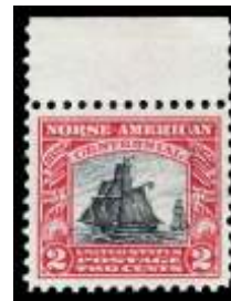
938 ★★ 1925, 2¢ Norse-American (Scott 620), a gorgeous sheet margin single, o.g., never hinged, Extremely Fine to Superb. Estimate $40 - 60