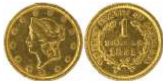
1254 1851 Gold $1 Liberty; Minor scratches obverse and reverse, Extremely Fine. Estimate $250 - 350