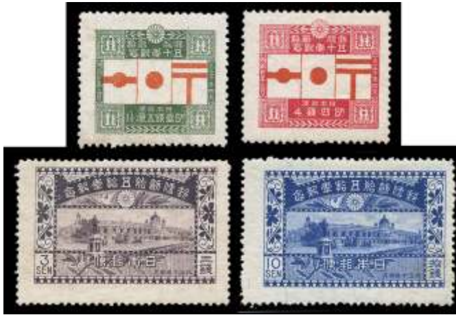
601 ★ Japan, Commemoratives, 1921, Postal Services Anniversary complete (J.S.C.A. C28-31) , set of 4, o.g., lightly hinged, Fine to Very Fine. J.S.C.A. 66,900 yen ($480). Scott 163-166; $330. Estimate $120 - 180