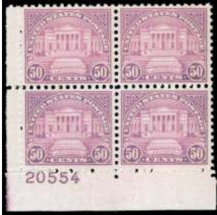
955 ★★田 1931, 50¢ Arlington Amphitheater, rotary press printing (Scott 701), plate block of 4, o.g., never hinged, Very Fine. Scott $230. Estimate $100 - 150