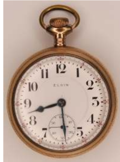
1291 Elgin National Watch Co. vintage pocket watch. Grade 239 Veritas, model 8, 21 jewels. White enamel face with Arabic numerals and double sunk second sweep. Partial plate in nickel. B & B Royal Watch Case Co. guaranteed 20 year gold plated. Size 18, serial no. 9549559, circa 1902. Excellent condition, not working at the time of cataloguing. Estimate $300 - 400