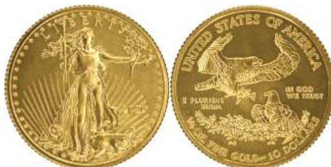
1276 2020 Gold $10 Eagle, Uncirculated. Estimate $500 - 750