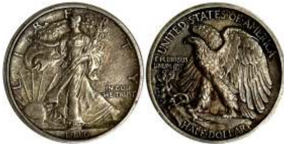
1239 1916-D Liberty Walking Half Dollar, Extremely Fine. Estimate $150 - 200