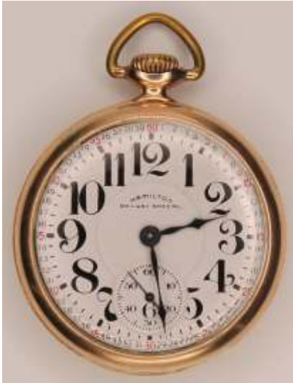
1309 Hamilton Watch Co. vintage pocket watch. Railroad grade 992, model 2, 21 jewels. White enamel face with Arabic numerals, Montgomery dial and double sunk second sweep. Partial plate in nickel. Case is Dueber 10kt gold filled. Size 16, serial no. 2392473, circa 1926. Good condition, working at the time of cataloguing. Estimate $400 - 600