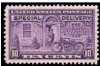
1134 ★★ Special Delivery, 1927, 10¢ red lilac (Scott E15a), an extraordinarily well centered gem with fantastic centering, o.g., never hinged, Superb; with 2016 P.S.E. certificate graded SUP 98. SMQ $70. Estimate $50 - 75