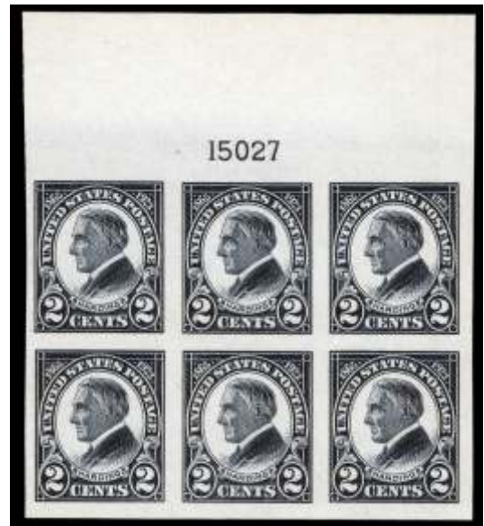
933 ★★田 1923, 2¢ Harding, imperf. (Scott 611), top plate block of 6, o.g., never hinged, Extremely Fine. Scott $90. Estimate $60 - 80