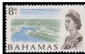
128 ★★ Bahamas, 1970, Queen Elizabeth II, 8¢ on whiter paper (SG 300a), o.g., never hinged, Very Fine. SG £160 ($200). Scott 257a; $190. Estimate $60 - 80