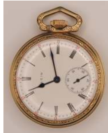
1304 Elgin National Watch Co. vintage pocket watch. Grade 241, model 6, 17 jewels. White enamel face with Roman numerals and sunk second sweep. Bridge plate in nickel. Illinois Watch Case Co. 10K rolled gold plate. Size 16, serial no. 12018085, circa 1906. Very good condition, not working at the time of cataloguing. Estimate $100 - 150