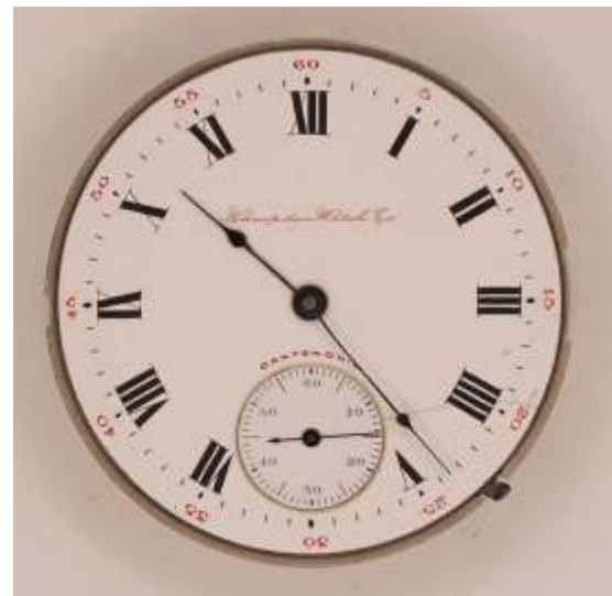
1320 Hampden Watch Co. works only. Grade General Stark, model 4, 17 jewels. White enamel face with Roman numerals and sunk second sweep. Bridge plate in nickel. Size 16, serial no. 2274375, circa 1906. Very good condition. Estimate $100 - 150