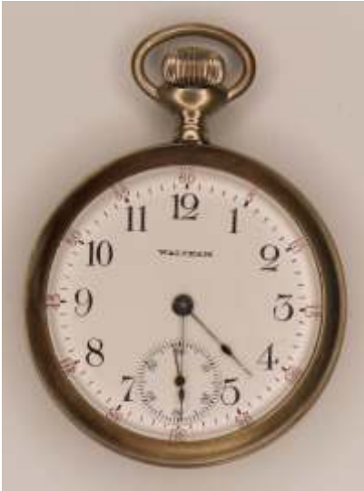
1352 Waltham Watch Co. vintage pocket watch. Grade 620, model 1899, 15 jewels. White enamel face with Arabic numerals and sunk second sweep. Bridge plate in nickel. Case is nickel/silver. Size 18, serial no. 14837345, circa 1906. Good condition, working at the time of cataloguing. Estimate $100 - 150