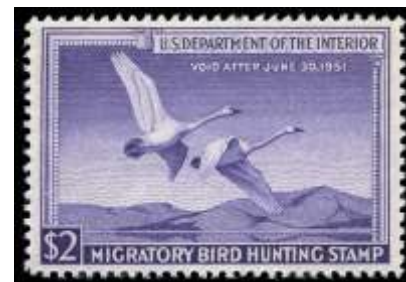
1177 ★★ Federal Duck Stamp, 1950, $2 Trumpeter Swans (Scott RW17), o.g., never hinged, Extremely Fine and choice; with 2014 P.S.E. certificate graded XF 90 . Scott $90. SMQ $160. Estimate $100 - 150