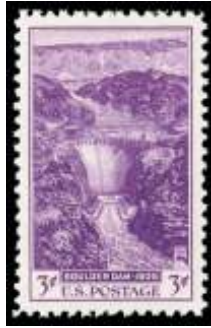
968 ★★ 1935, 3¢ Boulder Dam (Scott 774), a one-in-a-million gem for the most demanding connoisseur, o.g., never hinged, Superb; with 2023 P.F. certificate graded Gem 100 . SMQ $350. Estimate $200 - 300