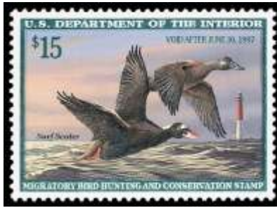
1196 ★★ Federal Duck Stamp, 1996, $15 Surf Scoters (Scott RW63), a flawless gem, o.g., never hinged, Superb; with 2004 P.S.E. certificate graded SUP 98 . Scott $33. SMQ $160. Estimate $100 - 150