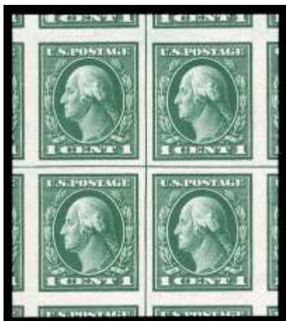
886 ★★田 1916, 1¢ Washington, green, unwatermarked, imperf. (Scott 481), a magnificent centerline block of 4, o.g., never hinged, Superb; with 2023 P.S.E. certificate graded Gem 100J. SMQ $300 as 4 Gem 100 singles. Estimate $200 - 300