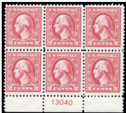
900 ★★田 1918, 2¢ Washington, carmine, type VII, offset printing (Scott 528B), plate block of 6, o.g., never hinged, Fine to Very Fine. Scott $375. Estimate $120 - 180