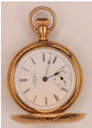
1326 Illinois Watch Co. vintage pocket watch. Grade 140, model 1, 7 jewels, side winding. White enamel face with Roman numerals and sunk second sweep. Partial hunting plate in gilt gold. Case is gold plated. Size 6, serial no. 1088067, circa 1891. Very good condition, working at time of cataloguing. Estimate $250 - 350