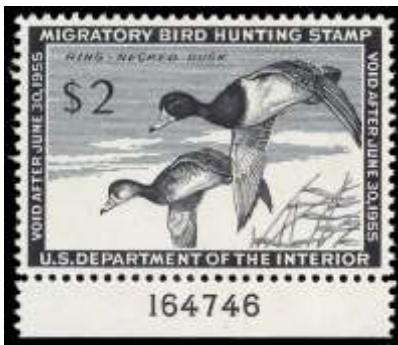
1179 ★★ Federal Duck Stamp, 1954, $2 Ring-necked Ducks (Scott RW21), a perfectly centered gem, o.g., never hinged, Superb; with 2023 P.S.E. certificate graded SUP 98. Scott $85. SMQ $450. Estimate $200 - 300