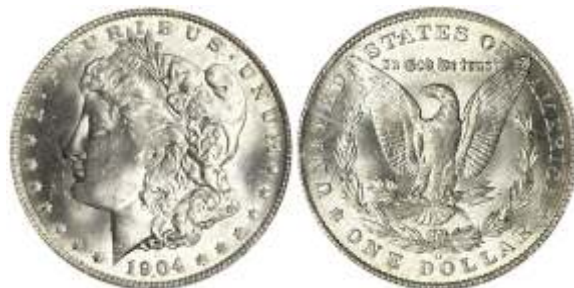
1252 1904-O Morgan Dollar, PCGS graded Mint State 65. A gorgeous coin in a superior grade. Greysheet $175, CPG $228. Estimate $120 - 180