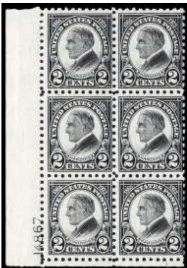
936 ★田 1923, 2¢ Harding, rotary press printing (Scott 612), plate block of 6, o.g., hinged, Fine to Very Fine. Scott $365. Estimate $75 - 100