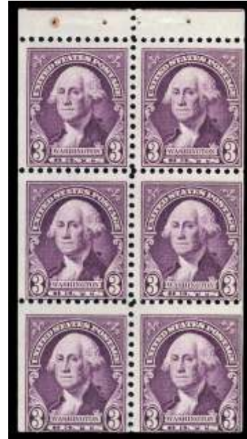
958 ★★ 1932, 3¢ Washington, rotary press printing, booklet pane of 6 (Scott 720b), o.g., never hinged, Fine. Scott $60. Estimate $30 - 40