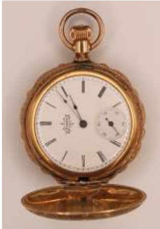
1301 Elgin National Watch Co. vintage pocket watch. Grade 117, model 2, 7 jewels. White enamel face with Roman numerals and sunk second sweep. Partial plate in gold. Fancy Puritan Watch Case Co. gold plated. Size 6, serial no. 6783840, circa 1897. Very good condition, working at the time of cataloguing. Estimate $150 - 200