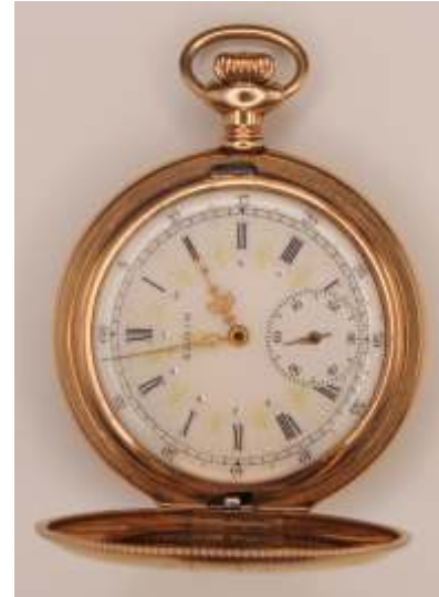
1287 Elgin National Watch Co. vintage pocket watch. Grade 344, model 2, 17 jewels. White enamel face with Roman numerals and sunk second sweep. Partial plate in nickel. Crescent Watch Case Co. 25 year guaranteed gold plated and painted. Size 12, serial no. 2020791, circa 1918. Excellent condition, working at the time of cataloguing. Estimate $400 - 600