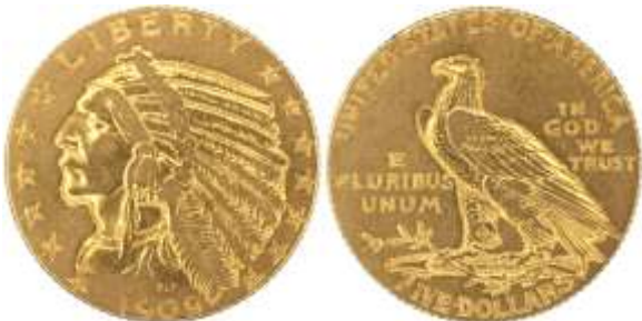
1265 1909 Gold $5 Indian, About Uncirculated. Estimate $400 - 600