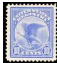
1135 ★★ Registry, 1911, 10¢ ultramarine (Scott F1), o.g., never hinged, Extremely Fine; with 2022 P.F. certificate graded XF 90. Scott $160. SMQ $300. Estimate $200 - 300