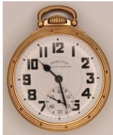
1308 Hamilton Watch Co. vintage pocket watch. Railroad grade 992B, model 5, 21 jewels. White enamel face with Arabic numerals and sunk second sweep and iridescent hands. Bridge plate in nickel. Case is 10kt gold filled. Size 16, serial no. C97163, circa 1944. Excellent condition, working at the time of cataloguing. Estimate $500 - 750