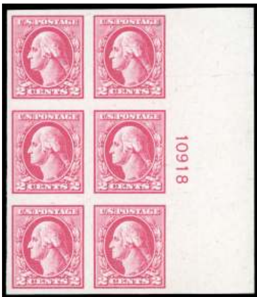
903 ★★田 1918, 2¢ Washington, carmine rose, type IV, offset printing, imperf. (Scott 532), plate block of 6, o.g., never hinged (tiny gum skip), Very Fine. Scott $675. Estimate $300 - 400