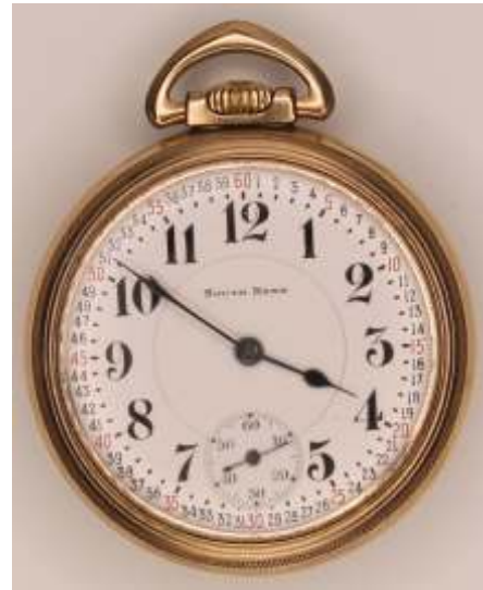
1335 South Bend Watch Co. vintage pocket watch. Railroad grade 227, model 2, 21 jewels. White enamel face with Arabic numerals and double sunk second sweep. Bridge plate in nickel. Keystone Watch Case Co. Victory 10kt rolled gold. Size 16, serial no. 847328, circa 1916. Excellent condition, working at the time of cataloguing. Estimate $300 - 400