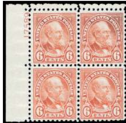
926 ★★田 1925, 6¢ Garfield, rotary press printing, perf. 10 (Scott 587), plate block of 4, o.g., never hinged, Fine to Very Fine. Scott $325. Estimate $50 - 75