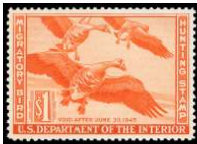
1173 ★ Federal Duck Stamp, 1944, $1 White-fronted Geese (Scott RW11), extraordinarily well centered, o.g., hinged, Extremely Fine to Superb; with 2019 P.S.E. certificate graded XF-SUP 95 . Scott $45. SMQ $175. Estimate $100 - 150