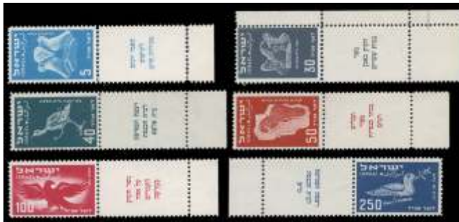
672 ★★ Israel, Airmail, 1950, First Issue complete, with tabs (Scott C1-C6) , set of 6, o.g., never hinged, Fine to Very Fine. Scott $250. Bale 32-37. Estimate $80 - 120