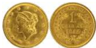
1257 1852 Gold $1 Liberty, Extremely Fine. Estimate $250 - 350