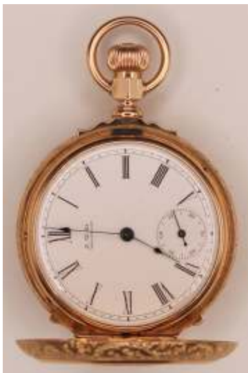
1340 Waltham Watch Co. vintage pocket watch, 14kt yellow gold. Grade J, model 1889, 7 jewels, side winding. White enamel face with Roman numerals and sunk second sweep. Partial hunting plate in gilt gold. W.W. Case Co. 14kt yellow gold. Size 6, serial no., circa 1889. Excellent condition, working at time of cataloguing. Estimate $600 - 800