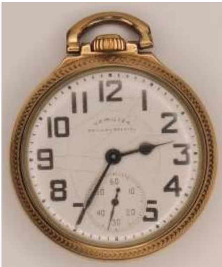
1310 Hamilton Watch Co. vintage pocket watch. Railroad grade 992B, model 5, 21 jewels. White enamel face (hairline cracks) with Arabic numerals and double sunk second sweep. Partial plate in nickel. Case is 10kt rolled gold plated. Size 16, serial no. C361643, circa 1952. Good condition, not working at the time of cataloguing. Estimate $400 - 600