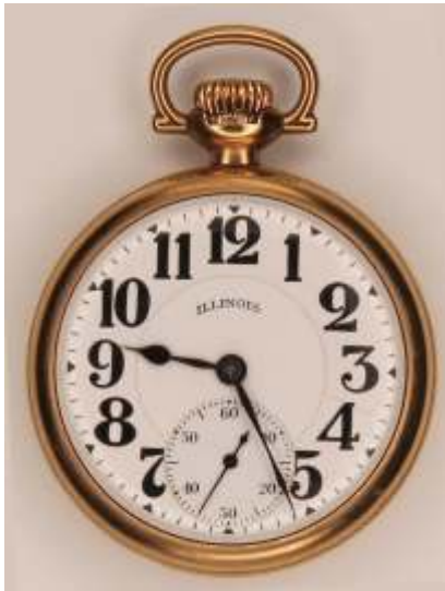
1321 Illinois Watch Co. vintage pocket watch. Railroad grade "Bunn Special" model 6, 23 jewels. White enamel face with Arabic numerals and double sunk second sweep. Partial plate in nickel. Philadelphia Watch Co. guaranteed 20 year gold filled fancy engraved case. Size 16s; serial no. 4095437; circa 1869. Excellent condition, working at the time of cataloguing. Estimate $600 - 800