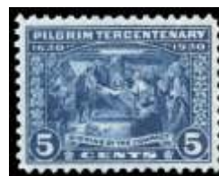
907 ★★ 1920, 5¢ Pilgrim (Scott 550), beautiful near perfect centering, o.g., never hinged (minor gum skip), Extremely Fine. Scott $70. Estimate $50 - 75