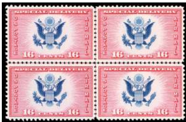
1128 ★★田 Airmail Special Delivery, 1936, 16¢ red & blue (Scott CE2), centerline block of 4, outstandingly well centered, o.g., never hinged, Extremely Fine to Superb; with 2019 P.S.E. certificate graded XF-SUP 95 . SMQ $300 as 4 singles. Estimate $200 - 300