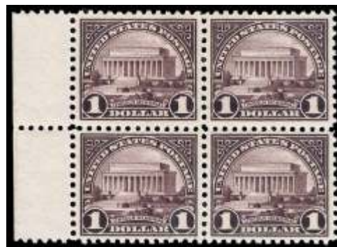
920 ★田 1923, $1 Lincoln Memorial (Scott 571), block of 4, excellent centering, o.g., lightly hinged, Very Fine or better. Scott $150. Estimate $80 - 120