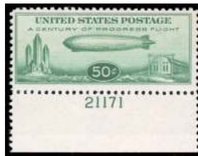
1118 ★★ Airmail, 1933, 50¢ "Chicago" Zeppelin (Scott C18), plate number single, o.g., never hinged, Fine to Very Fine. Scott $75. Estimate $35 - 50