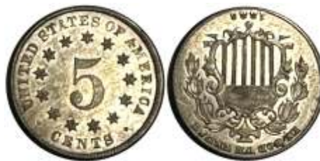
1235 1883 Shield Nickel, Brilliant Uncirculated. Estimate $80 - 120