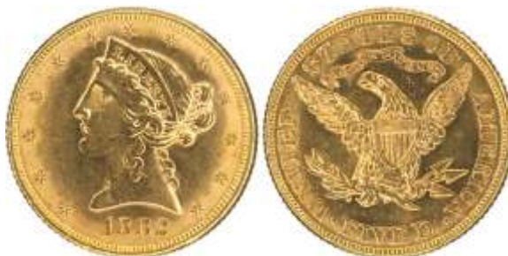
1261 1882 Gold $5 Liberty. Lovely luster, About Uncirculated. Estimate $400 - 600