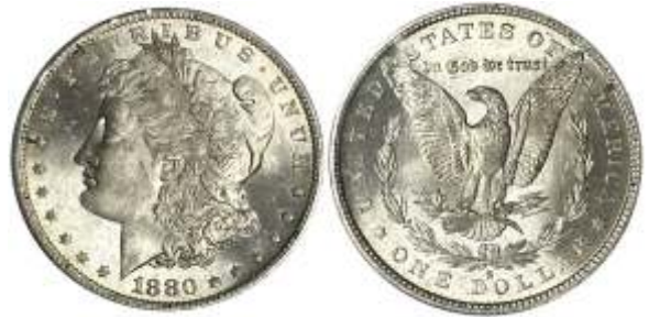
1242 1880-S Morgan Dollar, PCGS graded Mint State 63. Greysheet $77, CPG $104. Estimate $50 - 75