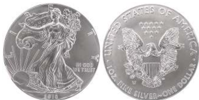
1272 2016-W Silver $1 Eagle. Burnished. 30th Anniversary, First Day of Issue, NGC graded Mint State 70. Greysheet $75. CPG $101. Estimate $50 - 75