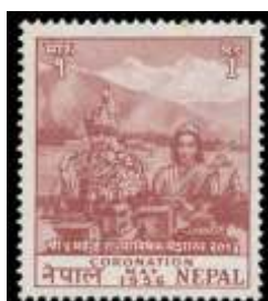
626 ★★ Nepal, 1956, 1r Coronation of King Mahendra (Scott 88), o.g., never hinged, Very Fine. Scott $100 for hinged. Estimate $60 - 80