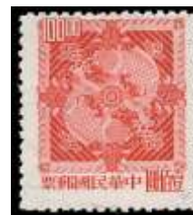
539 ★★ China: Taiwan, 1965, $100 Double Carp (Scott 1447), o.g., never hinged, Fine. Scott $150. Estimate $60 - 80