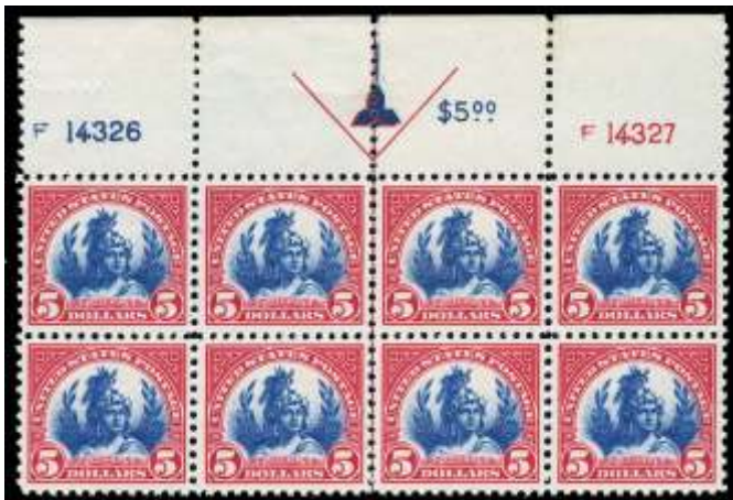
924 ★★田 1923, $5 America (Scott 573), plate block of 8, well centered throughout, o.g., never hinged, Very Fine or better. Scott $2,600. Estimate $1,500 - 2,000