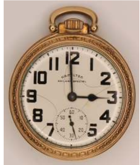
1311 Hamilton Watch Co. vintage pocket watch. Railroad grade 992B, model 5, 21 jewels. White enamel face (with hairlines) with Arabic numerals and sunk second sweep. Partial plate in nickel. Fortune Watch Co. case is 10kt gold filled, made in Canada. Size 16, serial no. C283473, circa 1950. Good condition, working at the time of cataloguing. Estimate $300 - 400