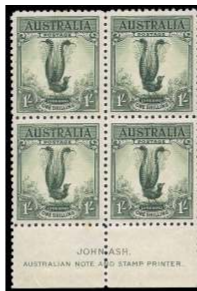
116 ★★田 Australia, 1932, Lyrebird, 1s green (SG 140) , Ash imprint block of 4, well centered, o.g., stamps never hinged, lightly hinged in bottom selvage only, Very Fine, The A.C.S.C. prices the Ash imprint block at a 20% premium over the singles prices. SG £180 for hinged sgls ($230). Scott 141; $360+. Estimate $120 - 180