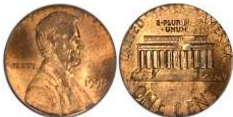
1233 1998 Lincoln Cent. Mint error - struck on wrong planchet, PCGS graded Mint State 63 Red. Estimate $80 - 120