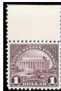
919 ★★ 1923, $1 Lincoln Memorial (Scott 571), exceptionally choice, o.g., never hinged, Extremely Fine to Superb; with 2020 P.S.E. certificate graded XF-SUP 95 . SMQ $275. Estimate $200 - 300