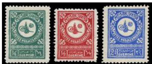
691 ★ Saudi Arabia, Hejaz and Nejd, 1932, Tughra of King Ibn Saud, ¼g to 2¼g complete, perf. 11½ (Scott 135-137), set of 3, o.g., lightly hinged, Fine to Very Fine. Scott $154. Estimate $60 - 80