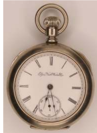
1296 Elgin National Watch Co. vintage pocket watch. Grade 73, model 5, 7 jewels. White enamel face with Roman numerals and sunk second sweep. Full plate in gilt gold. Dueber Watch Case Co. Silverine. Size 18, serial no 5316863., circa 1894. Very good condition, working at the time of cataloguing.