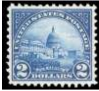
922 ★★ 1923, $2 U.S. Capitol (Scott 572), o.g., never hinged, Very Fine. Scott $120. Estimate $60 - 80