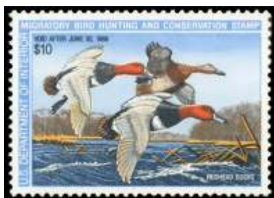
1192 ★★ Federal Duck Stamp, 1987, $10 Redhead Ducks (Scott RW54), a one-in-a-million gem, o.g., never hinged, Superb; with encapsulated P.S.E. certificate graded Gem 100 . Scott $18. SMQ $175. Estimate $100 - 150