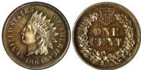
1231 1864 Indian Head Cent, Numitrust graded Mint State 62. Greysheet $214, CPG $280. Estimate $150 - 200