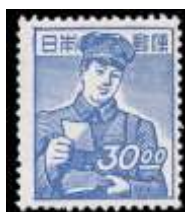
592 ★★ Japan, 1952, Showa Unwatermarked Series, 30y Postman (J.S.C.A. 331), o.g., never hinged, Fine to Very Fine. J.S.C.A. 40,000 yen ($290). Scott 520; $225. Estimate $80 - 120