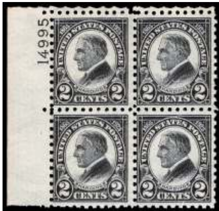
935 ★★田 1923, 2¢ Harding, rotary press printing (Scott 612), plate block of 4, o.g., never hinged, Fine to Very Fine. Scott $500. Estimate $150 - 200