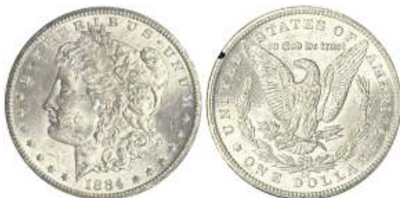
1247 1884-CC Morgan Dollar. In a lovely presentation box with papers of authenticity, Uncirculated. Greysheet $290 for MS62. Estimate $200 - 300