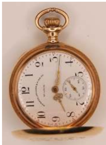
1331 Mermod, Jaccard & King Watch Co. (Elgin National), vintage pocket watch, 14kt yellow gold. Grade 320, model 2, 7 jewels. White enamel face with Arabic numerals and sunk second sweep with intricate gold hands. Partial plate in nickel. M.J. & K Watch Case Co. 14kt yellow gold. Size 0, serial no. 13029741, circa 1908. Very good condition, not working at the time of cataloguing. Estimate $150 - 200