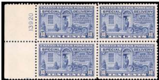
1132 ★★田 Special Delivery, 1922, 10¢ deep ultramarine (Scott E12a), block of 4 with plate number (not quite a plate block), o.g., never hinged, Very Fine to Extremely Fine; with 2023 P.S.E. certificate, some great singles here. Scott $520. Estimate $300 - 400