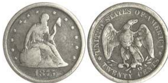
1237 1875-S Twenty Cents, Fine. Estimate $80 - 120