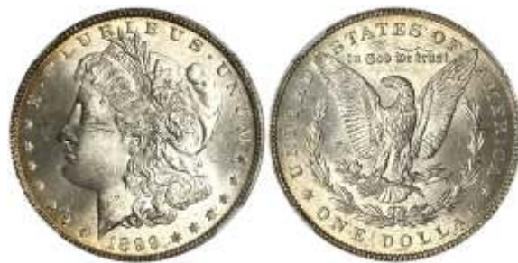
1250 1899 Morgan Dollar, NGC graded Mint State 62. Greysheet $250, CPG $325. Estimate $180 - 240