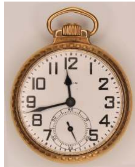
1288 Elgin National Watch Co. vintage pocket watch, 12kt yellow gold case. Railroad grade 478 var. B.W. Raymond, model 15, 21 jewels. White enamel face with Arabic numerals and sunk second sweep and iridescent hands. Partial plate in nickel. Size 16, serial no. 29586156, circa 1927. Excellent condition, working at the time of cataloguing. Estimate $300 - 400