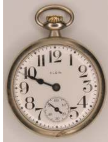
1299 Elgin National Watch Co. vintage pocket watch. Grade 313, model 7, 15 jewels. White enamel face with Arabic numerals and sunk second sweep. Partial plate in nickel. Wadsworth Watch Case is nickel. Size 16, serial no. 30074482, circa 1928. Good condition, working at the time of cataloguing. Estimate $200 - 300