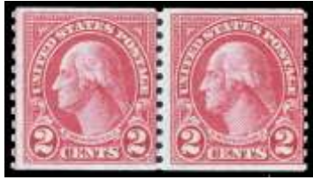
929 ★★ 1929, 2¢ Washington, type II, horizontal rotary press coil (Scott 599A), pair, o.g., left stamp hinged, right stamp never hinged, Fine; with 2015 P.S.E. certificate. Scott $360. Estimate $75 - 100