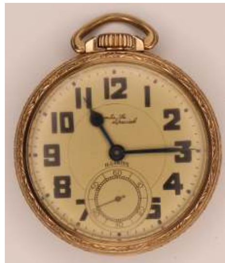
1324 Illinois Watch Co. vintage pocket watch. Grade 806 Santa Fe Special, model 9, 21 jewels. Gold face with Arabic numerals and sunk second sweep. Partial plate in nickel. Case 10K rolled gold plate. Size 16, serial no. 4394794, circa 1923. Very good condition, working at time of cataloguing. Estimate $300 - 400