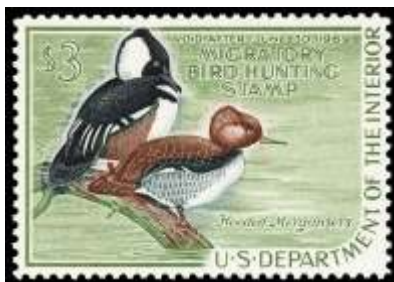
1186 ★★ Federal Duck Stamp, 1968, $3 Hooded Mergansers (Scott RW35), extraordinarily well centered, o.g., never hinged, Extremely Fine to Superb; with 2023 P.S.E. certificate graded XF-SUP 95 . Scott $65. SMQ $250. Estimate $180 - 240