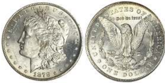
1240 1878-CC Morgan Dollar, PCGS graded Mint State 62. Greysheet $460, CPG $598. Estimate $350 - 500