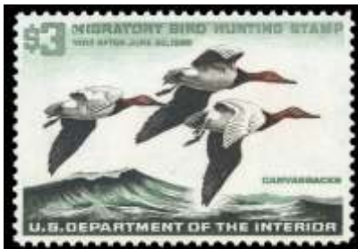
1185 ★★ Federal Duck Stamp, 1965, $3 Canvasback Drakes (Scott RW32), outstandingly well centered, o.g., never hinged, Extremely Fine to Superb; with 2022 P.S.E. certificate graded XF-SUP 95 . SMQ $225. Estimate $150 - 200