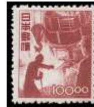
593 ★ Japan, 1952, Showa Unwatermarked Series, 100y Blast Furnace (J.S.C.A. 332), o.g., lightly hinged, Fine to Very Fine. J.S.C.A. 85,000 yen ($610). Scott 521A; $500 for n.h. Estimate $150 - 200