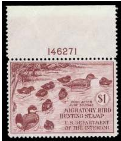
1172 ★★ Federal Duck Stamp, 1941, $1 Ruddy Ducks (Scott RW8), plate number single, o.g., never hinged, Very Fine. Scott $225. Estimate $100 - 150