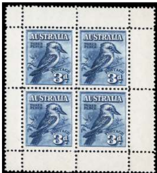
112 ★★田 Australia, 1928, 3d Kookaburra miniature sheet (Scott 95a) , pane of 4, o.g., never hinged, Very Fine. Scott $260 for N.H. SG MS106a; £130 for hinged ($170). Estimate $100 - 150