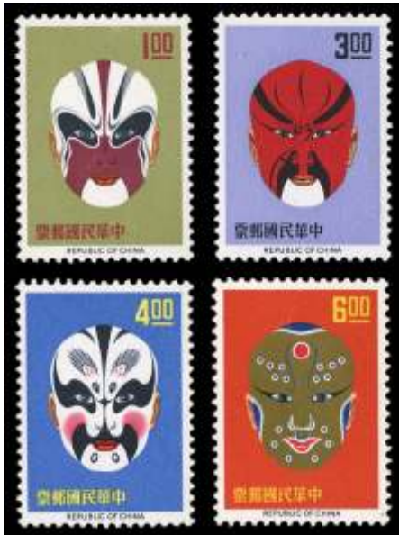
540 ★★ China: Taiwan, 1966, Painted Faces of Chinese Opera complete (Scott 1471-1474), o.g., never hinged, Very Fine. Scott $106. Estimate $50 - 75