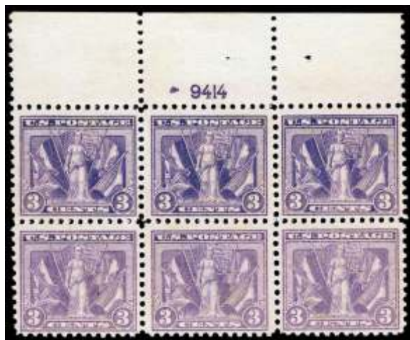
904 ★★/★田 1919, 3¢ Victory (Scott 537), top plate block of 6, o.g., lightly hinged (4 stamps never hinged); mild toning in the selvage, otherwise Fine to Very Fine. Scott $260. Estimate $60 - 80