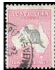
114 ○ Australia, 1932, Kangaroo and Map, 10s gray & pink (SG 136) , C of A watermark, Fine used. SG £160 ($200). Scott 127; $200. Estimate $50 - 75