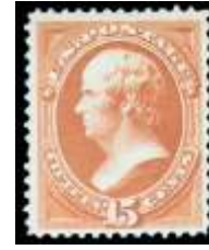
785 ★ 1879, 15¢ Webster, red orange, A.B.N.C. printing (Scott 189), well centered within large margins, bright fresh color, o.g., hinged, Very Fine; with 2023 P.F. certificate. Scott $180. Estimate $100 - 150