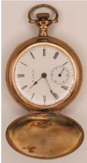
1305 Elgin National Watch Co. vintage pocket watch. Grade 354, model 2, 15 jewels, side winding. White enamel face with Roman numerals and sunk second sweep. Partial plate in nickel. Philadelphia Watch Case Co. guaranteed 20 years gold plated. Size 0, serial no. 15111460, circa 1911. Good condition, working at the time of cataloguing. Estimate $100 - 150