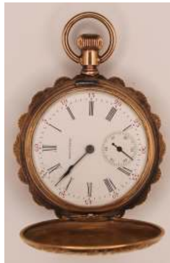
1350 Waltham Watch Co. vintage pocket watch, 14kt yellow gold. Grade Lady Waltham, model 1890, 16 jewels, side winding. White enamel face with Roman numerals and sunk second sweep. Partial plate in nickel. Mascot Watch Case Co. 14kt yellow gold. Size 6, serial no. 7194212, circa 1893. Excellent condition, working at the time of cataloguing. Estimate $150 - 200