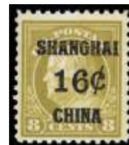
1143 ★★ Offices in China, 1919, 16¢ on 8¢ olive green (Scott K8a), o.g., never hinged, Fine to Very Fine. Scott $150. Estimate $50 - 75