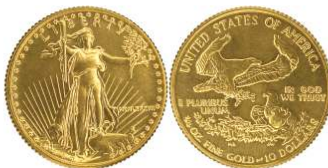
1274 1987 Gold $10 Eagle, Uncirculated. Estimate $500 - 750