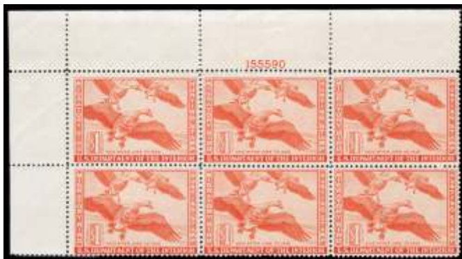
1174 ★★ Federal Duck Stamp, 1944, $1 White-fronted Geese (Scott RW11), top plate block of 6, well centered, o.g., never hinged, Very Fine. Scott $750. Estimate $300 - 400