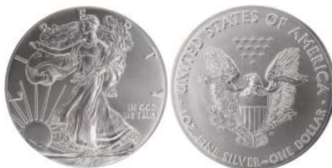
1273 2016-W Silver $1 Eagle. 30th Anniversary, First Day of West Point strike, PCGS graded Specimen 70. Estimate $50 - 75