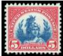
923 ★★ 1923, $5 America (Scott 573), superlative centering, o.g., never hinged, Extremely Fine to Superb. Scott $180. Estimate $200 - 300