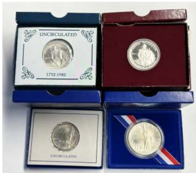
1269 1982 George Washington 250th Anniversary group. Including uncirculated and silver proof sets; also including 1986 Statue of Liberty Centennial clad half dollar and silver dollar; all in their original boxes. Retail price approximately $150.