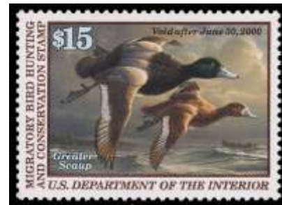
1200 ★★ Federal Duck Stamp, 1999, $15 Greater Scaup (Scott RW66), o.g., never hinged, Superb; with 2022 P.S.E. certificate graded SUP 98 . Scott $40. SMQ $140. Estimate $60 - 80