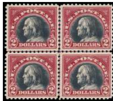
905 ★田 1920, $2 Franklin, carmine & black (Scott 547), centerline block of 4, well centered throughout, o.g., very lightly hinged, Very Fine to Extremely Fine. Scott $750. Estimate $400 - 600