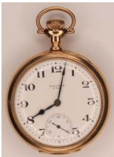
1345 Waltham Watch Co. vintage pocket watch. Grade 620, model 1899, 15 jewels. White enamel face with Arabic numerals and double sunk second sweep with iridescent hands. Bridge plate in nickel. Crescent Watch Case Co. guaranteed 20 year gold plated. Size 16, serial no. 9331760, circa 1899. Excellent condition, not working at the time of cataloguing. Estimate $200 - 300