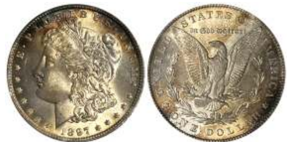
1249 1897 Morgan Dollar, PCGS graded Mint State 64. Deeply toned. Greysheet $135, CPG $176. Estimate $80 - 120