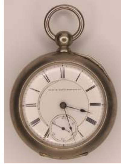
1292 Elgin National Watch Co. vintage pocket watch. Grade 69 B.W. Raymond, model 1, 15 jewels key wind pocket watch. White enamel face (hairlines) with Roman numerals and double sunk second sweep. Partial plate in nickel. Watch case nickel plated. Size 18, serial no. 263647, circa 1873. Very good condition, working at the time of cataloguing includes chain and key. Estimate $300 - 400