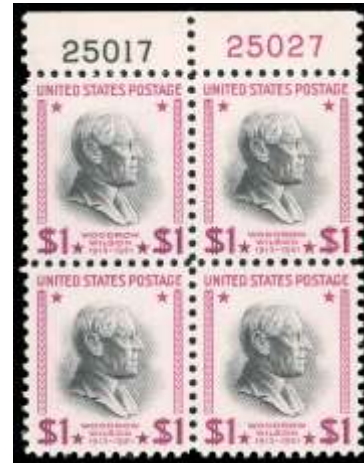
971 ★★田 1954, $1 Wilson, bright magenta & black (Scott 832g), plate block of 4, flawless centering, o.g., never hinged, Very Fine to Extremely Fine; with 2023 Crowe certificate. Scott $400. Estimate $200 - 300