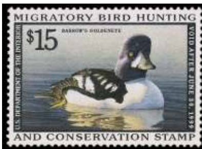
1198 ★★ Federal Duck Stamp, 1998, $15 Goldeneye (Scott RW65), a beautifully well centered gem, o.g., never hinged, Superb; with 2022 P.S.E. certificate graded SUP 98 . SMQ $160. Estimate $100 - 150