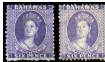
126 ★ Bahamas, 1863, Queen Victoria, 6d deep violet and 6d aniline violet, both perf. 12½ (SG 31, 32), o.g., hinged, Fine. SG £460 ($590). Scott 14, 14a; $525. Estimate $150 - 200