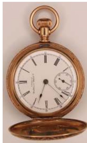
1346 Waltham Watch Co. vintage pocket watch. Grade 24, model 1888, 11 jewels, side winding. White enamel face with Roman numerals and sunk second sweep. Partial plate in nickel. Crescent Watch Case Co. Planet gold plated. Size 16, serial no. 5461220, circa 1892. Very good condition, working at the time of cataloguing. Estimate $200 - 300