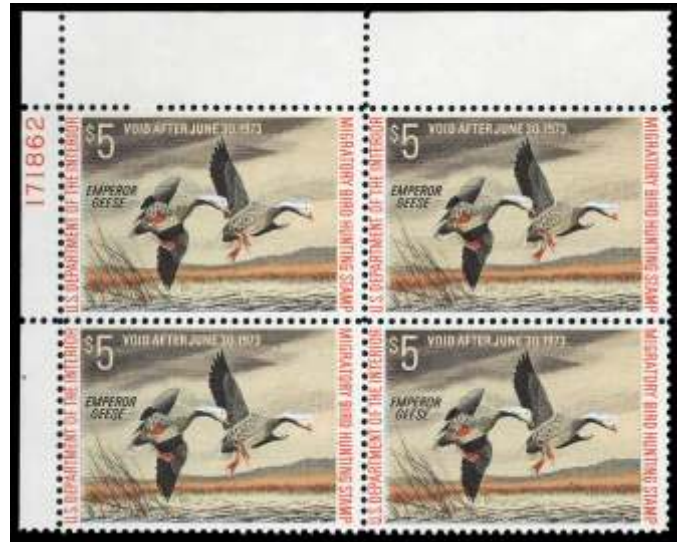
1188 ★★田 Federal Duck Stamp, 1972, $5 Emperor Geese (Scott RW39), plate block of 4, o.g., never hinged, Fine to Very Fine. Scott $125. Estimate $40 - 60