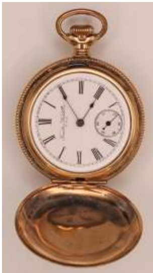
1338 Trenton Watch Co. vintage pocket watch. Grade 52, model 2, 7 jewels. White enamel face with Roman numerals and sunk second sweep. Partial plate in nickel. Monitor Watch Case Co. gold plated. Size 6, serial no. 2042468, circa 1899. Very good condition, working at the time of cataloguing. Estimate $150 - 200