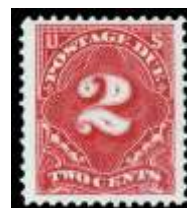
1136 ★★ Postage Due, 1910, 2¢ deep claret, S.L. watermark, perf. 12 (Scott J46), well centered within oversized margins, o.g., never hinged, a Very Fine jumbo. Scott $115. Estimate $60 - 80