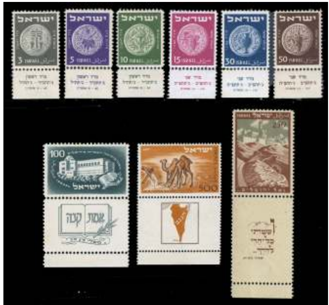
669 ★★ Israel, 1949-50, Regular Issue, 3p to 500p complete, with tabs (Scott 17-25), o.g., never hinged, Fine to Very Fine. Scott $315. Bale 15//47. Estimate $100 - 150