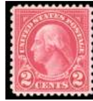
925 ★★ 1923, 2¢ Washington, rotary press coil waste, perf. 11 x 10 (Scott 579), magnificent near perfect centering, o.g., never hinged, Extremely Fine. Scott $140. Estimate $150 - 200