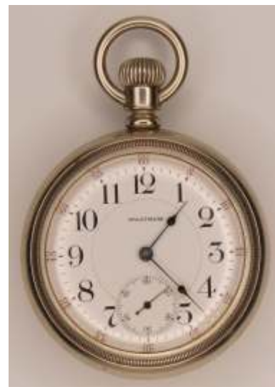
1342 Waltham Watch Co. vintage pocket watch. Railroad grade 845, model 1892, 21 jewels. White enamel face with Arabic numerals and double sunk second sweep. Full plate in nickel. Dueber Silverine case nickel plated. Size 18, serial no. 14174421, circa 1904. Excellent condition, working at the time of cataloguing. Estimate $400 - 600