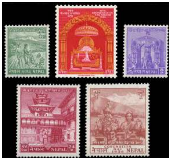
625 ★ Nepal, 1956, Coronation of King Mahendra complete (Scott 84-88), set of 5, o.g., lightly hinged, Fine to Very Fine. Scott $114. Estimate $50 - 75