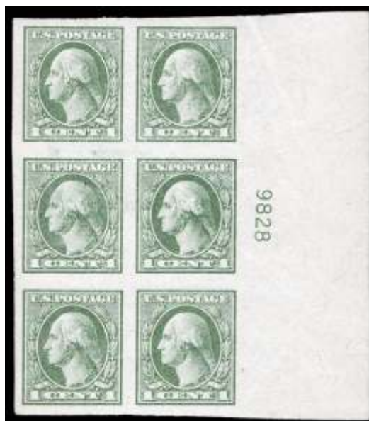
902 ★★/★田 1919, 1¢ Washington, green, offset printing, imperf. (Scott 531), plate block of 6, o.g., stamps never hinged, hinged in selvage only, Extremely Fine. Scott $125. Estimate $75 - 100