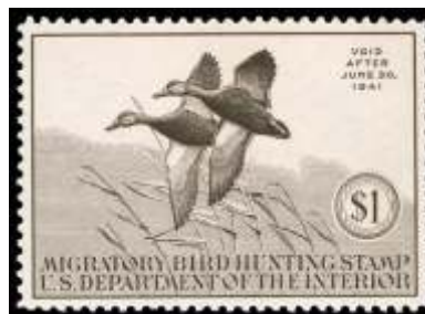
1171 ★ Federal Duck Stamp, 1940, $1 Black Mallards (Scott RW7), perfectly centered, o.g., hinged, Superb; with 2023 P.S.E. certificate graded SUP 98. SMQ $250. Estimate $180 - 240