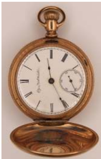
1290 Elgin National Watch Co. vintage pocket watch. Grade 82 G.M. Wheeler, model 3, 15 jewels. White enamel face with Roman numerals and sunk second sweep. Full hunting plate. N.W.J. Case Co. guaranteed. Size 18, serial no. 3115467, circa 1889. Very good condition, working at the time of cataloguing. Estimate $300 - 400