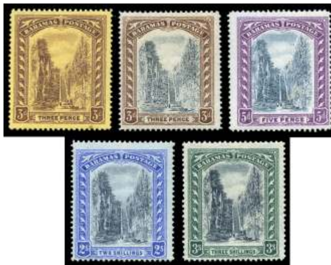
127 ★ Bahamas, 1917-19, Queen's Staircase, 3d to 3s (SG 76/80), set of 5 (complete by Scott), o.g., lightly hinged, Fine to Very Fine. SG £92 ($120). Scott 58-62; $135. Estimate $40 - 60