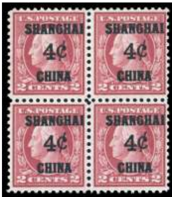
1139 ★★/★田 Offices in China, 1919, 4¢ on 2¢ rose (Scott K2), block of 4, well centered, o.g., lightly hinged at top, never hinged at bottom, Very Fine. Scott $180. Estimate $120 - 180