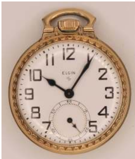
1306 Elgin National Watch Co. vintage pocket watch. Grade 616, model 20, 17 jewels, side winding. White enamel face with Arabic numerals and sunk second sweep. Partial plate in nickel. Case 10kt rolled gold plate. Size 16, serial no. P671439, circa 1951. Good condition, working at the time of cataloguing. Estimate $100 - 150