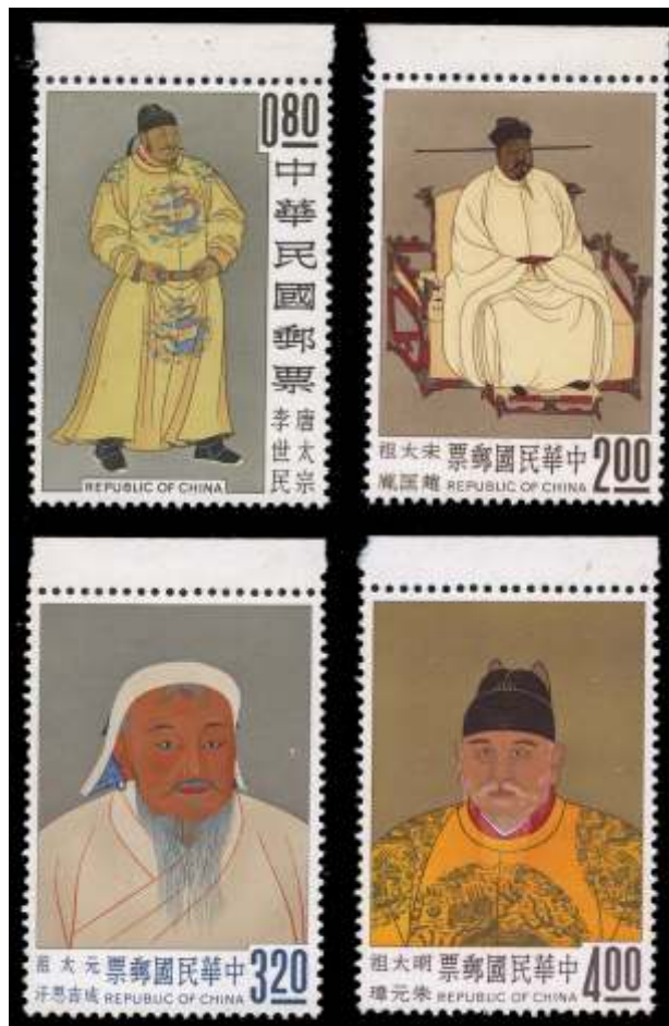
538 ★★ China: Taiwan, 1962, Palace Museum Paintings (2nd series) complete (Scott 1355-1358), set of 4, o.g., never hinged, Very Fine. Scott $370. Estimate $180 - 240