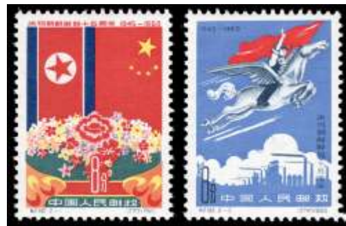
544 ★★ China (People's Republic), 1960, Liberation of Korea (C82) complete, o.g., never hinged, Very Fine. Scott 525-526; $130. Estimate $50 - 75