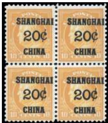
1144 ★★/★田 Offices in China, 1919, 20¢ on 10¢ orange yellow (Scott K10), block of 4, o.g., lightly hinged at top, never hinged at bottom, Fine to Very Fine. Scott $390. Estimate $150 - 200