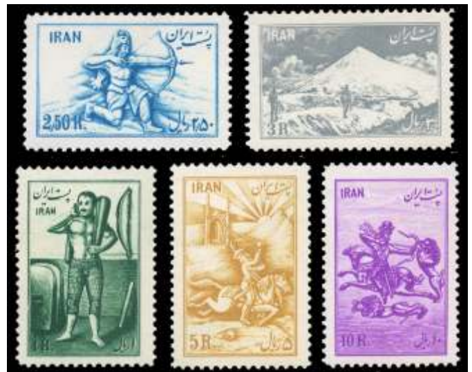
657 ★ Iran, 1953, Ancient Sports complete (Scott 978-982) , set of 5. Scott $157 for hinged. Estimate $60 - 80