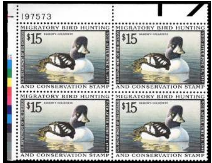
1199 ★★田 Federal Duck Stamp, 1998, $15 Goldeneye (Scott RW65), plate block of 4, o.g., never hinged, Extremely Fine. Scott $180. Estimate $50 - 75