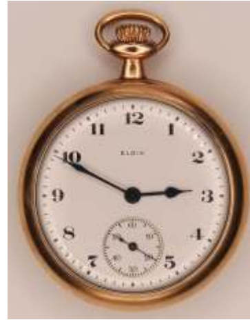
1300 Elgin National Watch Co. vintage pocket watch. Grade 291, model 7, 7 jewels. White enamel face with Arabic numerals and sunk second sweep. Partial plate in nickel. Fahys Montauk Watch Case Co. guaranteed 20 year gold plated. Size 16, serial no. 23404079, circa 1921. Excellent condition, working at the time of cataloguing. Estimate $200 - 300