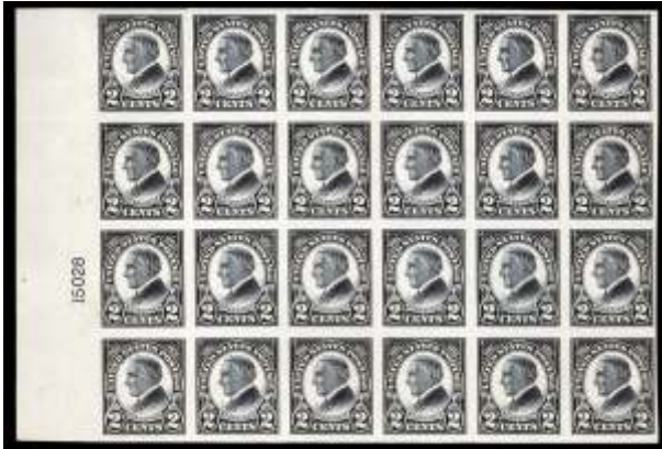
934 ★★田 1923, 2¢ Harding, imperf. (Scott 611), plate block of 24, o.g., never hinged, Very Fine. Scott $270. Estimate $75 - 100