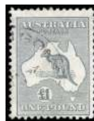
115 ○ Australia, 1935, Kangaroo and Map, £1 gray (SG 137) , C of A watermark, Fine used. SG £300 ($380). Scott 128; $275. Estimate $80 - 120