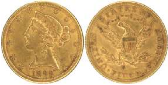
1263 1899-S Gold $5 Liberty, Very Fine. Estimate $400 - 600