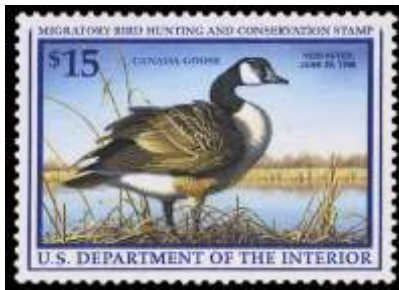
1197 ★★ Federal Duck Stamp, 1997, $15 Canada Geese (Scott RW64), a magnificent gem for the most demanding connoisseur, with mathematically perfect centering, o.g., never hinged, Superb; with 2022 P.S.E. certificate graded Gem 100 . SMQ $350. Estimate $250 - 350