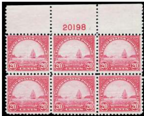
916 ★田 1923, 20¢ Golden Gate (Scott 567), top plate block of 6, o.g., lightly hinged, Fine to Very Fine. Scott $275. Estimate $80 - 120