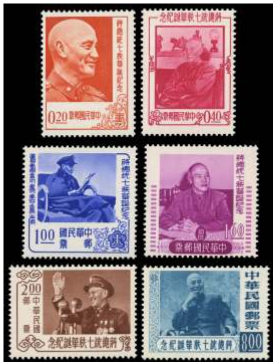
536 ★★ China: Taiwan, 1956, 70th Birthday of Chiang Kai-shek complete (Scott 1143-1148), set of 6, o.g., never hinged, Fine to Very Fine. Scott $141. Estimate $60 - 80