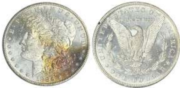
1246 1884-CC Morgan Dollar, in a lovely presentation box with papers of authenticity; some toning, Uncirculated. Greysheet is $325 for MS62. Estimate $200 - 300