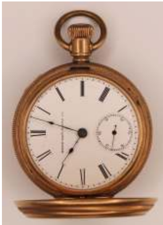
1302 Elgin National Watch Co. vintage pocket watch. Grade 96, model 4, 7 jewels, side winding. White enamel face with Roman numerals and second sweep. Full Hunting plate in gilt gold. Excelsior Watch Case Co. guaranteed gold plated. Size 18, serial no. 1963340, circa 1886. Excellent condition, working at the time of cataloguing, missig crystal. Estimate $150 - 200