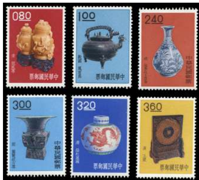
537 ★★ China: Taiwan, 1961, Ancient Chinese Art Treasures (3rd series) complete (Scott 1302-1307), set of 6, o.g., never hinged, Fine to Very Fine. Scott $231. Estimate $100 - 150