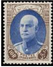
653 ★ Iran, 1937, 10r Reza Shah Pahlavi (Scott 885) , the high value of the set, o.g., lightly hinged, Fine to Very Fine. Scott $225. Estimate $75 - 100