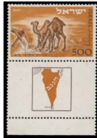
670 ★★ Israel, 1950, 500p Negev, with tab (Scott 25), the high value of the set, o.g., never hinged, Very Fine. Scott $200. Bale 47. Estimate $60 - 80