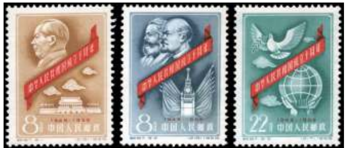
543 ★★ China (People's Republic), 1959, 10th Anniversary of the People's Republic (1st Issue) (C67) complete, o.g., never hinged, Very Fine. Scott 438-440; $170. Estimate $60 - 80