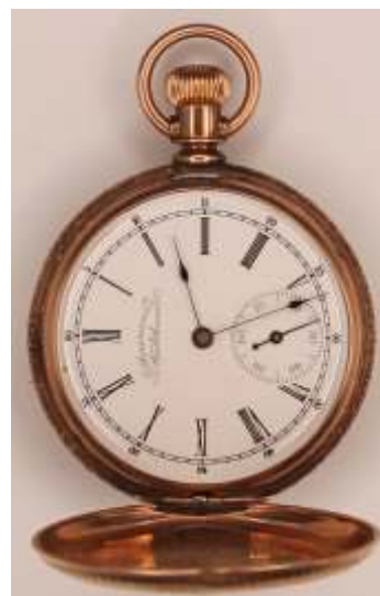
1347 Waltham Watch Co. vintage pocket watch. Grade J, model 1890, jewels, side winding. White enamel face with Roman numerals and sunk second sweep. Partial Hunting plate in gold. Lily Watch Case Co. gold plated. Size 6, serial no. 6137309, circa 1893. Very good condition, working at the time of cataloguing. Estimate $200 - 300