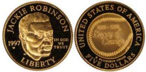
1267 1997-W Jackie Robinson $5 Gold, Proof. Estimate $300 - 400