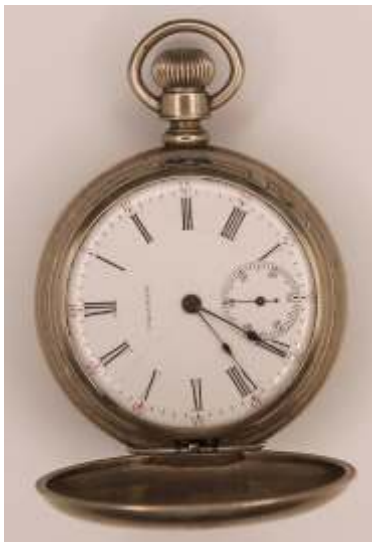
1348 Waltham Watch Co. vintage pocket watch. Grade 620, model 1899, 15 jewels, side winding. White enamel face (hairlines) with Roman numerals and sunk second sweep. Bridge plate in nickel. Dueber Watch Case Co. Silverine. Size 16, serial no. 11967174, circa 1902. Very good condition, working at the time of cataloguing. Estimate $200 - 300