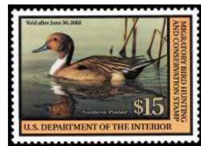
1201 ★★ Federal Duck Stamp, 2001, $15 Northern Pintail (Scott RW68), o.g., never hinged, Superb; with 2007 P.S.E. certificate graded SUP 98 . Scott $35. SMQ $110. Estimate $50 - 75