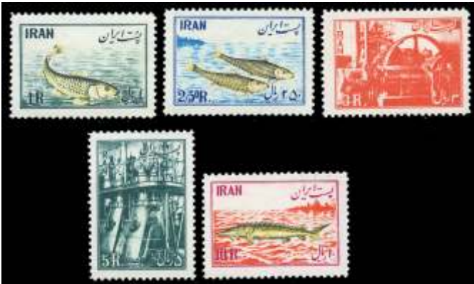
658 ★★ Iran, 1954, Nationalization of the Fishing Industry complete (Scott 985-989) , set of 5, o.g., never hinged, Very Fine. Scott $175 for hinged. Estimate $60 - 80