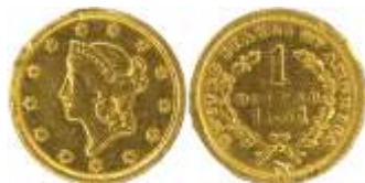
1256 1851 Gold $1 Liberty; Damaged rim and a gouge on the reverse, Sharpness of Extremely Fine. Estimate $250 - 350