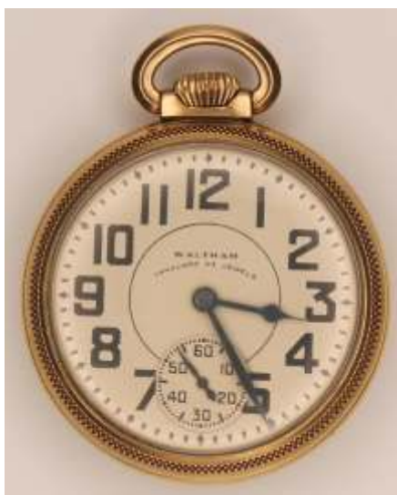
1341 Waltham Watch Co. vintage pocket watch. Railroad grade Vanguard, model 1908, 23 jewels. Off-white enamel face with Arabic numerals and raised second sweep. Bridge plate in nickel. Keystone J. Boss 10K gold filled case. Size 16, serial no. 33209615, circa 1948. Excellent condition, working at the time of cataloguing. Estimate $500 - 750