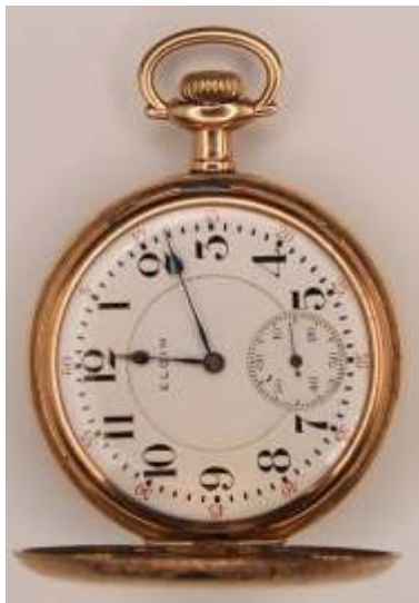
1286 Elgin National Watch Co. vintage pocket watch. Grade 373 Father Time, model 14, 21 jewels. White enamel face with Arabic numerals and double sunk second sweep. Partial plate in nickel. Fahys Bristol case gold plated. Size 16, serial no. 14228144, circa 1910. Excellent condition, working at time of cataloguing. Estimate $400 - 600