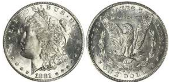
1244 1881-S Morgan Dollar, PCGS graded Mint State 63. Greysheet $77, CPG $104. Estimate $50 - 75