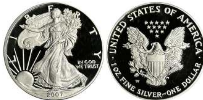
1270 2007-W Silver $1 Eagle. Proof. In the original box with certificate of authenticity.