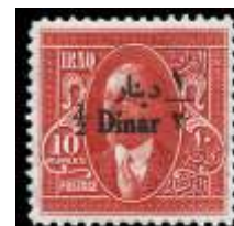
666 ★ Iraq , 1932, King Faisal I, 1/2d on 10r (Scott 42), o.g., lightly hinged, Very Fine. Scott $125. Estimate $50 - 75