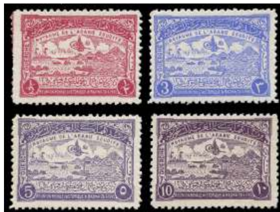
692 ★★ Saudi Arabia, 1945, Meeting With King Farouk of Egypt complete (Scott 173-176), set of 4, o.g., never hinged, Fine to Very Fine. Scott $145. Estimate $60 - 80