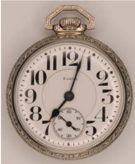
1285 Elgin National Watch Co. vintage pocket watch. Railroad grade 453 Veritas, model 15, 23 jewels. White enamel face with Arabic numerals and double sunk second sweep. Partial plate in nickel. Supreme Illinois Watch Case Co. is nickel plated. Size 16, serial no. 22554547, circa 1920. Excellent condition, working at the time of cataloguing. Estimate $600 - 800