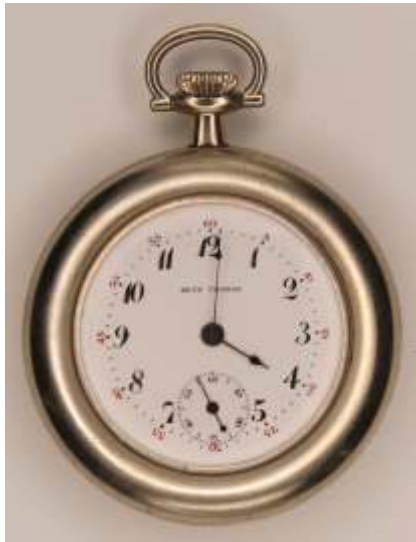
1333 Seth Thomas Clock Co. vintage pocket watch. Grade "Centennial" model 24, 7 jewels. White enamel face with Arabic numerals and sunk second sweep. Partial plate with striped finish. Keystone nickeloid case. Size 4s; serial no. 3080800; circa 1913. Excellent condition, working at the time of cataloguing. Estimate $75 - 100