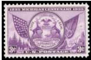
969 ★★ 1935, 3¢ Michigan Centenary (Scott 775), as good as this issue gets, o.g., never hinged, Superb; with 2023 P.F. certificate graded Gem 100 . SMQ $200. Estimate $150 - 200