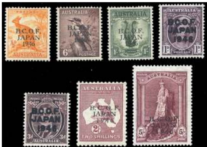
123 ★ Australia, B.C.O.F., 1946-47, ½d to 5s complete (SG J1/7), o.g., lightly hinged, Fine to Very Fine. SG £200 ($260). Scott M1-M7; $210. Estimate $75 - 100