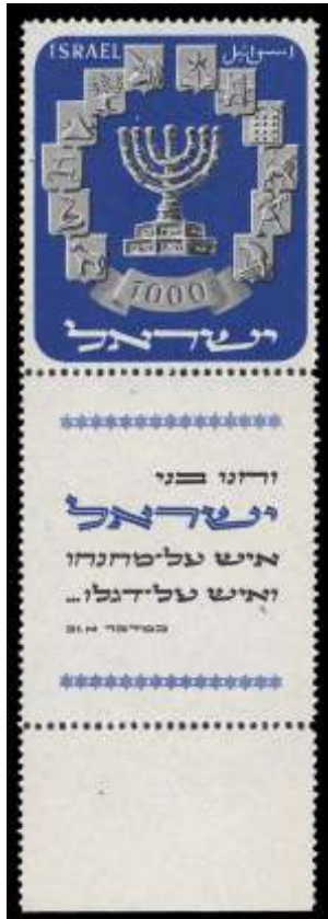
671 ★★ Israel, 1952, 1000p Menorah, with tab (Scott 55) , o.g., never hinged, Very Fine. Scott $225. Bale 59. Estimate $75 - 100