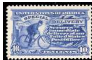
1130 ★ Special Delivery, 1911, 10¢ ultramarine (Scott E8), gorgeous centering and brilliant color, o.g., hinged, Very Fine to Extremely Fine. Scott $120. Estimate $75 - 100