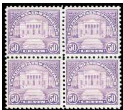
917 ★★田 1922, 50¢ Arlington Amphitheater (Scott 570), block of 4, o.g., never hinged (gum skips), Very Fine. Scott $280. Estimate $80 - 120