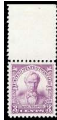
959 ★★ 1932, 3¢ Daniel Webster (Scott 725), outstandingly choice, o.g., never hinged, Superb; with 2007 P.S.E. certificate graded SUP 98 . SMQ $110. Estimate $75 - 100