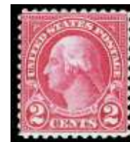
927 ★ 1923, 2¢ Washington, rotary press coil waste (Scott 595), o.g., lightly hinged, Fine. Scott $240. Estimate $60 - 80