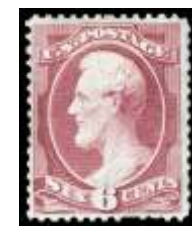
788 ★ 1882, 6¢ Lincoln, rose, re-engraved (Scott 208), o.g., hinged; perf. flaws, otherwise Fine to Very Fine. Scott $825. Estimate $150 - 200