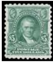
884 ★★ 1917, 5¢ Marshall, perf. 10 (Scott 480), o.g., never hinged, Very Fine. Scott $375. Estimate $200 - 300