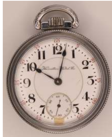
1315 Hamilton Watch Co. vintage pocket watch. Grade 940, model 1, 21 jewels. White enamel face (chipped and hariline) with Arabic numerals and double sunk second sweep. Partial plate in nickel. Satr Watch Case Co. "Defiance" base metal. Size 18, serial no. 477736, circa 1906. Very good condition, working at the time of cataloguing. Estimate $250 - 350