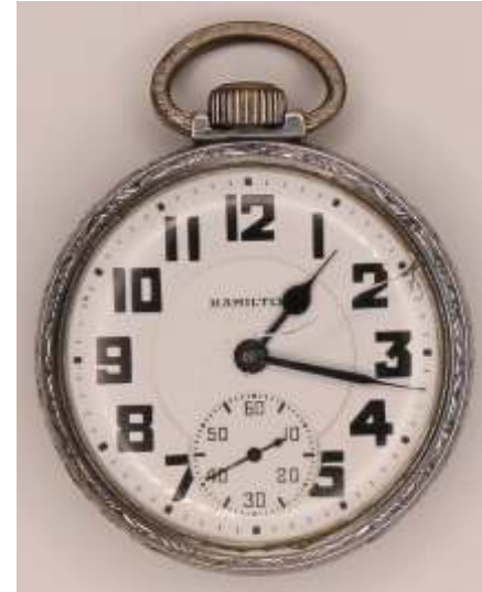
1316 Hamilton Watch Co. vintage pocket watch. Railroad grade 992, model 2, 21 jewels. White enamel face (cracked crystal) with Arabic numerals and double sunk second sweep. Partial plate in nickel. Illinois Watch Case Co. Spartan white gold plated. Size 16, serial no. 1519772, circa 1920. Good condition, working at the time of cataloguing. Estimate $250 - 350