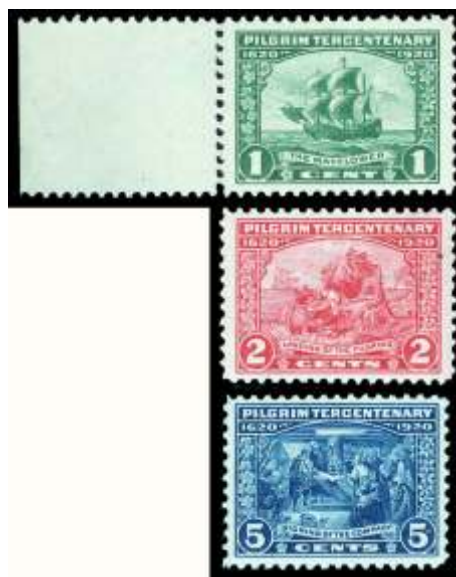
906 ★★ 1920, Pilgrim issue complete (Scott 548-550), set of 3, o.g., never hinged, 1¢ and 2¢ are Very Fine jumbos, the 5¢ is F.-V.F. Scott $94. Estimate $40 - 60