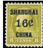
1141 ★ Offices in China, 1919, 16¢ on 8¢ olive bister (Scott K8), o.g., hinged, Fine to Very Fine. Scott $65. Estimate $30 - 40