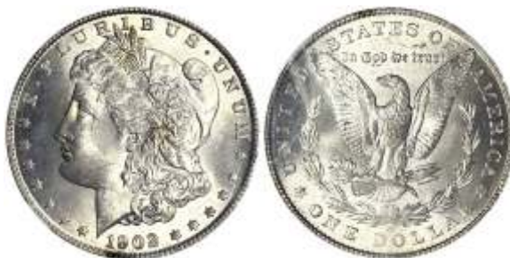
1251 1902 Morgan Dollar, NGC graded Mint State 64. Minor stain on obverse (not noted on slab). Greysheet $300, CPG $390. Estimate $150 - 200