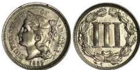
1234 1865 Nickel Three Cents;. Scratch on obverse, Almost Uncirculated or better. Estimate $40 - 60