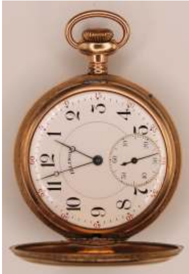
1325 Illinois Watch Co. vintage pocket watch. Grade 305, model 6, 17 jewels. White enamel face with Arabic numerals and double sunk second sweep. Bridgel plate in nickel. Case is stamped with a crown and guaranteed 20 years gold plated. Size 16, serial no. 3866871, circa 1921. Excellent condition, working at the time of cataloguing. Estimate $250 - 350