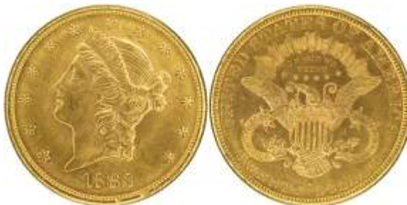
1262 1883-S Gold $5 Liberty, About Uncirculated. Estimate $400 - 600