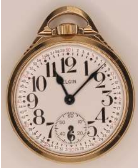
1294 Elgin National Watch Co. vintage pocket watch. Railroad grade 571, model 20, 21 jewels. White enamel face with Arabic numerals and sunk second sweep with iridescent hands. Full plate in nickel. Keystone Watch Case Co. J. BOSS 10KYG filled. Size 68, serial no. U624391, circa 1947. Excellent condition, working at the time of cataloguing.