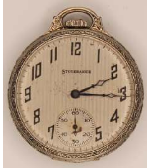
1336 South Bend Watch Co. vintage pocket watch. Grade Studebaker, model 1, 21 jewels. White gold enamel face with Arabic numerals and sunk second sweep. Bridge plate in nickel. Size 12, serial no. 1125607, circa 1925. Very good condition, working at the time of cataloguing. Estimate $150 - 200