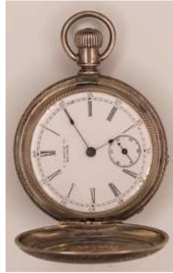
1339 U.S. Watch Co. vintage pocket watch. Grade 64, model 1889, 11 jewels, side winding. White enamel face with Roman numerals and sunk second sweep. Full plate in gilded gold/steel. Case nickel plated. Size 6, serial no. 35148, circa 1889. Good condition, not working at the time of cataloguing. Estimate $100 - 150