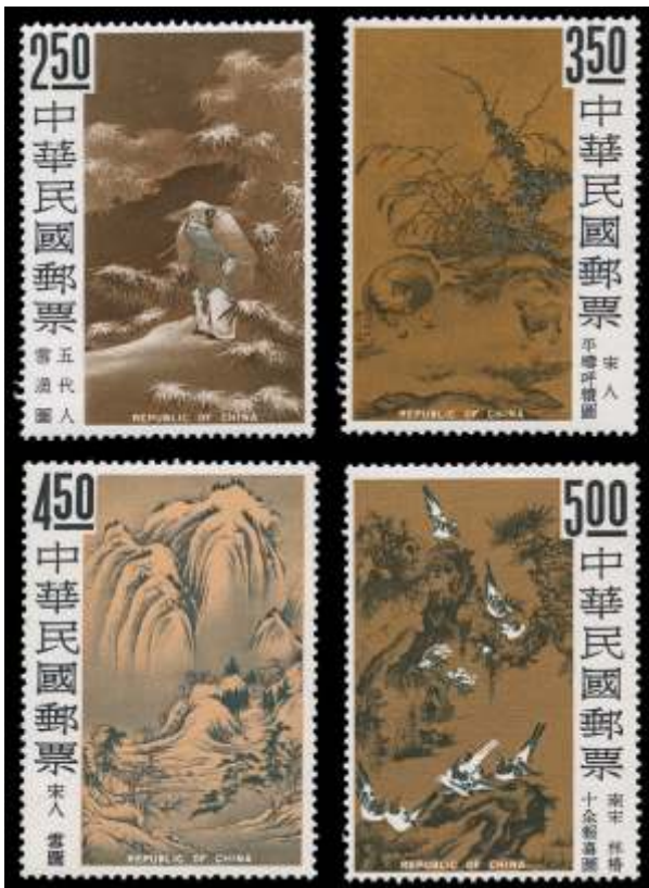
541 ★★ China: Taiwan, 1966, Palace Museum Paintings (3rd series) complete (Scott 1479-1482), set of 4, o.g., never hinged, Fine to Very Fine. Scott $139. Estimate $60 - 80