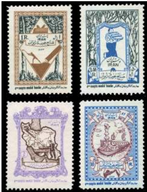
659 ★★ Iran, 1954, World Forestry Congress complete (Scott 995-998) , set of 4, o.g., never hinged, Very Fine. Scott $265 for hinged. Estimate $100 - 150