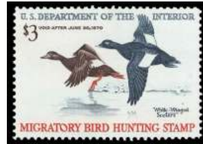
1187 ★★ Federal Duck Stamp, 1969, $3 White-Winged Scoters (Scott RW36), beautiful centering, o.g., never hinged, Extremely Fine to Superb; with 2017 P.S.E. certificate graded XF-SUP 95J . Scott $65. SMQ $375. Estimate $180 - 240