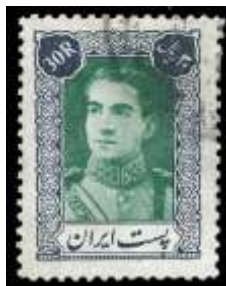
654 ○ Iran, 1942, 30r Mohammad Reza Shah Pahlavi (Scott 904) , neat corner c.d.s., Very Fine. Scott $175. Estimate $60 - 80