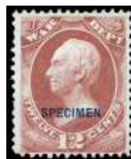
1150 S War Dept., 1875 Special Printing, 12¢ deep rose, overprinted "Specimen" (Scott O89SD), fresh and well centered, without gum as issued, Very Fine to Extremely Fine; with 2021 P.S.A.G. certificate. Scott $1,400. Estimate $750 - 1,000