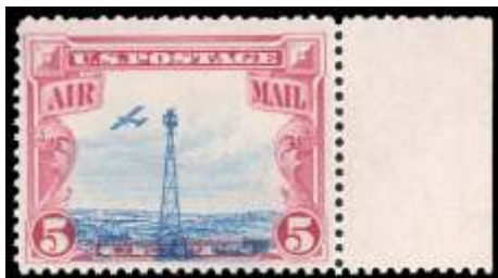
1114 ★★ Airmail, 1928, 5¢ Beacon (Scott C11 var.), "sinking beacon" variety - showing a strong downward shift of the central vignette, o.g., never hinged, Fine to Very Fine; with photocopy of 2016 P.S.E. certificate for block. Estimate $500 - 750