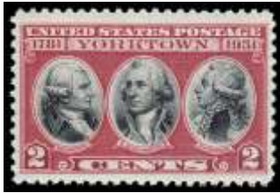
956 ★★ 1931, 2¢ Yorktown, dark lake & black (Scott 703b), much better centered than usual for this issue, o.g., never hinged, Very Fine; with 2023 P.F. certificate graded VF 80 . Scott $500. SMQ $800. Estimate $600 - 800