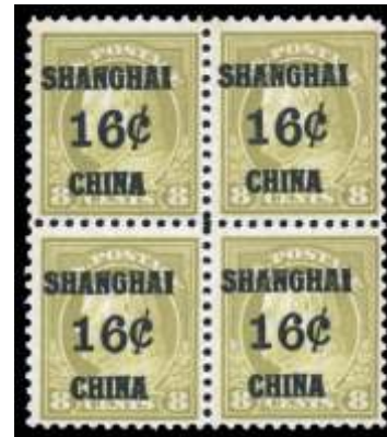
1142 ★★/★田 Offices in China, 1919, 16¢ on 8¢ olive bister (Scott K8), block of 4, fresh, o.g., lightly hinged at top, never hinged at bottom, Fine to Very Fine. Scott $470. Estimate $180 - 240