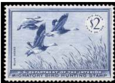
1180 ★★ Federal Duck Stamp, 1955, $2 Blue Geese (Scott RW22), near perfect centering, o.g., never hinged; a small gum crease, Fine to Very Fine overall; with 2023 P.S.E. certificate. Scott $85. Estimate $40 - 60