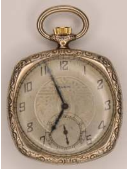
1289 Elgin National Watch Co. vintage pocket watch. 315, model 3, 15 jewels. Silver enamel face with Arabic numerals and sunk second sweep. Partial plate in nickel. Brooklyn Watch Case Co. Monarch is nickel plated. Size 12, serial no. 28563972, circa 1926. Very good condition, working at the time of cataloguing. Estimate $300 - 400