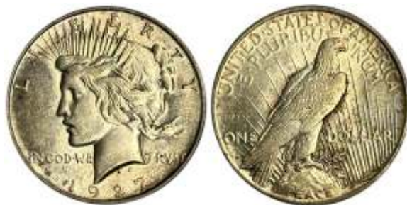
1253 1927-D Peace Dollar, Uncirculated. Toned. Greysheet for MS60 is $290. Estimate $200 - 300