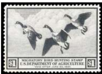
1168 ★★ Federal Duck Stamp, 1936, $1 Canada Geese (Scott RW3), gorgeous centering, o.g., never hinged, Extremely Fine; with 2023 P.S.E. certificate graded XF 90. Scott $325. SMQ $500. Estimate $350 - 500