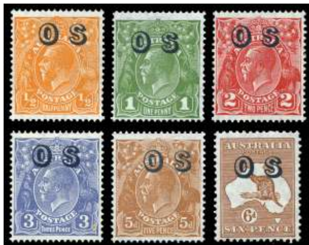
125 ★★ Australia, Officials, 1932-33, ½d to 6d complete, overprinted "O.S." (SG O128/133), C of A watermark, set of 6, o.g., never hinged, Fine to Very Fine. SG £153 for hinged ($200). Scott O6-O11; $275 for n.h. Estimate $80 - 120