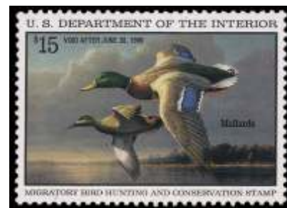
1195 ★★ Federal Duck Stamp, 1995, $15 Mallards (Scott RW62), a gem, perfect in every respect, o.g., never hinged, Superb; with 2022 P.S.E. certificate graded SUP 98 . SMQ $125. Estimate $80 - 120