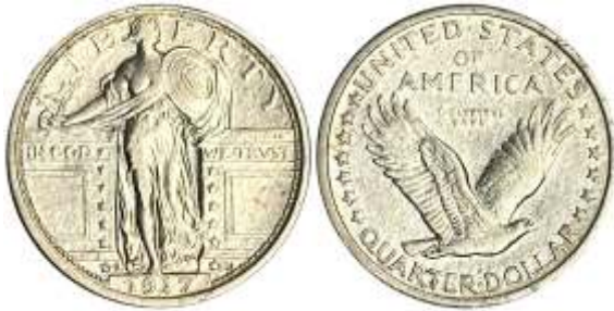
1238 1917-D Liberty Standing Quarter Dollar. Type 1, Very Fine. Estimate $60 - 80