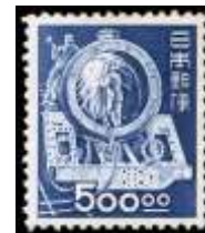
594 ★ Japan, 1952, Showa Unwatermarked Series, 500y Locomotive Assembly (J.S.C.A. 333), o.g., lightly hinged, Very Fine. J.S.C.A. 75,000 yen ($540). Scott 521B; $450 for n.h. Estimate $120 - 180