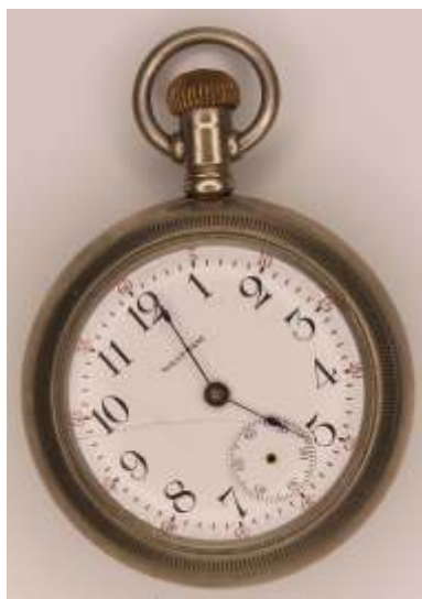
1349 Waltham Watch Co. vintage pocket watch. Grade 1, model 1883, 7 jewels. White enamel face (hairlines) with Arabic numerals and sunk second sweep. Full plate in gold. Philadelphia Watch Case Co. silverode. Size 18, serial no. 14671576, circa 1905. Good condition, not working at the time of cataloguing. Estimate $150 - 200