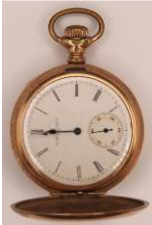
1297 Elgin National Watch Co. vintage pocket watch. Grade 290, model 6, 7 jewels. White enamel face with Roman numerals and sunk second sweep. Partial plate in nickel. Case guaranteed 20 year gold plated. Size 16, serial no. 22568207, circa 1920. Very good condition, not working at the time of cataloguing. Estimate $250 - 350