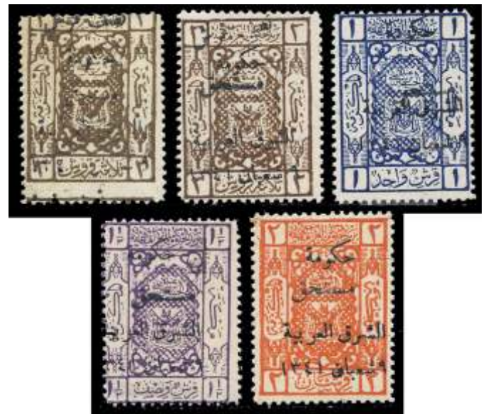
676 ★ Jordan, Postage Dues, 1923, Sur-charged set complete (Scott J1-J5) , o.g., hinged. Scott $149. Estimate $50 - 75