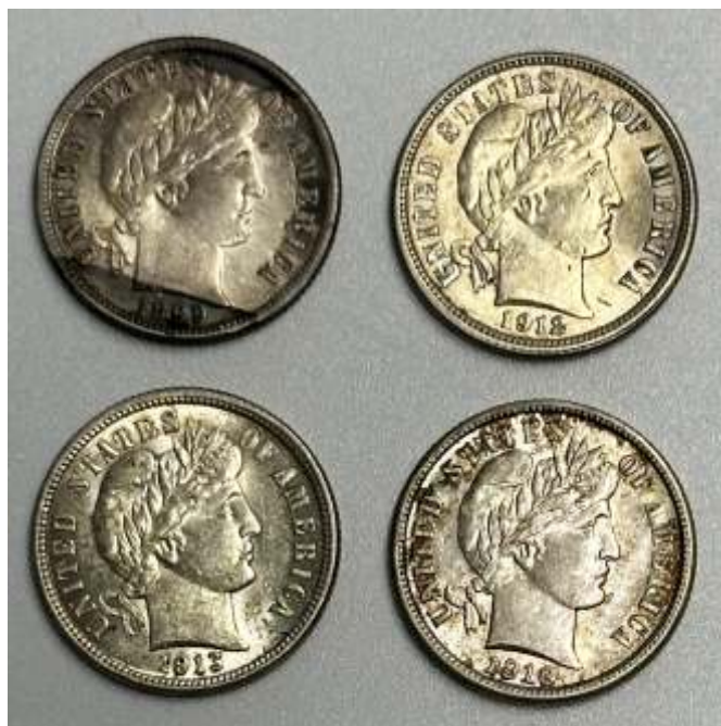
1236 1899-1916-S Barber Dimes. Group of 4, including 1899 XF, 1912 AU+, 1913 AU+ and 1916-S AU. Estimate $180 - 240