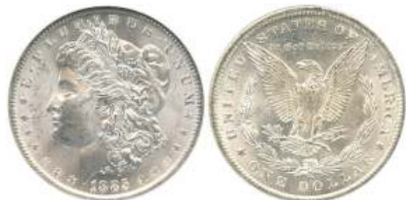
1248 1885-O Morgan Dollar, NGC graded Mint State 63. Greysheet $77, CPG $104. Estimate $50 - 75