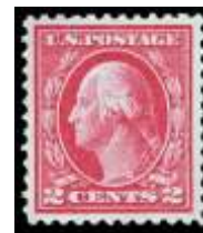
888 ★ 1917, 2¢ Washington, rose, type I, perf. 11 (Scott 499), intense shade and great centering, o.g., hinged, Extremely Fine to Superb; with 2023 P.S.E. certificate graded XF-SUP 95. SMQ $90. Estimate $60 - 80