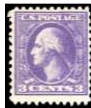
901 ★ 1918, 3¢ Washington, violet, type III, offset printing, double impression (Scott 529a), o.g., hinged, Fine to Very Fine. Scott $50. Estimate $30 - 40