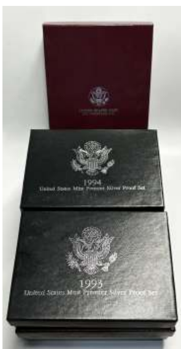
1278 1988-1998 Premier Silver Proof sets. A group of 7. Each in their original box: 1993 (2), 1994 (2), 1997 and 1998; also includes a 1988 Prestige set. Retail value approximately $230. Estimate $80 - 120