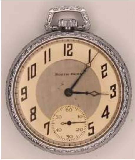
1337 South Bend Watch Co. vintage pocket watch. Grade 429, model 1, 19 jewels. Off white and silver face with Arabic numerals and double sunk second sweep. Bridge plate in nickel. Starwood Watch Case Co. Emperor quality. Size 12, serial no. 1217217, circa 1928. Very good condition, working at the time of cataloguing. Estimate $150 - 200