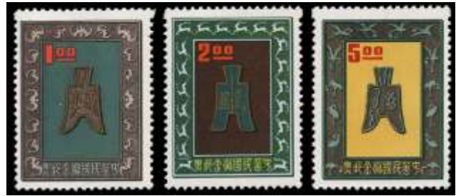
542 ★★ China: Taiwan, Postal Savings, 1962, $1 to $5 complete, set of 3, o.g., never hinged, Fine to Very Fine. Estimate $100 - 150