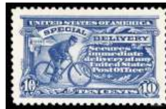
1131 ★ Special Delivery, 1917, 10¢ ultramarine, "pink back" variety (Scott E11 var.), a gem example of this popular variety, featuring essentially perfect centering within jumbo margins, o.g., hinged, Superb; with 2007 P.S.E. certificate graded SUP 98J . SMQ $560. Estimate $350 - 500