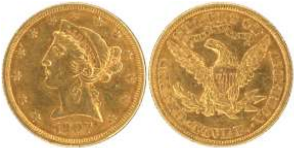
1264 1907 Gold $5 Liberty, Extremely Fine. Estimate $400 - 600