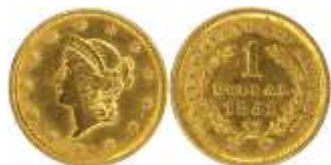
1255 1851 Gold $1 Liberty, About Uncirculated. Estimate $250 - 350