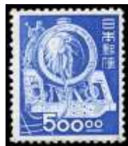
591 ★ Japan, 1949, Occupational Series, 500y Locomotive Assembly, watermarked (J.S.C.A. 323), o.g., very lightly hinged, Fine to Very Fine. J.S.C.A. 85,000 yen ($610). Scott 436; $550 for n.h. Estimate $120 - 180