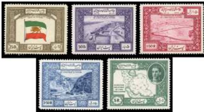
655 ★★ Iran, 1949, Iran's Contribution to WW2 Victory (Scott 910-914) , set of 5, o.g., never hinged, Fine to Very Fine. Scott $105 for hinged. Estimate $50 - 75