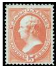
784 ★★ 1879, 15¢ Webster, red orange, A.B.N.C. printing (Scott 189), vibrant color, o.g., never hinged, Fine to Very Fine. Scott $600. Estimate $200 - 300