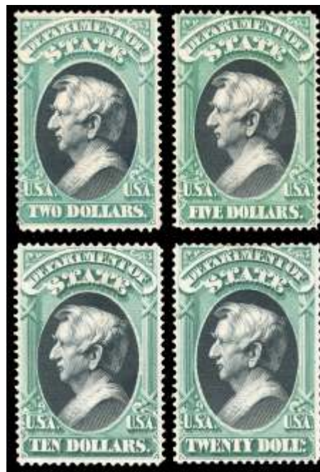
1148 State Dept., 1873, $2 to $20 high values, reproductions (Scott O68-O71 vars.), Fine to Very Fine. Originals catalog $24,300. Estimate $100 - 150