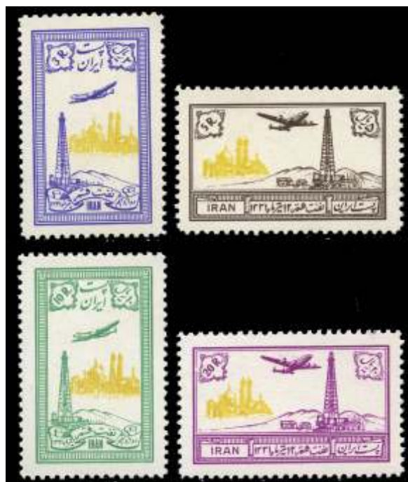
664 ★★ Iran , Airmail, 1953, Discovery of Oil at Qum complete (Scott C79-C82), set of 4, o.g., never hinged, Very Fine. Scott $200 for hinged. Estimate $80 - 120