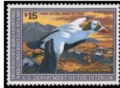
1193 ★★ Federal Duck Stamp, 1992, $15 Spectacled Eider (Scott RW59), gorgeous centering, o.g., never hinged, Extremely Fine to Superb; with 2022 P.S.E. certificate graded XF-SUP 95 . SMQ $150. Estimate $100 - 150