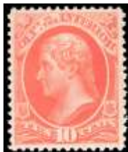
1147 ★ Interior Dept., 1873, 10¢ vermilion (Scott O19), o.g., hinged, almost Very Fine; with 2022 P.F. certificate for block. Scott $70. Estimate $40 - 60