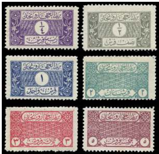
690 ★ Saudi Arabia, Hejaz and Nejd, 1926, 1st Unified Kingdom Issue, ¼pi to 5pi complete (Scott 69-74), set of 6, o.g., lightly hinged, Fine to Very Fine. Scott $270. SG 254/260. Estimate $75 - 100