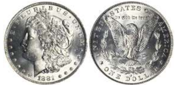
1243 1881-O Morgan Dollar, PCGS graded Mint State 63. Greysheet $90, CPG $122. Estimate $60 - 80