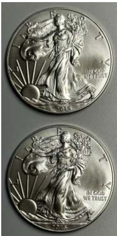
1271 2015-W Silver $1 Eagles. Two identical coins with Govt. mint certificates, Uncirculated. Estimate $60 - 80