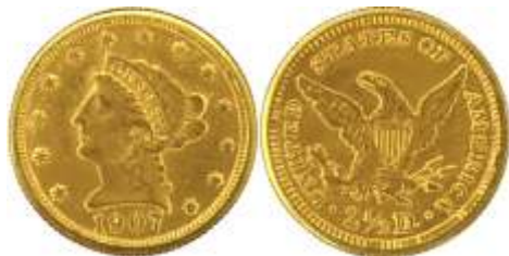
1258 1907 Gold $2.50 Liberty, Extremely Fine. Estimate $300 - 400