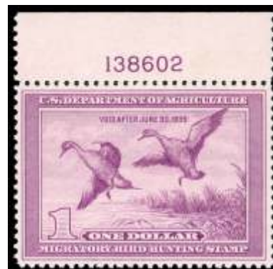
1170 ★★ Federal Duck Stamp, 1938, $1 Pintail Drakes (Scott RW5), a beautiful top plate number single, o.g., never hinged, Extremely Fine; with 2009 P.S.E. certificate graded XF 90. Scott $425. SMQ $850. Estimate $600 - 800