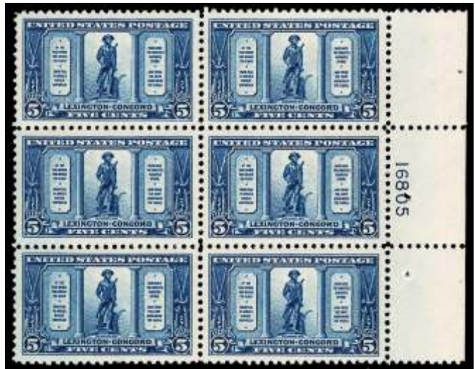
937 ★★田 1925, 5¢ Lexington-Concord (Scott 619), plate block of 6, o.g., never hinged, Extremely Fine. Scott $275. Estimate $150 - 200