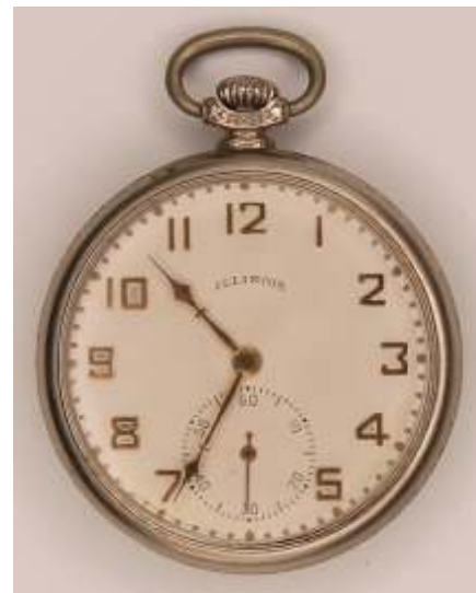
1328 Illinois Watch Co. vintage pocket watch. Grade 274, model 1, 21 jewels. White enamel face with Arabic numerals in gold and second sweep. Partial plate in nickel. Keystone Watch Case Co. J. BOSS 14kt gold filled. Size 12, serial no. 4798781, circa 1926. Very good condition, not working at the time of cataloguing. Estimate $150 - 200