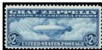
1117 ★★ Airmail, 1930, $2.60 Graf Zeppelin (Scott C15), o.g., never hinged, Fine to Very Fine. Scott $850. Estimate $400 - 600