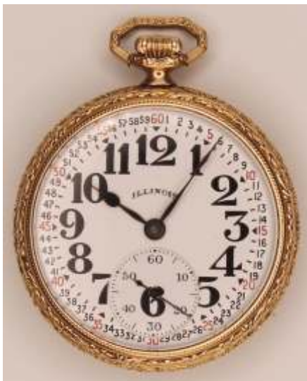
1322 Illinois Watch Co. vintage pocket watch. Grade 706, model 9, 19 jewels with chain and holiday pendant. White enamel face Montgomery dial with Arabic numerals and sunk second sweep. Bridge plate in nickel. Case is gold plated. Size 16, serial no. 4665808, circa 1925. Excellent condition, working at the time of cataloguing. Estimate $500 - 750