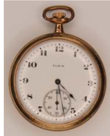
1303 Elgin National Watch Co. vintage pocket watch. Grade 303, model 3, 7 jewels. White enamel face with Arabic numerals and sunk second sweep. Partial plate in nickel. Illinois Watch Case Co. 10 year guaranteed yellow filled. Size 12, serial no. 22757127, circa 1920. Excellent condition, working at the time of cataloguing. Estimate $100 - 150