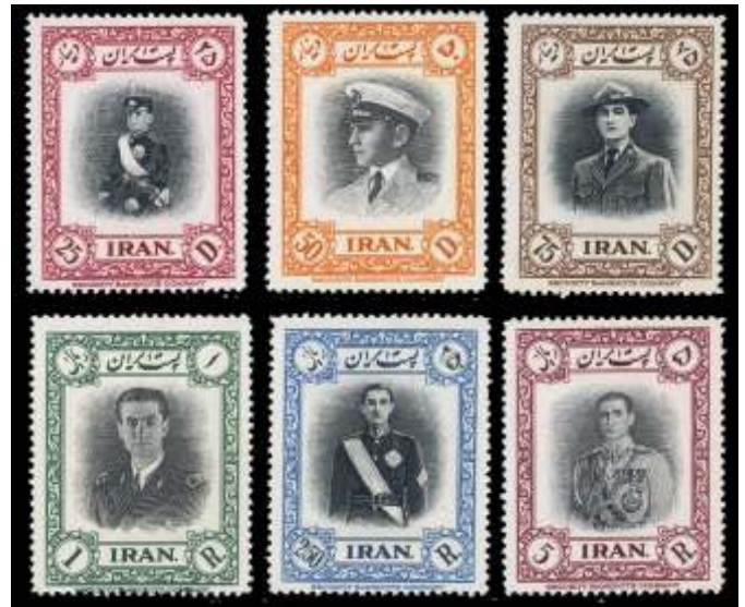
656 ★ Iran, 1950, Mohammad Reza Shah Pahlavi Birthday complete (Scott 935-940) . Scott $140 for hinged. Estimate $60 - 80