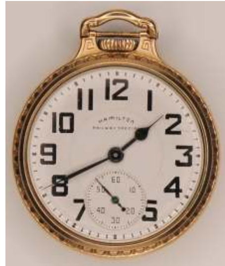
1307 Hamilton Watch Co. vintage pocket watch. Railroad grade 992B, model 5, 21 jewels. White enamel face with Arabic numerals and double sunk second sweep. Partial plate in nickel. Wadsworth 10kt gold filled case. Size 16, serial no. C362738, circa 1952. Excellent condition, working at the time of cataloguing. Estimate $500 - 750