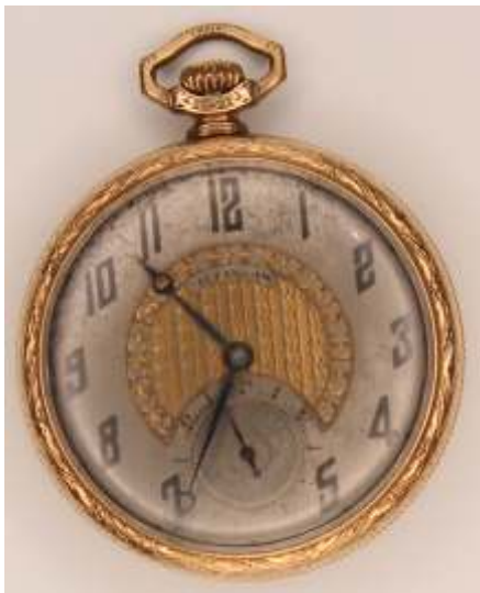
1329 Illinois Watch Co. vintage pocket watch. Grade 403, model 3, 15 jewels. (Ariston was used as a trade name on pocket watch movements manufactured for Marshall Field & Co. by Illinois Watch Co.) Silver and gold face with Arabic numerals and sunk second sweep. Bridge plate in nickel. Keystone Watch Co. Boss 10kt yellow gold filled. Size 12, serial no. 2897798, circa 1916. Very good condition, working at the time of cataloguing. Estimate $100 - 150