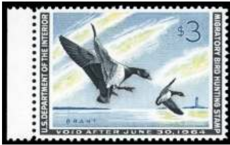
1184 ★★ Federal Duck Stamp, 1963, $3 Brants (Scott RW30), magnificent centering, a very distinguished duck indeed, o.g., never hinged, Extremely Fine to Superb; with 2008 P.S.E. certificate graded XF-SUP 95 . Scott $100. SMQ $200. Estimate $120 - 180