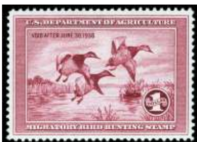
1167 ★ Federal Duck Stamp, 1935, $1 Canvasbacks (Scott RW2), marvelously choice centering, o.g., hinged, Extremely Fine. Scott $375. Estimate $150 - 200