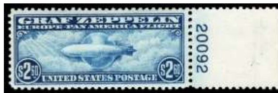
1116 ★★ Airmail, 1930, $2.60 Graf Zeppelin (Scott C15), plate number single, well centered, o.g., never hinged (tiny gum skip, and lightly hinged in selvage only), Very Fine. Scott $850. Estimate $400 - 600