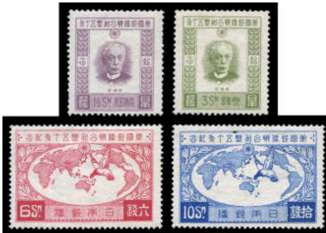
602 ★★ Japan, Commemoratives, 1927, U.P.U. complete (J.S.C.A. C42-45) , set of 4, o.g., never hinged, Fine to Very Fine. J.S.C.A. 59,100 yen for n.h. ($430). Scott 198-201; $150 for hinged. Estimate $80 - 120