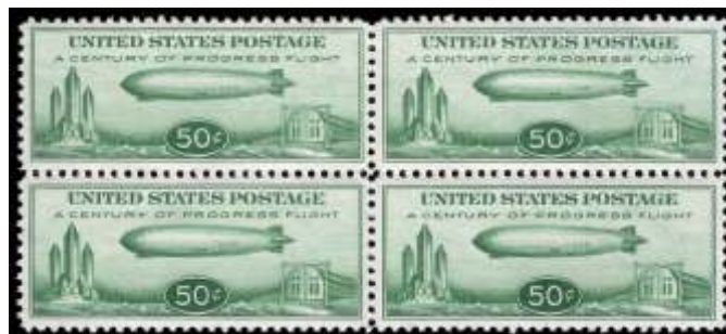
1119 ★★田 Airmail, 1933, 50¢ "Chicago" Zeppelin (Scott C18), block of 4, o.g., never hinged, Extremely Fine to Superb; with 2023 P.S.E. certificate graded XF-SUP 95 . Scott $300. SMQ $720 as singles. Estimate $400 - 600