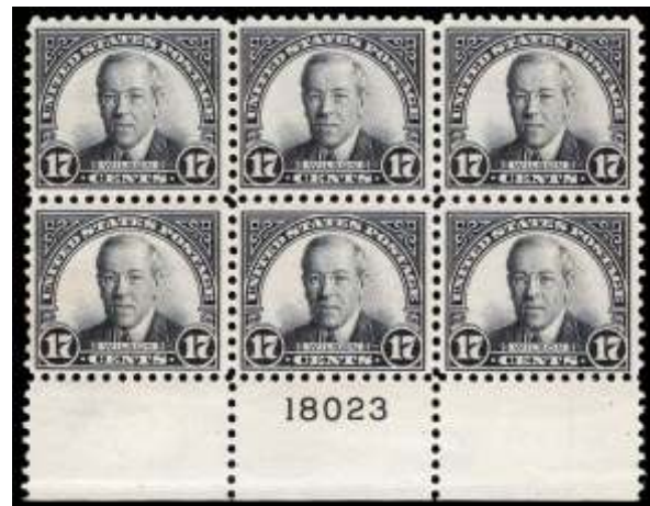
939 ★★/★田 1925, 17¢ Wilson (Scott 623), plate block of 6, o.g., lightly hinged (5 stamps never hinged), Fine to Very Fine. Scott $250. Estimate $80 - 120