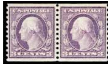
887 ★★ 1917, 3¢ Washington, violet, type I, unwatermarked, horizontal rotary press coil (Scott 493), an unusually well centered pair, rich color, o.g., never hinged, Very Fine to Extremely Fine; with 2009 P.S.E. certificate graded VF-XF 85. Scott $75. SMQ $85. Estimate $60 - 80