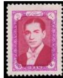
661 ★★ Iran, 1957, 100r Mohammad Reza Shah Pahlavi (Scott 1097) , o.g., never hinged, Very Fine. Scott $200. Estimate $60 - 80