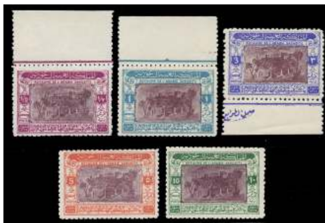
693 ★★ Saudi Arabia, 1950, Anniversary of Capture of Riyadh complete (Scott 180-184), set of 5, o.g., never hinged, Fine to Very Fine. Scott $220. Estimate $75 - 100