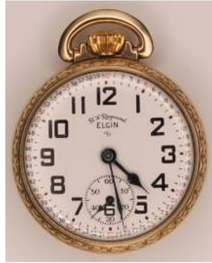
1295 Elgin National Watch Co. vintage pocket watch. Grade 571 B.W. Raymond, model 20, jewels. White enamel face Montgomery dial with Arabic numerals and sunk second sweep. Partial plate in nickel. Star Watch Case Co. 10KY gold filled. Size 16, serial no. l49015, circa 1955. Excellent condition, working at the time of cataloguing.