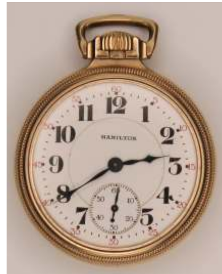
1312 Hamilton Watch Co. vintage pocket watch. Railroad grade 992, model 2, 21 jewels. White enamel face with Arabic numerals and double sunk second sweep. Partial plate in nickel. Keystone Watch Case Co. J.BOSS 10kt gold filled. Size, serial no. 1676637, circa 1923. Excellent condition, working at the time of cataloguing. Estimate $300 - 400