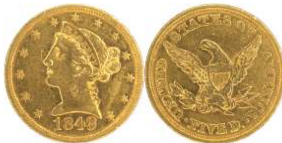
1260 1849 Gold $5 Liberty, Extremely Fine. Estimate $400 - 600