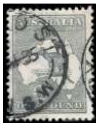
111 ○ Australia, 1924, Kangaroo and Map, £1 gray (SG 75) , 3rd watermark, Fine to Very Fine used. SG £350 ($450). Scott 57; $350. Estimate $100 - 150