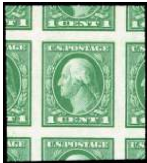
885 ★★ 1916, 1¢ Washington, green, unwatermarked, imperf. (Scott 481), showing parts of the eight adjacent stamps, o.g., never hinged, Superb; with 2022 P.F. certificate graded Gem 100J. Scott $2. SMQ $75+. Estimate $50 - 75