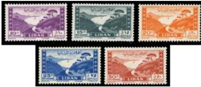
684 ★ Lebanon, Airmail, 1949, Bay of Jounie complete (Scott C145A-C147B) , set of 5, o.g., lightly hinged, Fine to Very Fine. Scott $385 for n.h. Estimate $80 - 120