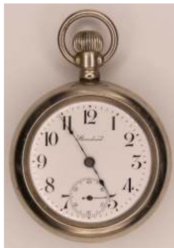
1332 New York Standard Watch Co. vintage pocket watch. First Run. Introduced October 1905. Some gilt movements. Grade 65, model 15, 7 jewels. White enamel face with Arabic numerals and double sunk second sweep. Partial plate in nickel. Philadelphia Watch Case Co. Silverode. Size 18, serial no. 3765544, circa 1906. Very good condition, working at the time of cataloguing. Estimate $75 - 100