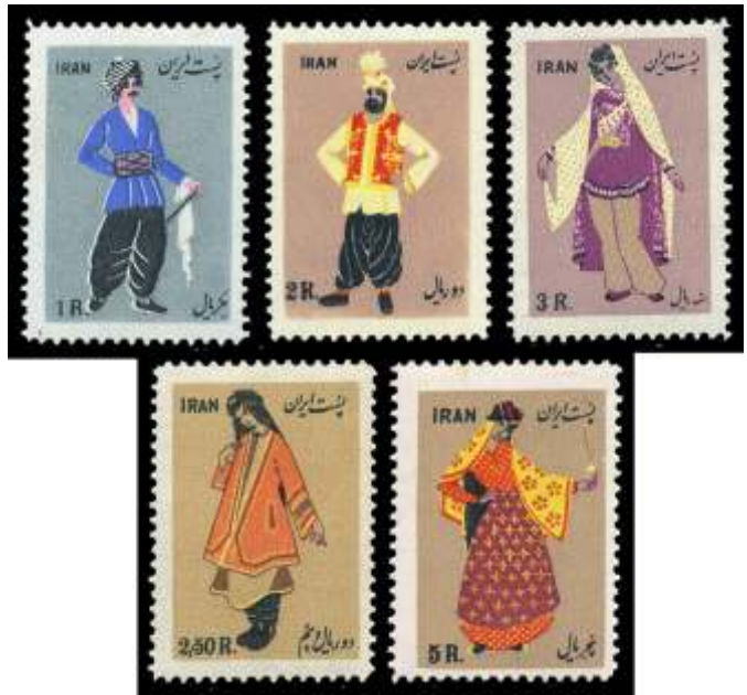
660 ★★ Iran, 1955, Regional Costumes complete (Scott 1015-1019) , set of 5, o.g., never hinged, Very Fine. Scott $125 for hinged. Estimate $60 - 80