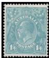
113 ★★ Australia, 1932, King George V, 1s4d turquoise (SG 131) , C of A watermark, o.g., never hinged, Fine to Very Fine. SG £55 for hinged ($70). Scott 124; $145 for n.h. Estimate $50 - 75