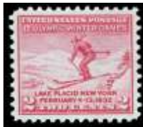
957 ★★ 1932, 2¢ Winter Olympics (Scott 716), super centering, o.g., never hinged, Extremely Fine to Superb; with 2023 P.S.E. certificate graded XF-SUP 95 . SMQ $45. Estimate $30 - 40