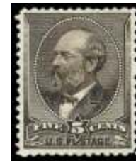
786 (★) 1882, 5¢ Garfield, yellow brown (Scott 205), beautifully well centered, unused without gum, Very Fine; with 1957 P.F. certificate. Scott $90. Estimate $50 - 75