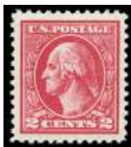
899 ★★ 1918, 2¢ Washington, carmine, type VII, offset printing (Scott 528B), o.g., never hinged, Extremely Fine; with 2020 P.S.A.G. certificate graded XF 90. SMQ $125. Estimate $80 - 120