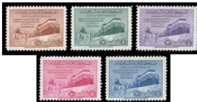
694 ★★ Saudi Arabia, 1952, Dammam-Riyadh Railway complete (Scott 187-191), set of 5, o.g., never hinged, Fine to Very Fine. Scott $144. Estimate $60 - 80