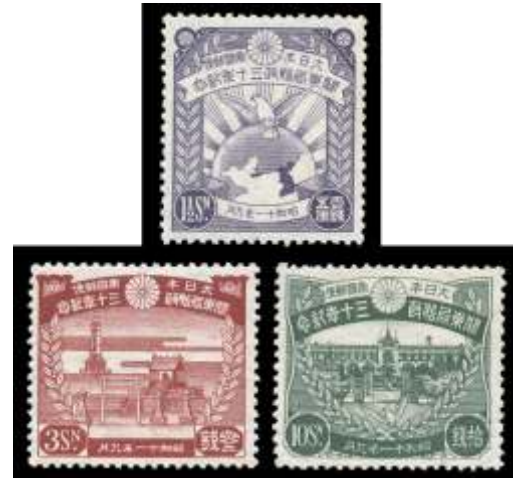
603 ★★ Japan, Commemoratives, 1936, Kwantung complete (J.S.C.A. C65-67) , set of 3, o.g., never hinged, Fine to Very Fine. J.S.C.A. 62,500 yen for n.h. ($450). Scott 227-229; $299 for hinged. Estimate $150 - 200