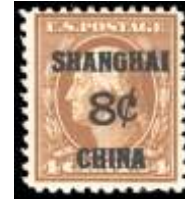
1140 ★★ Offices in China, 1919, 8¢ on 4¢ brown (Scott K4), owner handstamp on reverse, o.g., never hinged, Fine. Scott $140. Estimate $30 - 40