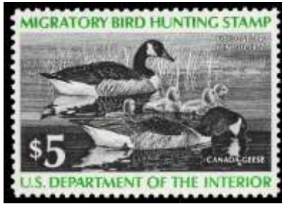
1190 ★★ Federal Duck Stamp, 1976, $5 Canada Geese (Scott RW43), o.g., never hinged, Superb; with photocopy of 2005 P.S.E. certificate graded SUP 98 . SMQ $140. Estimate $75 - 100