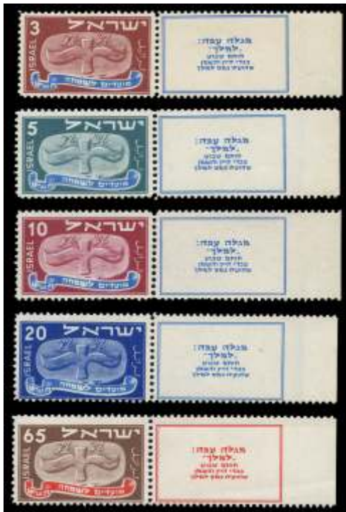
668 ★★ Israel, 1948, New Year complete, with tabs (Scott 10-14), set of 5, o.g., never hinged, Fine to Very Fine. Scott $225. Bale 10-14; $275. Estimate $75 - 100