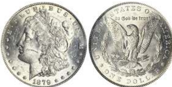
1241 1879 Morgan Dollar, PCGS graded Mint State 63. Greysheet $120, CPG $156. Estimate $80 - 120