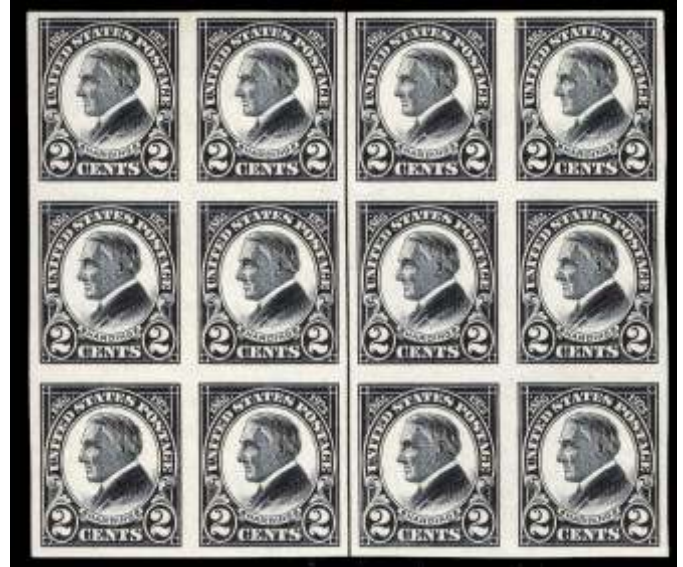
932 ★★田 1923, 2¢ Harding, imperf. (Scott 611), block of 12 with center line, o.g., never hinged, Very Fine. Scott $120 as 6 pairs. Estimate $40 - 60