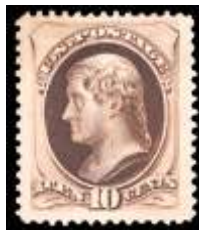
783 ★ 1879, 10¢ Jefferson, brown, A.B.N.C. printing, with secret mark (Scott 188), bright and fresh with spectacular margins, o.g., lightly hinged, a magnificent Very Fine to Extremely Fine jumbo; with 2021 P.S.A.G. certificate graded VF-XF 85 and ungraded 1986 P.F. certificate. Scott $1,800. SMQ $2,750. Estimate $1,800 - 2,400