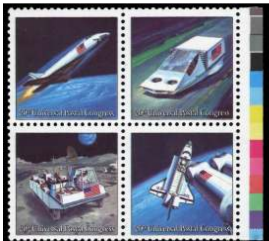
1127 ★★田 Airmail, 1989, 45¢ U.P.U. Congress, se-tenant block of 4, light blue (engraved) omitted (Scott C125b), o.g., never hinged, Fine to Very Fine, only 20-30 blocks reported. Scott $500. Estimate $200 - 300