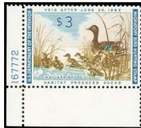
1182 ★★ Federal Duck Stamp, 1961, $3 Mallards (Scott RW28), a wonderfully choice plate number single, o.g., never hinged, Superb; with 2006 P.S.E. certificate graded SUP 98. Scott $95. SMQ $350. Estimate $250 - 350