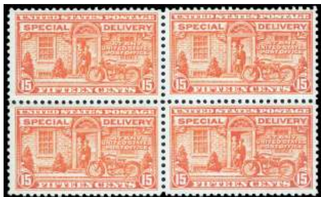
1133 ★★田 Special Delivery, 1925, 15¢ deep orange (Scott E13), block of 4, o.g., never hinged, Very Fine. Scott $300. Estimate $100 - 150