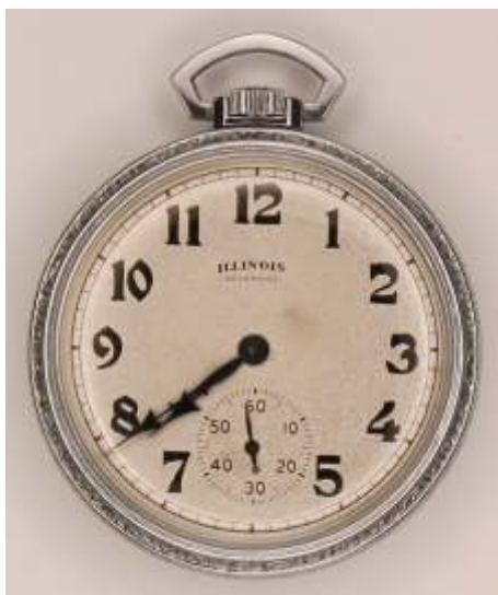
1330 Illinois Watch Co. vintage pocket watch. Grade 273, model 1, 17 jewels. White enamel face with Arabic numerals and flush second sweep. Partial plate in nickel. Case is Keystone metal. Size 12, serial no. 2328216, circa 1911. Very good condition, working at the time of cataloguing. Estimate $50 - 75