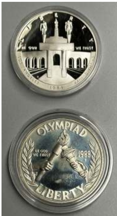
1268 1984-1988 Olympic Silver Dollars. Proofs. Including 1984-P Olympic Coliseum Silver Dollar and 1988-S Seoul Olympiad Silver Dollar; both in original boxes with papers.