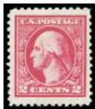
898 ★★ 1918, 2¢ Washington, carmine, type Va, offset printing (Scott 528), o.g., never hinged, a Very Fine to Extremely Fine jumbo. Scott $23. Estimate $40 - 60