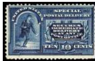
1129 ★ Special Delivery, 1895, 10¢ blue (Scott E5), slightly disturbed o.g., hinged; a few perf flaws, otherwise Fine. Scott $210. Estimate $40 - 60