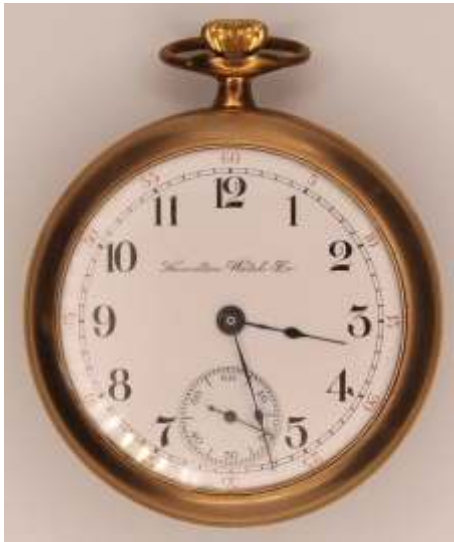
1317 Hamilton Watch Co. vintage pocket watch. Grade 926, model 1, 17 jewels. White enamel face with Arabic numerals and sunk second sweep. Full plate in nickel. North American Watch Case Co. guaranteed 20 year gold plated. Size 18, serial no. 262650, circa 1903. Good condition, working at the time of cataloguing. Estimate $150 - 200