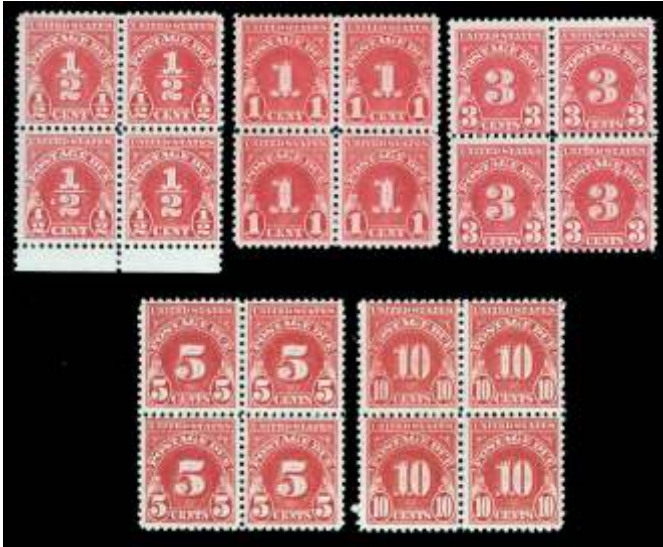
1138 ★★田 Postage Due, 1930, a group of 5 (Scott J69-70, 72-74), blocks of 4, including the, 1/2¢, 1¢, 3¢, 5¢ and 10¢ carmine, o.g., never hinged; two tiny gum skips on two of the 10¢ stamps, Fine to Very Fine. Scott $698. Estimate $120 - 180