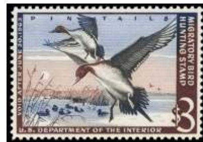
1183 ★ Federal Duck Stamp, 1962, $3 Pintail Drakes (Scott RW29), a wonderfully choice gem with essentially perfect centering, Superb; with 2022 P.S.E. certificate graded SUP 98. Scott $110. SMQ $350. Estimate $250 - 350