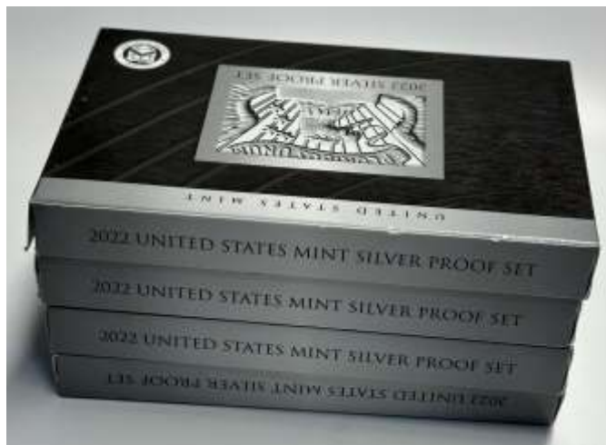
1280 2022 Proof Set. A group of 4. These are still available through the mint for $130 each. Estimate $200 - 300