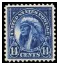
915 ★ 1923, 14¢ American Indian (Scott 565), near perfect centering, o.g., very lightly hinged, Extremely Fine to Superb; with 2022 P.S.E. certificate graded XF-SUP 95 . Estimate $30 - 40