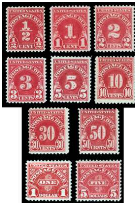
1137 ★★/★ Postage Due, 1930, 1/2¢ to 50¢ carmine (Scott J69-J76), o.g., the 1/2¢, 1¢ and 50¢ are n.h., others are hinged, Fine to Very Fine. Scott $600. Estimate $150 - 200