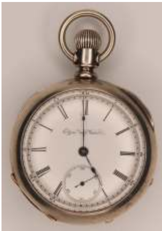
1298 Elgin National Watch Co. vintage pocket watch. Grade 74, model 5, 11 jewels. White enamel face with Roman numerals and sunk second sweep. Full plate in nickel. Keystone coin plated. Size 18, serial no. 2818167, circa 1888. Very good condition, working at the time of cataloguing. Estimate $200 - 300