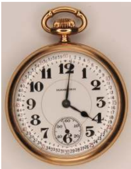
1318 Hampden Watch Co. vintage pocket watch. Grade No. 105, model 5, 21 jewels. White enamel face with Arabic numerals and double sunk second sweep. Bridge plate in nickel. Case is gold plated. B&B Royal 20 year guaranteed. Size 16, serial no. 3316493, circa 1915. Excellent condition, working at the time of cataloguing. Estimate $500 - 750