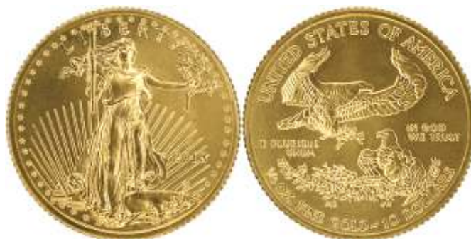
1275 2018 Gold $10 Eagle, Uncirculated. Estimate $500 - 750