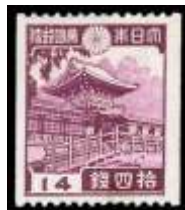
590 ★ Japan, 1938, Showa, 14s rose lake & pale rose, coil (J.S.C.A. 243), o.g., hinged, Fine to Very Fine. J.S.C.A. 31,000 yen ($220). Scott 279; $150. Estimate $50 - 75