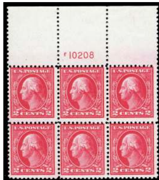
889 ★★田 1917, 2¢ Washington, deep rose, type Ia, perf. 11 (Scott 500), top plate block of 6, vibrant deep color, o.g., never hinged, Fine, a rare plate block. Scott $3,750. Estimate $1,000 - 1,500