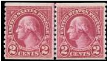
930 ★★ 1929, 2¢ Washington, type II, horizontal rotary press coil (Scott 599A), line pair, o.g., never hinged; some perf. separations, Fine to Very Fine overall; with 2023 P.F. certificate. Scott $1,150. Estimate $400 - 600