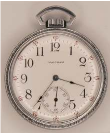
1353 Waltham Watch Co. vintage pocket watch. Grade 210, model 1894, 7 jewels. White enamel face with Arabic numerals and sunk second sweep. Partial plate in nickel. Case is Keystone metal. Size 12, serial no. 26574398, circa 1928. Good condition, working at the time of cataloguing. Estimate $60 - 80