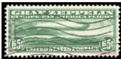
1115 ○ Airmail, 1930, 65¢ Graf Zeppelin (Scott C13), exceptionally choice, neat cancels, Very Fine to Extremely Fine; with 2021 P.S.A.G. certificate graded VF-XF 85 . Scott $160. SMQ $250. Estimate $180 - 240