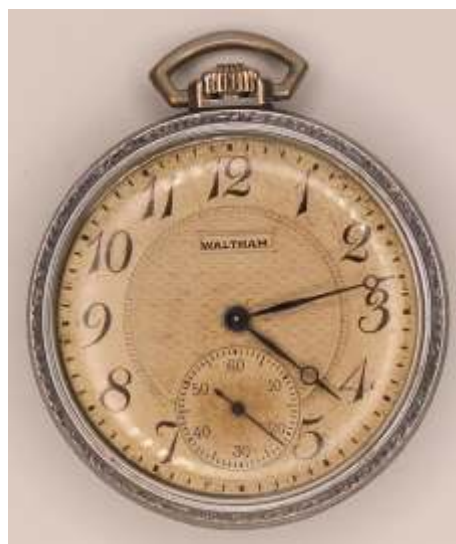
1351 Waltham Watch Co. vintage pocket watch. Grade 225, model 1894, 17 jewels. Off white enamel face with Arabic numerals and double sunk second sweep. Partial plate in nickel. Keystone Watch Case Co. base metal. Size 16, serial no. 22891609, circa 1919. Very good condition, working at the time of cataloguing. Estimate $150 - 200