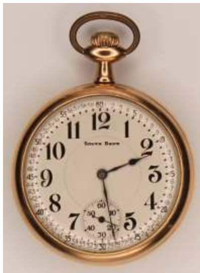
1334 South Bend Watch Co. vintage pocket watch. Grade, model 2, 19 jewels. White enamel face with Arabic numerals and sunk second sweep. Bridge plate in nickel. Case is gold plated. South Bend Watch Co. guaranteed 20 yr. "PANAMA" Size 16, serial no. 911669, circa 1919. Excellent condition, working at the time of cataloguing. Estimate $300 - 400