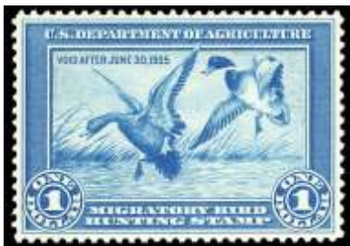
1166 ★★ Federal Duck Stamp, 1934, $1 Mallards (Scott RW1), o.g., never hinged, Extremely Fine. Scott $775. Estimate $500 - 750