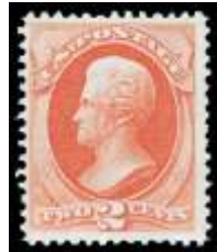
782 ★ 1875, 2¢ Jackson, vermilion, C.B.N.C. printing (Scott 178), radiant fresh color, o.g., barest trace of hinge, Fine to Very Fine; with 2023 P.F. certificate. Scott $325. Estimate $100 - 150