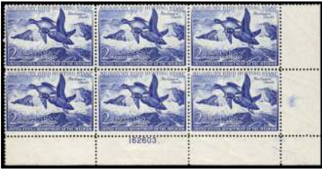
1178 ★★田 Federal Duck Stamp, 1952, $2 Harlequin Ducks (Scott RW19), plate block of 6, o.g., never hinged, Very Fine. Scott $550. Estimate $200 - 300