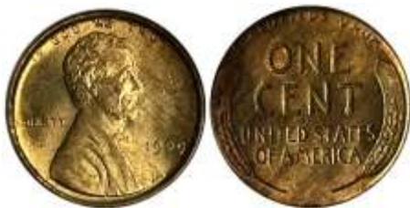
1232 1909 Lincoln Cent. VDB, ANACS graded Mint State 64 Red. Greysheet $80, CPG $108. Estimate $50 - 75