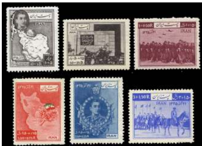
662 ★★ Iran , 1950, Liberation of Azerbaijan Province complete (Scott B22-B27), set of 6, o.g., never hinged, Very Fine. Scott $170. Estimate $60 - 80