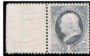
787 ★ 1881, 1¢ Franklin, gray blue, re-engraved, Douglas patent 8-hole punch (Scott 206 var.), sheet margin single, o.g., lightly hinged, Fine to Very Fine; with 2003 P.S.E. certificate. Scott $200. Estimate $75 - 100