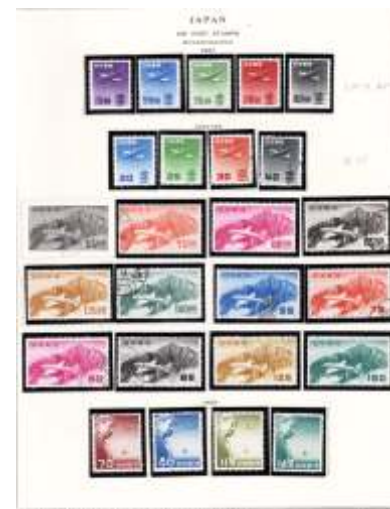
595 ★/○ Japan, Airmail, 1951-53, a mint and used group, in mounts on album pages, Fine to Very Fine. Scott C14//C42; $368. Estimate $50 - 75