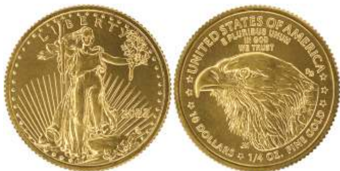
1277 2022 Gold $10 Eagle, Uncirculated. Estimate $500 - 750