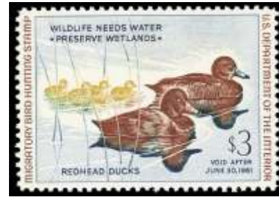
1181 ★★ Federal Duck Stamp, 1960, $3 Red-head Ducks (Scott RW27), a perfectly centered gem, o.g., never hinged, Superb; with 2005 P.S.E. certificate graded SUP 98. Scott $95. SMQ $375. Estimate $250 - 350