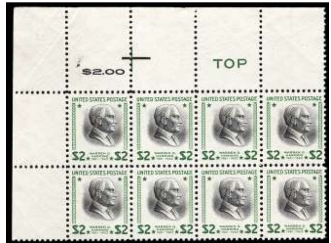
972 ★★田 1938, $2 Harding (Scott 833), plate block of 8, o.g., never hinged; some trivial wrinkling in top selvage, Very Fine overall. Scott $128. Estimate $60 - 80