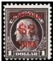
1146 ★★ Offices in China, 1919, $2 on $1 violet brown (Scott K16), o.g., never hinged, Fine. Scott $925. Estimate $120 - 180