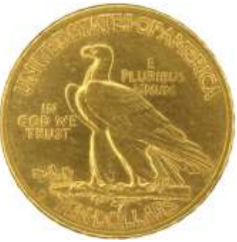
72 1916-S Gold $10 Indian. AU.