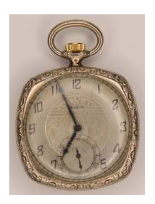
Elgin National Watch Co. vintage pocket watch. 315, model 3, 15 jewels. Silver enamel face with Arabic numerals and sunk second sweep. Partial plate in nickel. Brooklyn Watch Case Co. Monarch is nickel plated. Size 12, serial no. 28563972, circa 1926. Very good condition, working at the time of cataloguing.