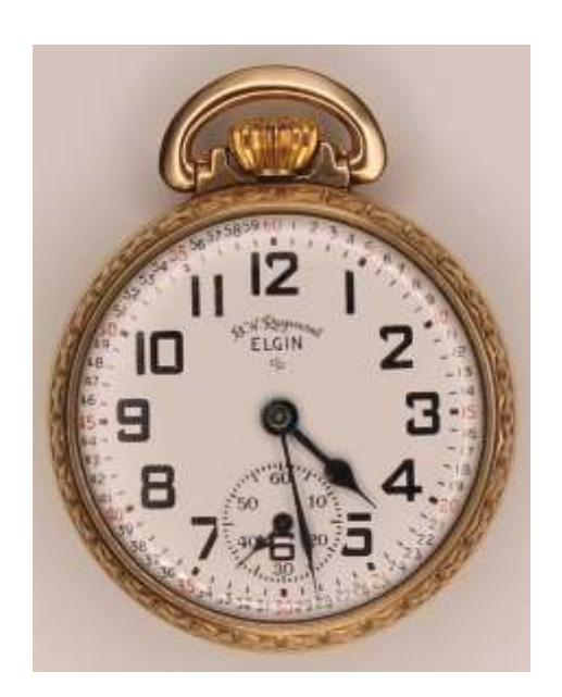
Elgin National Watch Co. vintage pocket watch. Grade 571 B.W. Raymond, model 20, jewels. White enamel face Montgomery dial with Arabic numerals and sunk second sweep. Partial plate in nickel. Star Watch Case Co. 10KY gold filled. Size 16, serial no. I49015, circa 1955. Excellent condition, working at the time of cataloguing.