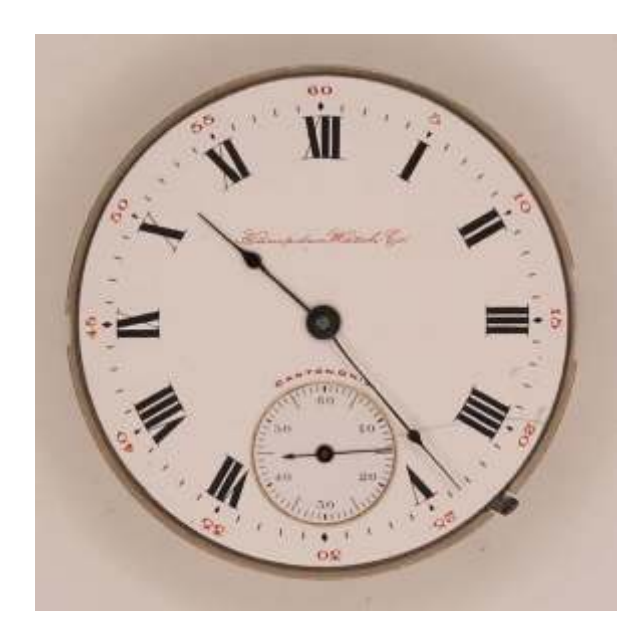
Hampden Watch Co. works only. Grade General Stark, model 4, 17 jewels. White enamel face with Roman numerals and sunk second sweep. Bridge plate in nickel. Size 16, serial no. 2274375, circa 1906. Very good condition.