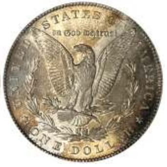
28 1897 Morgan Dollar. PCGS graded MS64. Deeply toned. Greysheet $135, CPG $176. Estimate $80 - 140