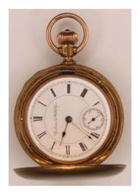
Columbus Watch Co. vintage pocket watch. Grade 41, model 1, 11 jewels, side winding. Sapphire in the wind mechanism. White enamel face with Roman numerals and sunk second sweep. Partial Hunting plate in gilt gold. Paragon Watch Case Co. brass. Size 16, serial no. 154391, circa 1889. Very good condition, working at the time of cataloguing.