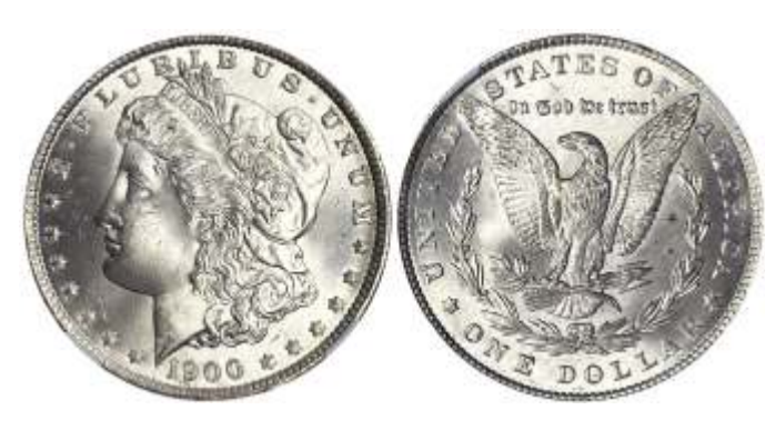
31 1900 Morgan Dollar. NGC graded MS64. Greysheet $97, CPG $130. Estimate $75 - 100