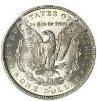
15 1880-S Morgan Dollar. PCGS graded MS63. Greysheet $77, CPG $104. Estimate $60 - 90