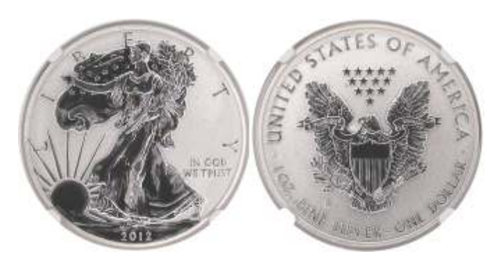
80 2012-S Silver $1 Eagle. Early Release. PCGS graded PF69. Greysheet $81. CPG $109.