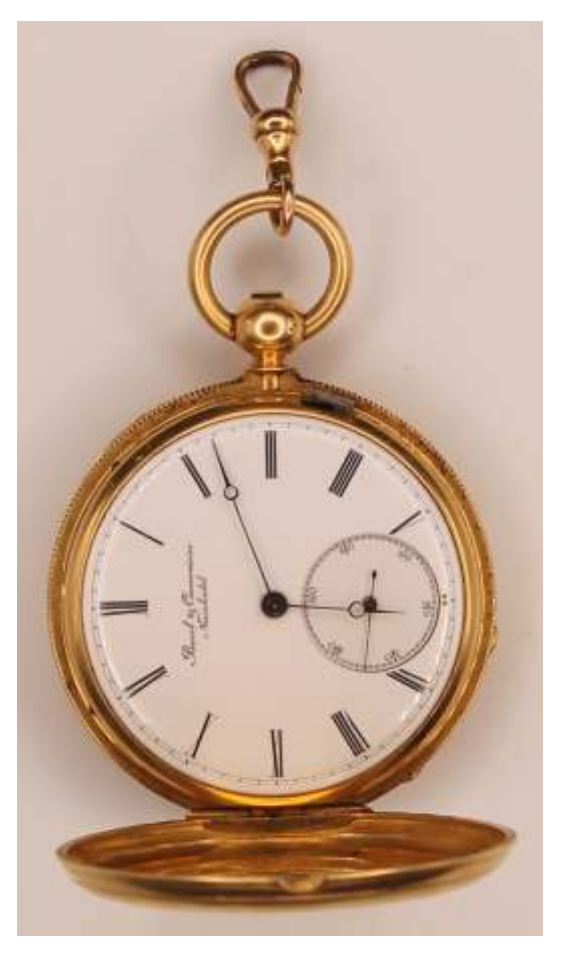
246 Borel & Courvoisier Neuchatel Watch Co., vintage Swiss pocket watch, 18kt yellow gold. Grade high quality, 5 jewels, side winding. White enamel face with Roman numerals and double sunk second sweep. Partial plate in nickel. Neuchatel Hunting Watch Case Co. Size 52mm, serial no. 34220, circa 1866. Excellent condition, working at the time of cataloguing.