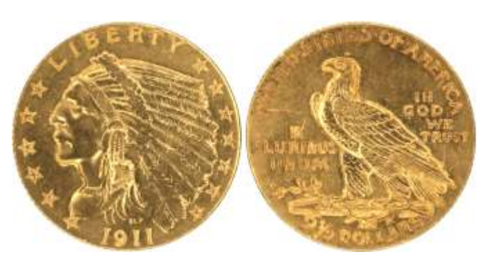
1911 Gold $2.50 Indian. VF.