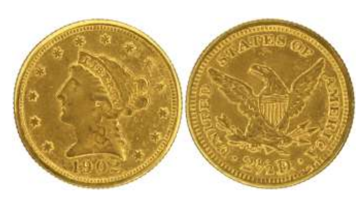
53 1902 Gold $2.50 Liberty. XF.