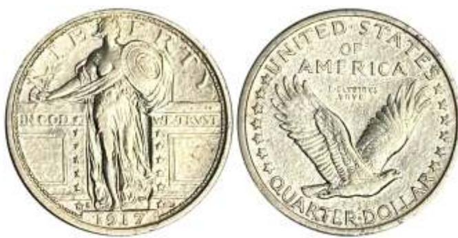
1917-D Liberty Standing Quarter Dollar. Type 1. VF. Estimate $75 - 100