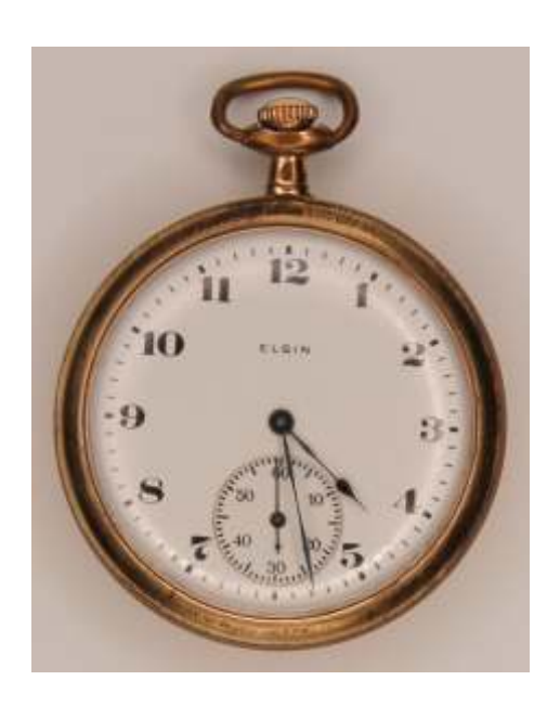
Elgin National Watch Co. vintage pocket watch. Grade 303, model 3, 7 jewels. White enamel face with Arabic numerals and sunk second sweep. Partial plate in nickel. Illinois Watch Case Co. 10 year guranteed yellow filled. Size 12, serial no. 22757127, circa 1920. Excellent condition, working at the time of cataloguing.