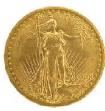
Estimate $1,600 - 2,000