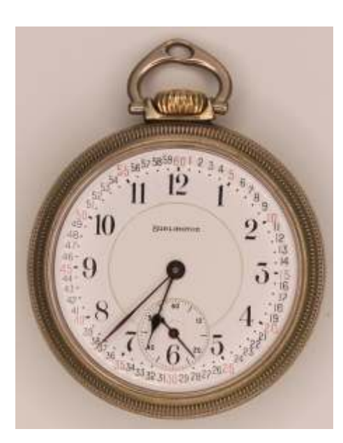
Burlington Watch Co. vintage pocket watch. Private label for Illinois Watch Co., grade 107, model 9, 21 jewels. White enamel face Montgomery dial with Arabic numerals and double sunk second sweep. Bridge plate in nickel. Keystone Watch Case Co. base metal. Size 16, serial no. 3754668, circa 1209. Very good condition, working at the time of cataloguing.