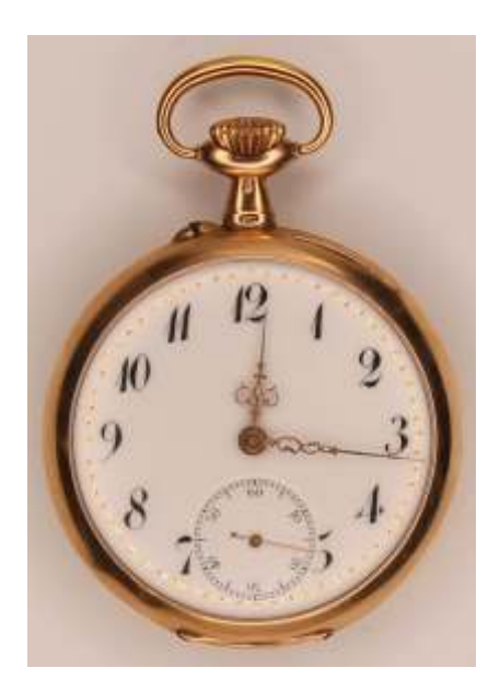
247 Breguet Watch Co., vintage Swiss pocket watch, 14kt yellow gold. 4 jewels. White enamel face with Arabic numerals and sunk second sweep with fancy gold hands. Full plate in gold, circa 1912. Very good condition, working at the time of cataloguing.