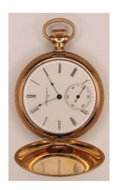
Elgin National Watch Co. vintage pocket watch, 14kt yellow gold. Grade 275, model 2, 17 jewels, side winding. White enamel face with Roman numerals and sunk second sweep. Partial plate in nickel. Keystone Watch Case Co. 14kt yellow gold. Size 12, serial no. 10191111, circa 1904. Excellent condition, working at the time of cataloguing.