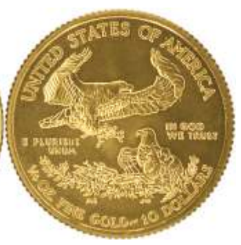
107 2020 Gold $10 Eagle. UNC.