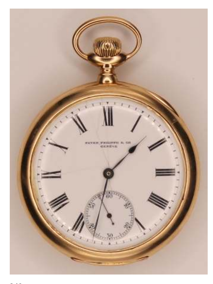
249 Patek Philippe & Cie Genève, a rare vintage pocket watch, Swiss-made. White enamel face (hairline) with Roman numerals and sunk second sweep. Partial plate in nickel. Case 14kt yellow gold. Serial no. 118690, circa 1903. Excellent condition, working at time of cataloguing. Estimate $4,000 - 6,000