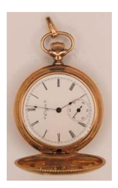
154 Elgin National Watch Co. vintage pocket watch, 14kt yellow gold. Grade 216, model 2, 15 jewels. White enamel face dial with Roman numerals and sunk second sweep. Bridge plate in nickel. Keystone J.Boxx 14kt yellow gold. Size 6, serial no. 9017606, circa 1901. Very good condition, working at time of cataloguing.