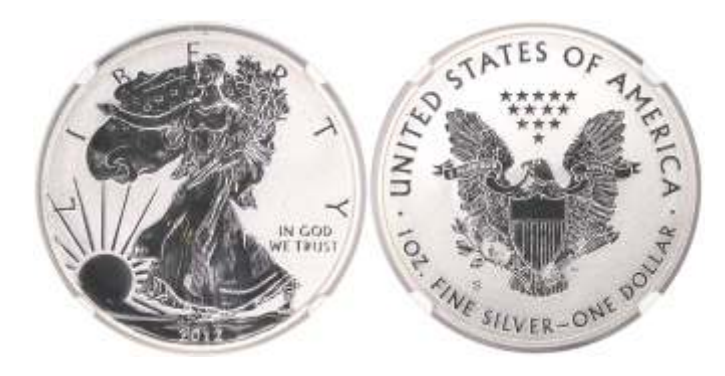
81 2012-S Silver $1 Eagle. Early Release. Reverse Proof. PCGS graded PF69. Greysheet $81. CPG $109. Estimate $60 - 100