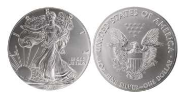
84 2016-W Silver $1 Eagle. 30th Anniversary, First Day of West Point strike. PCGS graded SP70.