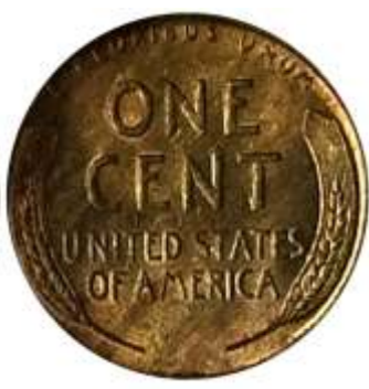
1909 Lincoln Cent. VDB. ANACS graded MS64. Greysheet $80, CPG $108. Estimate $65 - 90