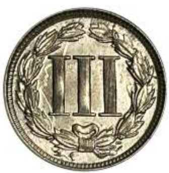
1865 Nickel Three Cents. AU. Scratch on obverse. Estimate $50 - 75