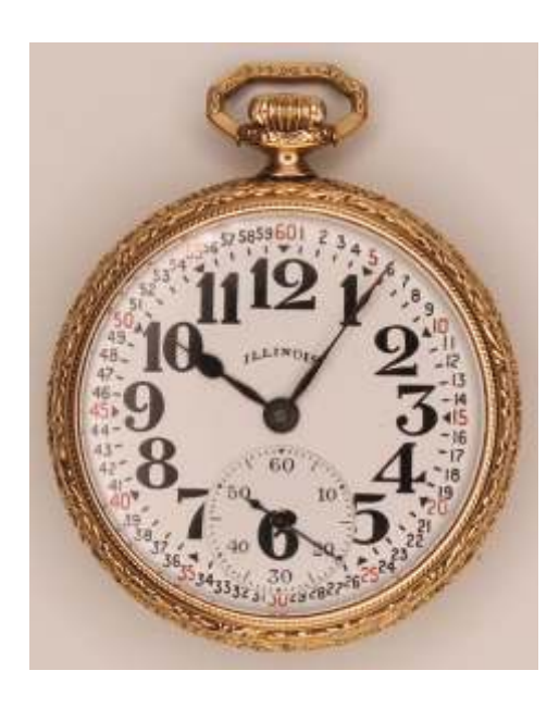
198 Illinois Watch Co. vintage pocket watch. Grade 706, model 9, 19 jewels with chain and holiday pendant. White enamel face Montgomery dial with Arabic numerals and sunk second sweep. Bridge plate in nickel. Case is gold plated. Size 16, serial no. 4665808, circa 1925. Excellent condition, working at the time of cataloguing.