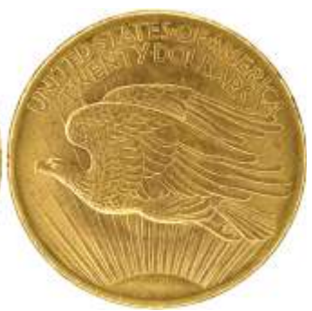
74 1908 Gold $20 St. Gaudens. No motto. UNC. Estimate $1,600 - 2,000