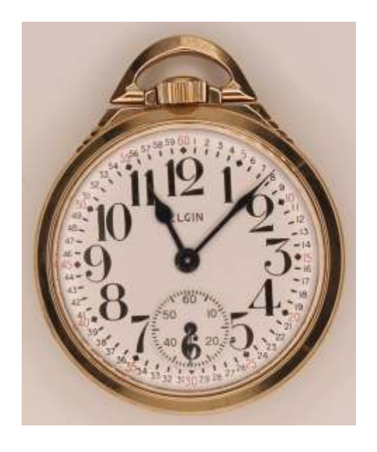
Elgin National Watch Co. vintage pocket watch. Railroad grade 571, model 20, 21 jewels. White enamel face with Arabic numerals and sunk second sweep with iridescent hands. Full plate in nickel. Keystone Watch Case Co. J. BOSS 10KYG filled. Size 68, serial no. U624391, circa 1947. Excellent condition, working at the time of cataloguing.