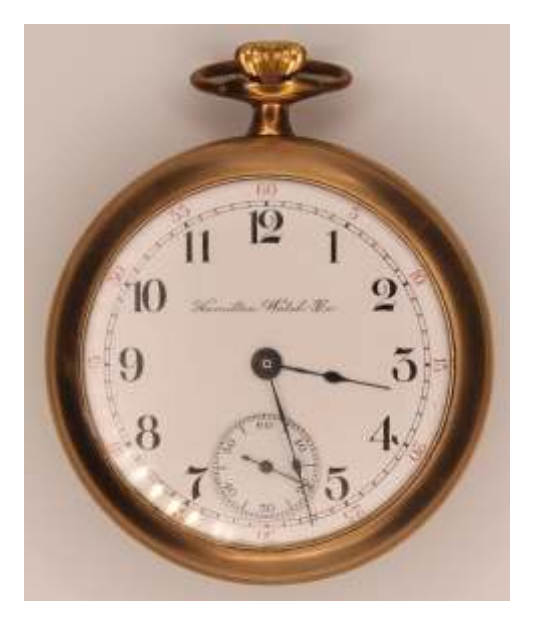
Hamilton Watch Co. vintage pocket watch. Grade 926, model 1, 17 jewels. White enamel face with Arabic numerals and sunk second sweep. Full plate in nickel. North American Watch Case Co. guaranteed 20 year gold plated. Size 18, serial no. 262650, circa 1903. Good condition, working at the time of cataloguing.