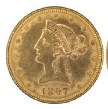
71 1897 Gold $10 Liberty. XF.