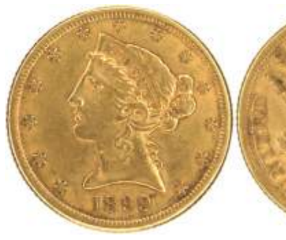
1899-S Gold $5 Liberty. VF.