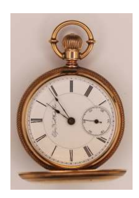
Elgin National Watch Co. vintage pocket watch, 14kt yellow gold. Grade 70, B.W. Raymond, model 2, 17 jewels. White enamel face with Roman numerals and double sunk second sweep. Full plate in nickel. B. W. C. Co. 14kt yellow gold guaranteed. Size 18, serial no. 5690618, circa 1895. Very good condition, working at the time of cataloguing. Estimate $800 - 1,200