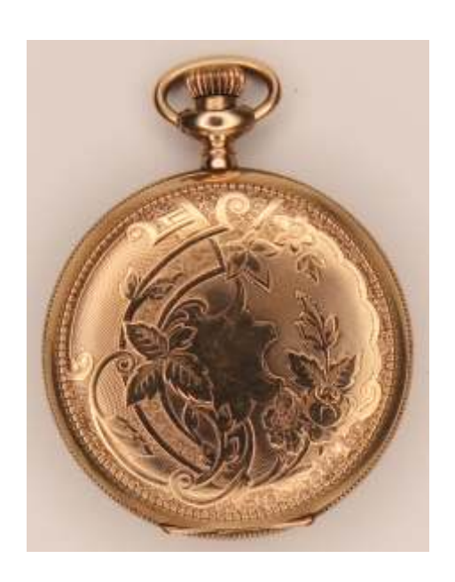
212 New York Standard Watch Co. vintage pocket watch. Grade 44, model 1, 7 jewels. White enamel face with

New York Standard Watch Co. vintage pocket watch. Chronograph. First Run. Introduced October 1904. Grade 164, model 13, 7 jewels. White enamel face with Arabic numerals and second sweep with iridescent hands. Partial plate in nickel. Keystone Watch Case Co. J. BOSS guaranteed 25 years gold plated. Size 18, serial no. 5522569, circa 1906. Excellent condition, working at the time of cataloguing. Estimate $300 - 400