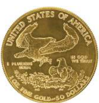
1992 Gold $50 Eagle. UNC.