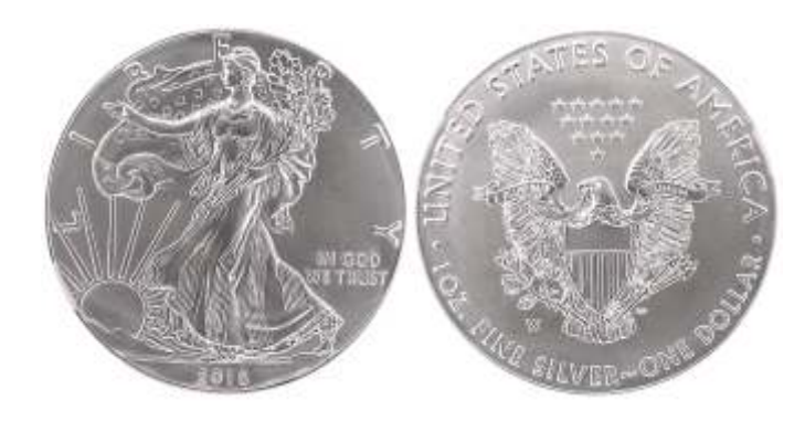
83 2016-W Silver $1 Eagle. Burnished. 30th Anniversary, First Day of Issue. NGC graded MS70. Greysheet $75. CPG $101. (PCGS # 7158). Estimate $60 - 90