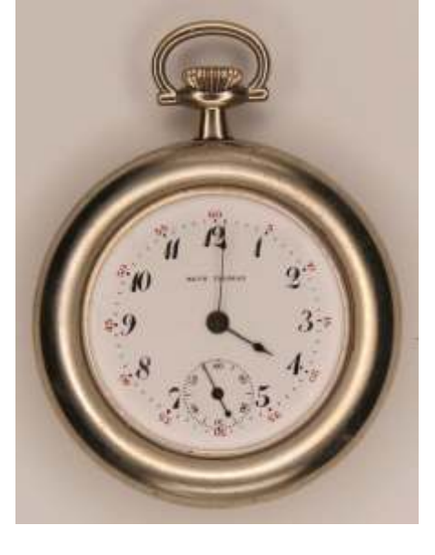
Seth Thomas Clock Co. vintage pocket watch. Grade "Centennial" model 24, 7 jewels. White enamel face with Arabic numerals and sunk second sweep. Partilal plate with striped finish. Keystone nickeloid case. Size 4s; serial no. 3080800; circa 1913. Excellent condition, working at the time of cataloguing. Estimate $75 - 100