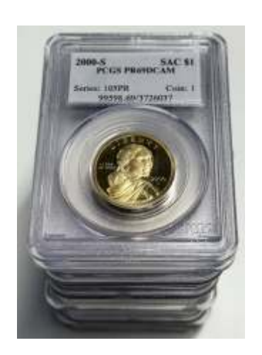
43 2000-S to 2005-S Sacagawea Dollars. A group of 12. Including 2000-S PR69-DCAM (3), PF 70 (1), PF 69; 2001-S PF70 (2), PR68 DCAM; 2002-S PF 69, PR 70; 2003-S PR 70 and 2005 PR69DCAM; all slabbed by NGC, PCGS or PCI; plus one 2001-S PR 63.