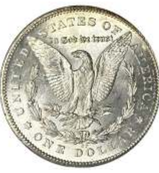
12 1878-CC Morgan Dollar. PCGS graded MS62. Greysheet $460, CPG $598.