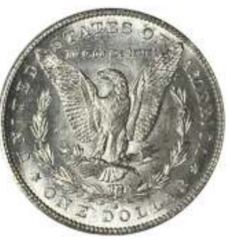
18 1881-S Morgan Dollar. PCGS graded MS63. Greysheet $77, CPG $104. Estimate $60 - 90