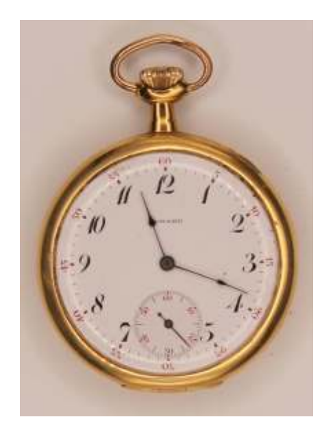
191 Howard Watch Co. vintage pocket watch, 18kt yellow gold. Grade Series 8, model 1908, 21 jewels. White enamel face with Arabic numerals and sunk second sweep. Bridge plate in nickel. K.W.C. Co. guaranteed 18kt yellow gold. Size 12, serial no. 1070990, circa 1911. Very good condition, working at the time of cataloguing.