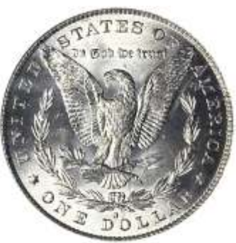
1881-O Morgan Dollar. PCGS graded MS63. Greysheet $90, CPG $122. Estimate $75 - 100