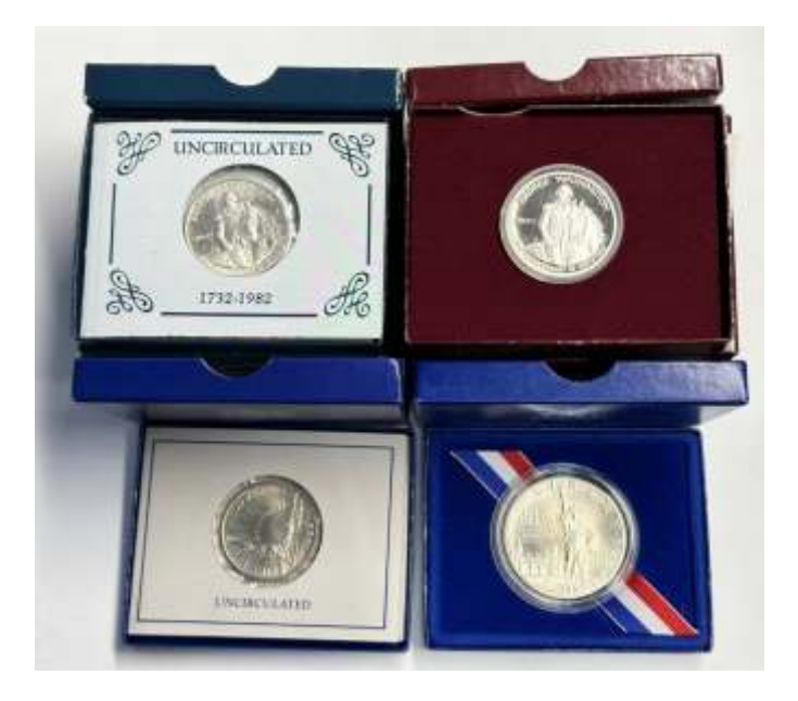
77 1982 George Washington 250th Anniversary group. Including uncirculated and silver proof sets; also including 1986 Statue of Liberty Centennial clad half dollar and silver dollar; all in their original boxes. Retail price approximately $150.