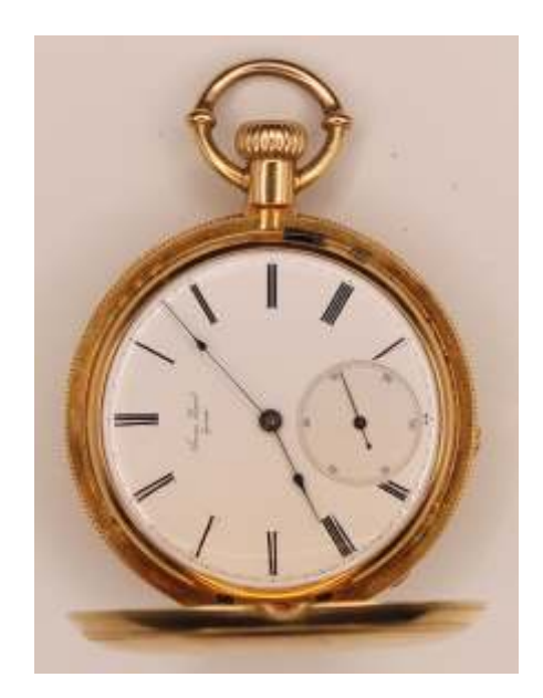
248 James Picard Watch Co. Geneva, vintage Swiss pocket watch, 18kt yellow gold. Mechanical side wind pocket watch; with minute repeater; White enamel face with Roman numerals and double sunk second sweep. Movement and case #13277; 18kt yellow gold. Very good condition, working at time of catalguing.