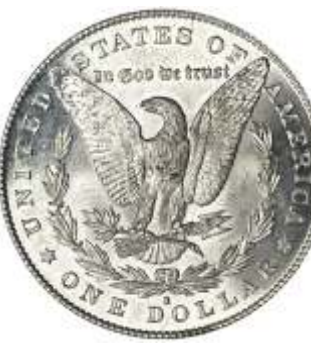
14 1879-S Morgan Dollar. Reverse of 1879. PCGS graded MS64. Greysheet $90, CPG $122.