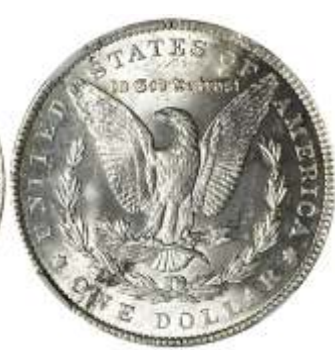
27 1890 Morgan Dollar. NGC graded MS64. Greysheet $ 110, CPG $143. Estimate $80 - 120