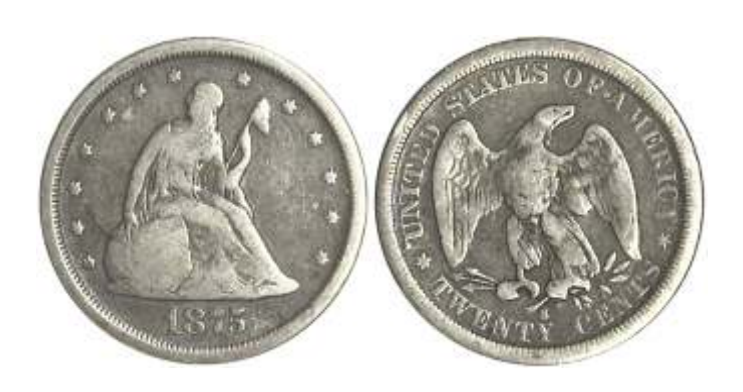
1875-S Twenty Cents. Fine.