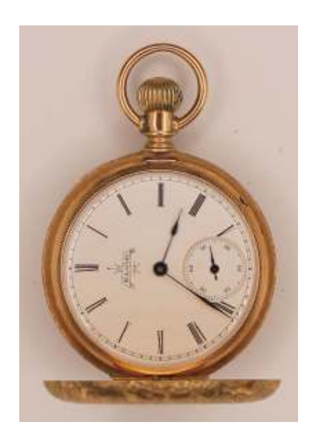
Elgin National Watch Co. vintage pocket watch, 14kt yellow gold. Grade 94, model 1, 11 jewels, side winding. White enamel face with Roman numerals and sunk second sweep. Partial plate in nickel. B.W.C. Co. guaranteed 14kt yellow gold. Size 6, serial no. 2173384, circa 1887. Excellent condition, working at the time of cataloguing.