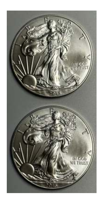
82 2015-W Silver $1 Eagles. UNC. Two identical coins with Govt. mint certificates. Estimate $75 - 100