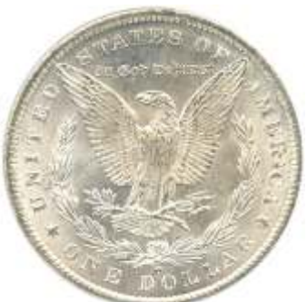
23 1885-O Morgan Dollar. NGC graded MS63. Greysheet $77, CPG $104. Estimate $60 - 80