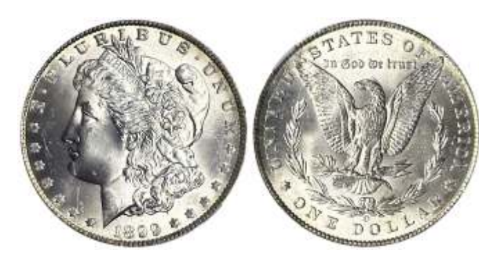
30 1899-O Morgan Dollar. NGC graded MS64. Greysheet $92, CPG $124. Estimate $75 - 100