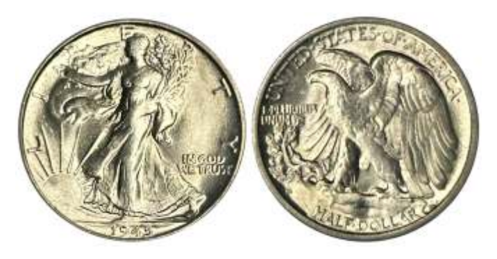
11 1945-S Liberty Walking Half Dollar. PCGS graded MS63. Greysheet $54, CPG $73. Estimate $40 - 60