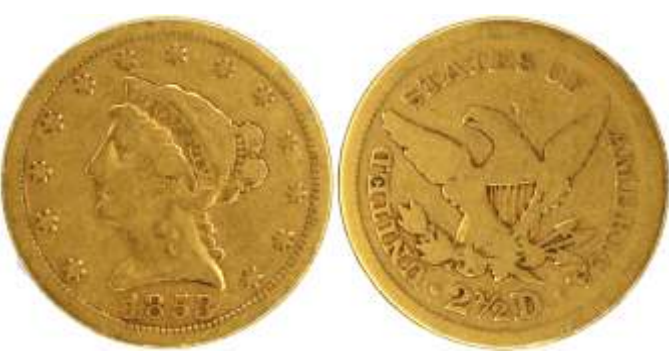
48 1853 Gold $2.50 Liberty. Fine.