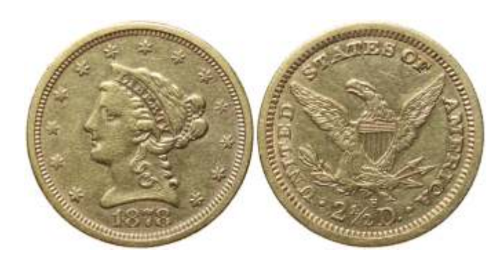
50 1878-S Gold $2.50 Liberty. UNC.