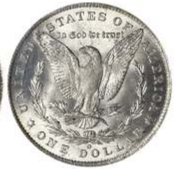
22 1885-O Morgan Dollar. PCGS graded MS64. Greysheet $92, CPG $124. Estimate $75 - 100