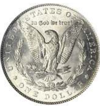
1879 Morgan Dollar. PCGS graded MS63. Greysheet $120, CPG $156. Estimate $80 - 120