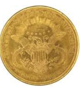
73 1883-S Gold $20 Liberty. XF.