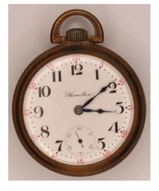
Hamilton Watch Co. vintage pocket watch. Railroad grade 940, model 1, 21 jewels. White enamel face with Arabic numerals and double sunk second sweep. Damaskeened full plate in nickel. Illinois Watch Case Co. gold plated (tarnished). Size 18, serial no. 632856, circa 1909. Very good condition, working at the time of cataloguing.