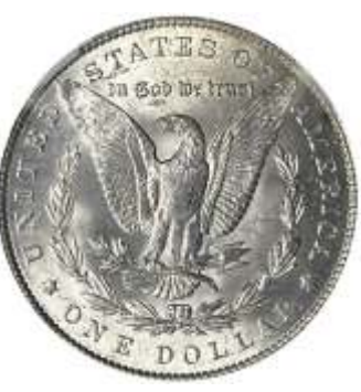
26 1889 Morgan Dollar. NGC graded MS64. Greysheet $102, CPG $133. Estimate $75 - 100