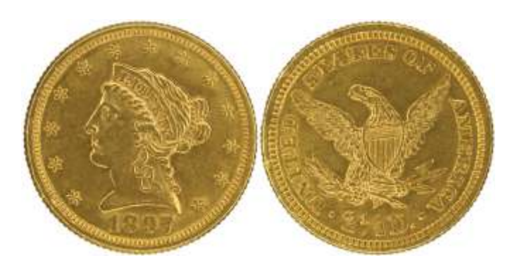
52 1897 Gold $2.50 Liberty. XF.