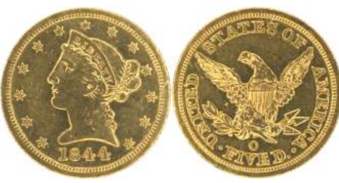
1844-O Gold $5 Liberty. AU.