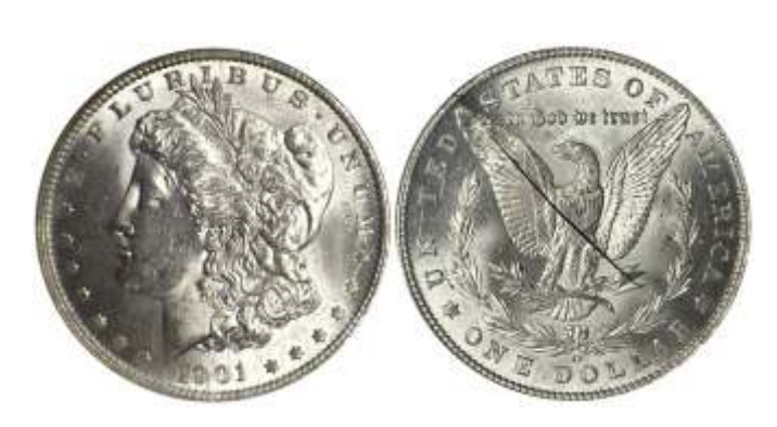
1901-O Morgan Dollar. NGC graded MS64. Holder is cracked on the reverse (the coin is OK). Greysheet $92, CPG $124. Estimate $75 - 100