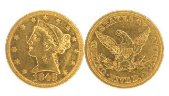
60 1849 Gold $5 Liberty. XF.