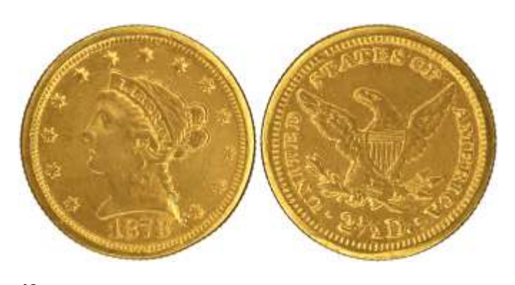
49 1878 Gold $2.50 Liberty. XF.