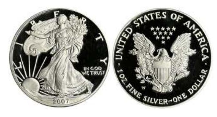
79 2007-W Silver $1 Eagle. Proof. In the original box with certificate of authenticity. Estimate $90 - 120