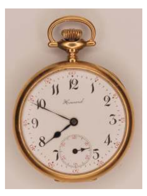
Howard Watch Co. vintage pocket watch, 14kt yellow gold. Grade Series 3, model 1905, 17 jewels, flip out. White enamel face with Arabic numerals and sunk second sweep. Partial plate in nickel. Case is 14kt yellow gold. Size 16, serial no. 943838, circa 1909. Very good condition, working at the time of cataloguing.