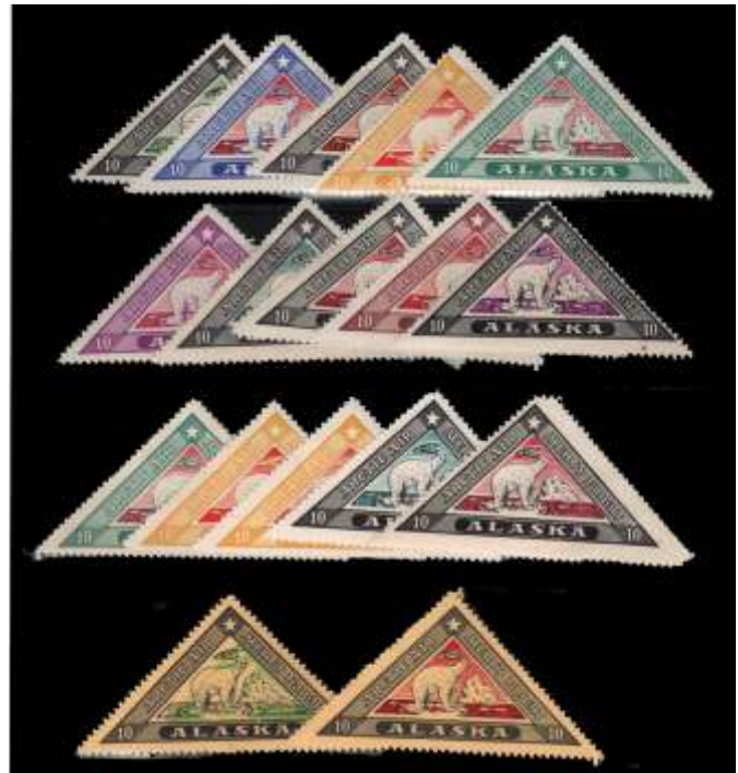
543 ★ Alaska Mercy Flight Labels, 17 with similar designs but different colors, Fine to Very Fine, interesting collateral / Cinderella items. Estimate $30 - 40