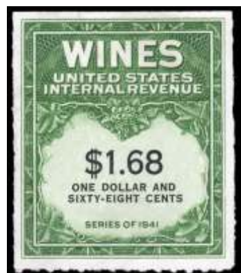
508 (★) Wines, 1942, $1.68 yellow green & black (Scott RE150), without gum as issued, Very Fine. Scott $120. Estimate $75 - 100