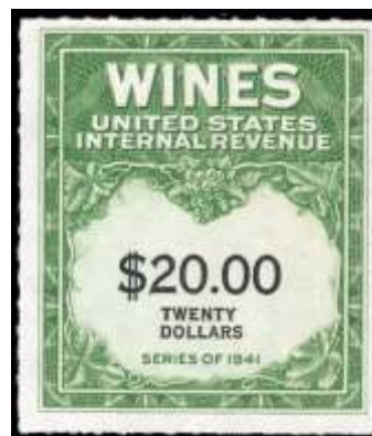
511 (★) Wines, 1942, $20 yellow green & black (Scott RE162), without gum as issued, Fine to Very Fine. Scott $130. Estimate $75 - 100