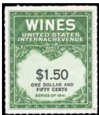
507 (★) Wines, 1942, $1.50 yellow green & black (Scott RE148), without gum as issued, Very Fine. Scott $150. Estimate $100 - 150