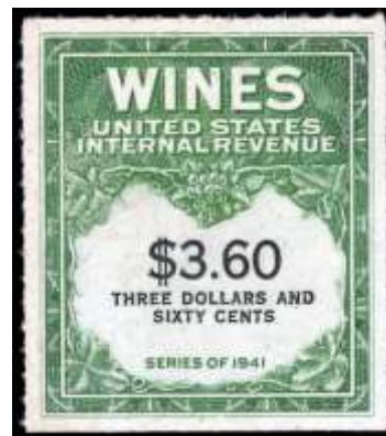
509 (★) Wines, 1942, $3.60 yellow green & black (Scott RE156), without gum as issued, Very Fine. Scott $200. Estimate $120 - 150