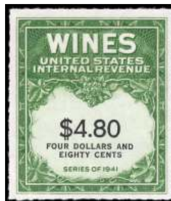
510 (★) Wines, 1942, $4.80 yellow green & black (Scott RE158), without gum as issued, Very Fine. Scott $175. Estimate $120 - 150