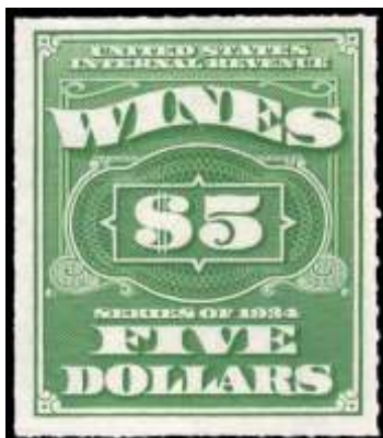
506 ★ Wines, 1934, $5 green (Scott RE107), Very Fine. Scott $45. Estimate $30 - 40