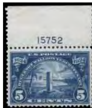
177 ★★ 1924, 5¢ Huguenot-Walloon (Scott 616), plate number single, a beautiful gem, perfect in every respect and extraordinarily choice, o.g., never hinged, Superb. Estimate $50 - 75