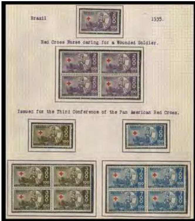
392 ★★ Brazil, 1935, Red Cross issue complete (Scott B5-B7) , single and block of 4 of each, o.g., never hinged, Fine to Very Fine, cataloged as hinged. Scott $64 ++. Estimate $40 - 60