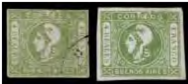
383 ★/○ Argentina: Buenos Aires, 1859, Liberty Head, 4r green and 4r olive green, blurred impression (Scott 9a, 9b) , unused and used; with tiny thin, otherwise Fine to Very Fine. Scott $450. Estimate $80 - 120