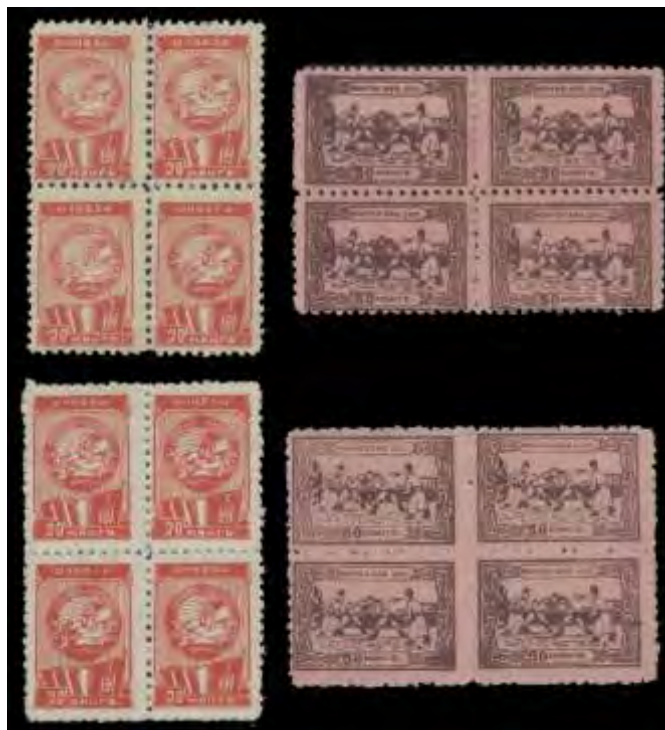
377 ★★田 Mongolia, 1958, Arms and Wrestlers without "XXXV" (Scott 140-141), both sets in blocks of 4, o.g., never hinged or without gum as issued, Fine to Very Fine. Estimate $75 - 100