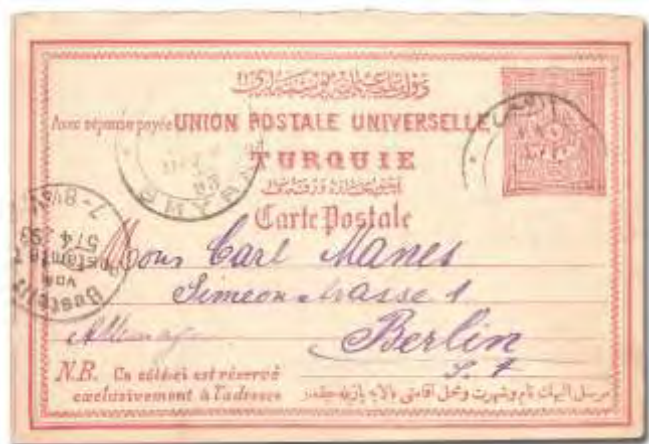
379 ☒ Turkey, 1893, post card from Smyrna to Germany, "Grüss aus" is the message on the reverse, Fine to Very Fine. Estimate $50 - 75