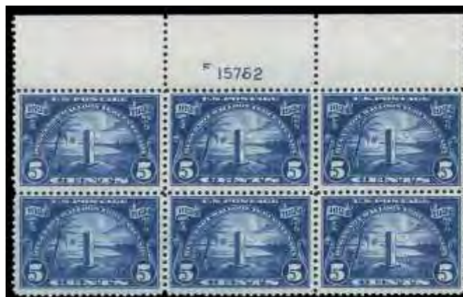
179 ★★田 1924, 5¢ Huguenot-Walloon (Scott 616), plate block of 6, o.g., never hinged, Fine to Very Fine. Scott $375. Estimate $250 - 350