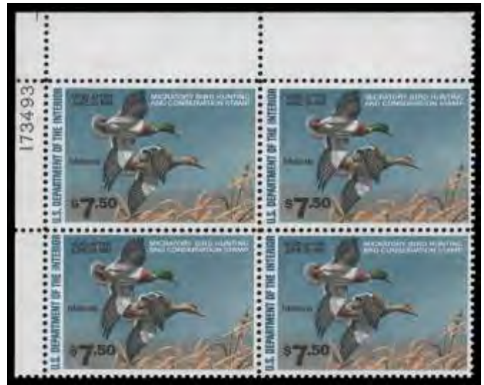
324 ★★田 Hunting Permit, 1980, $7.50 Mallards (Scott RW47), plate block of 4, immaculate and perfectly centered, o.g., never hinged, Extremely Fine and choice. Scott $55. Estimate $35 - 50