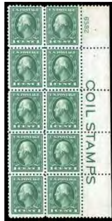
104 ★★田 1914, 1¢ Washington, S.L. watermark, perf 10 (Scott 424), plate block of 10 with "COIL STAMPS" imprint, beautifully well centered throughout, o.g., never hinged, Very Fine to Extremely Fine. Scott $350. Estimate $250 - 350