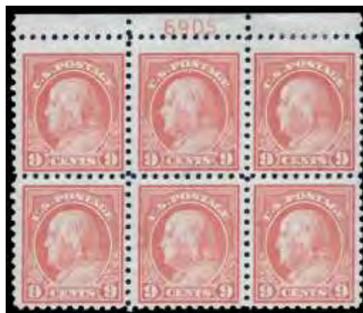
108 ★★/★田 1914, 9¢ Franklin, S.L. watermark, perf 10 (Scott 432), plate block of 6, lovely fresh color, o.g., 4 stamps with hinge remnants, top left and bottom right stamps never hinged, Fine to Very Fine. Scott $725. Estimate $400 - 600