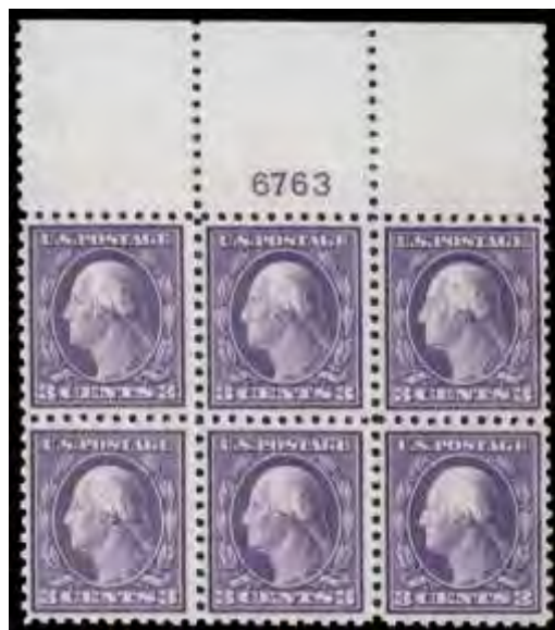
107 ★★田 1914, 3¢ Washington, S.L. watermark, perf 10 (Scott 426), "pink back" variety, wide top margin plate block of 6, essentially perfect centering, a gem of a plate block, o.g., never hinged, Extremely Fine and choice. Scott $400. Estimate $350 - 500