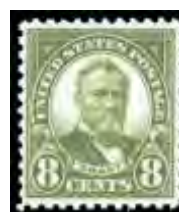
154 ★★ 1923, 8¢ Grant (Scott 560), a lovely well centered example, o.g., never hinged, Very Fine. Scott $80. Estimate $50 - 75