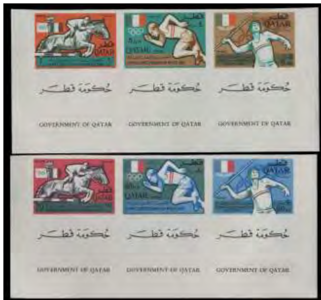
399 ★★ Qatar, 1966, Mexico Olympic Games imperf , bottom margin imprint strips of 3, o.g., never hinged, Very Fine. Scott 103B var. Michel 135-140. Estimate $100 - 150