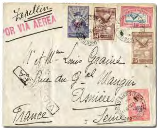
382 ✉ Argentina, 1932 (Aug 29-Sep 7), 5th South America Flight , cover from Friedrichshafen (Bordpost) to France, with numerous appropriate backstamps, Fine to Very Fine. Sieger 173.C. Estimate $75 - 100