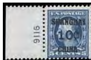
294 ★★ Offices in China, 1919, 10¢ on 5¢ blue (Scott K5), plate number single, very bright and fresh, o.g., never hinged, Fine to Very Fine. Scott $160. Estimate $60 - 80