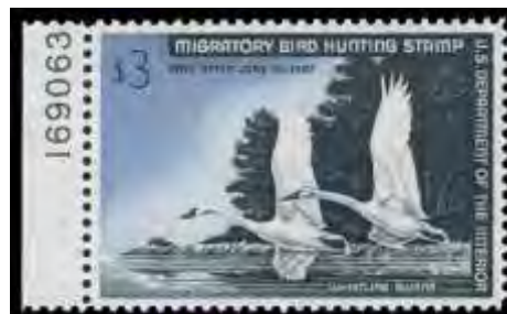
319 ★★ Hunting Permit, 1966, $3 Whistling Swans (Scott RW33), a magnificent plate number single, perfect in every respect, o.g., never hinged, Superb; with 2014 P.S.E. certificate graded Gem 100. Scott $100. SMQ $650. Estimate $500 - 750