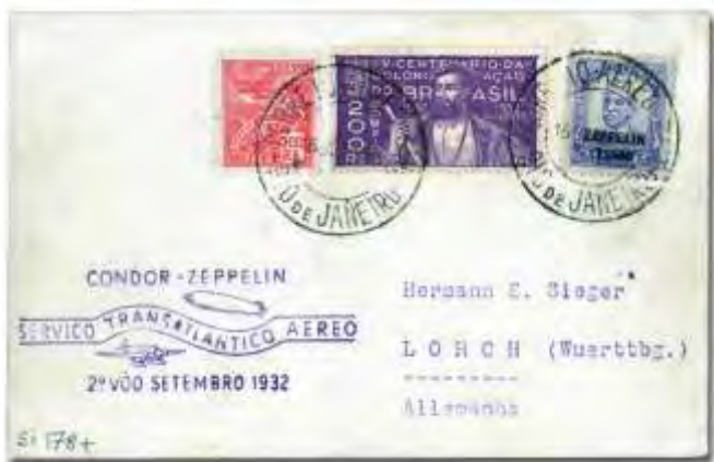
393 ✉ Brazil, 1932 (Sep 12-21), 6th South America Flight , neat cover, Friedrichshafen to Rio de Janeiro, with all proper postmarks and cachets, Very Fine. Sieger 178. Estimate $75 - 100