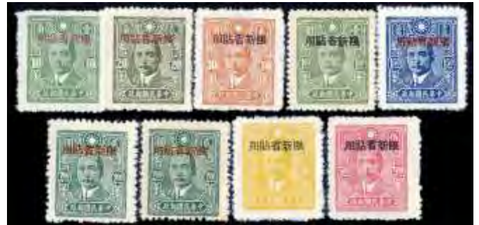
348 (★) Chinese Provinces: Sinkiang, 1942, overprints on Dr. Sun on Chinese wood free paper, 10¢ to $5 complete, without gum as issued, Fine to Very Fine. Chan PS214-221. Estimate $50 - 75