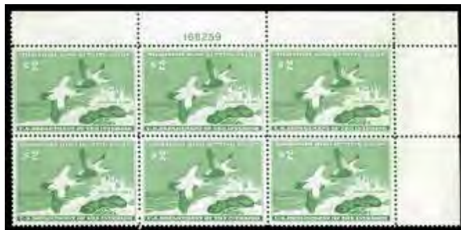
317 ★★ Hunting Permit, 1957, $2 American Eider (Scott RW24), plate block of 6, immaculate and perfectly centered, a gem, o.g., never hinged, Extremely Fine and choice. Scott $575. Estimate $300 - 400