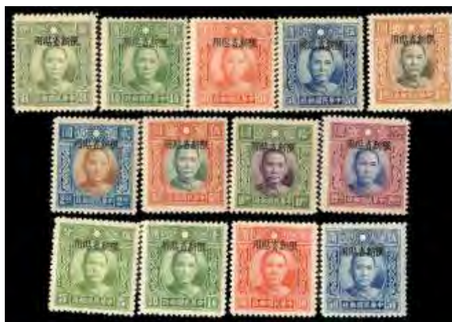
344 ★★ Chinese Provinces: Sinkiang, 1940-45, overprints on Dr. Sun, Series 4, watermarked and unwatermarked complete, o.g., never hinged, Fine to Very Fine. Scott 127-139. Chan PS147-159. Estimate $40 - 60