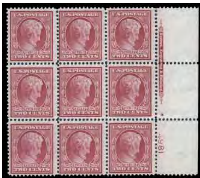
75 ★★田 1909, 2¢ Lincoln Centenary, perforated (Scott 367), plate block of 6, o.g., never hinged; minuscule translucency speck on the top left stamp, Fine to Very Fine overall. Scott $275. Estimate $75 - 100