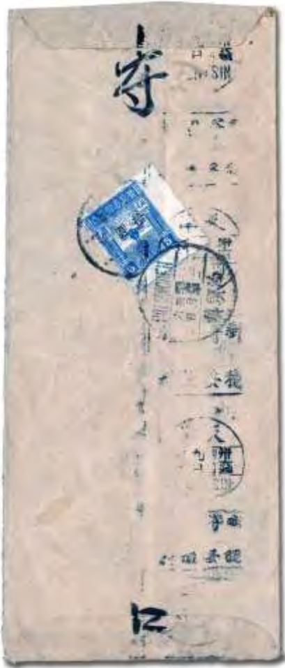
352 ✉ China (People's Republic): North China, 1946-47, Shanxi-Hebei-Shandong-Henan Border Area, surcharge on Bird on Globe, $10 on 5 (50¢) deep blue, large character narrow space surcharge, a scarce usage on cover, Fine to Very Fine. Michel 45x. Yang NC216. Estimate $300 - 400