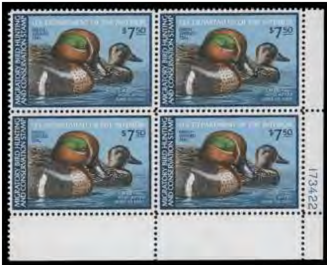
323 ★★田 Hunting Permit, 1979, $7.50 Green-Winged Teal (Scott RW46), plate block of 4, beautifully well centered, o.g., never hinged, Very Fine to Extremely Fine. Scott $50. Estimate $35 - 50