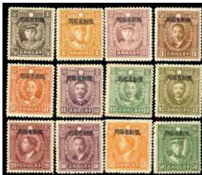
343 ★ Chinese Provinces: Sinkiang, 1933-34, "Limited for Use in ..." Peking overprints on Martyrs, 1/2¢-50¢ complete, fresh, o.g., lightly hinged, Fine to Very Fine. Scott 102-113. Chan PS117-128. Estimate $30 - 40