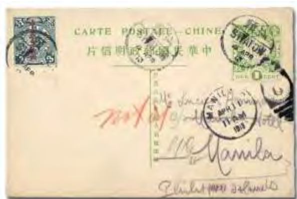
337 ☒ China, 1913, cover from Swatow to Manila, Philippines , a 5th issue stationery entire with Republic 3¢ red overprint, Fine to Very Fine. Estimate $100 - 150