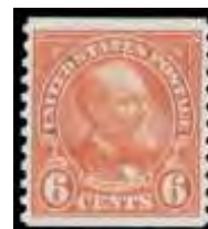
211 ★ 1932, 6¢ Garfield, rotary press, horizontal coil (Scott 723), mathematically perfect centering, a gem! Extremely Fine to Superb. Estimate $30 - 40