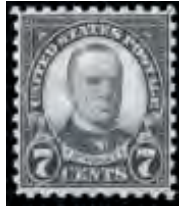
168 ★★ 1926, 7¢ McKinley, rotary press, perf 10 (Scott 588), a beautiful gem, extraordinarily choice, o.g., never hinged, Very Fine to Extremely Fine. Scott $26. Estimate $30 - 40