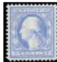
69 ★★ 1909, 15¢ Washington, D.L. watermark (Scott 340), a marvelously choice example, beautifully well centered within impressively large margins, o.g., never hinged, Very Fine to Extremely Fine; with photocopy of 2019 P.F. certificate for block. Scott $150. Estimate $200 - 300