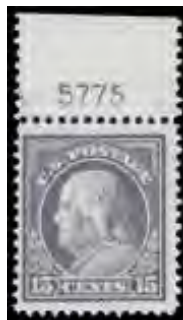
102 ★★ 1912, 15¢ Franklin, S.L. watermark, perf 12 (Scott 418), plate number single, fresh, o.g., never hinged, almost Very Fine. Scott $175. Estimate $100 - 150