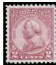
208 ★ 1930, 2¢ Von Steuben (Scott 689), mathematically perfect centering within oversized margins, a gem! Superb. Estimate $30 - 40