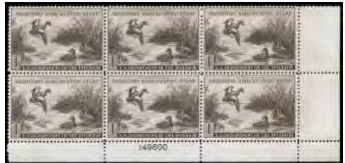
310 ★★田 Hunting Permit, 1942, $1 Baldpates (Scott RW9), wide plate block of 6, a beautiful example of a very scarce duck plate block, o.g., never hinged, Extremely Fine and choice; with 2008 P.S.E. certificate. Scott $2,500. Estimate $1,200 - 1,800