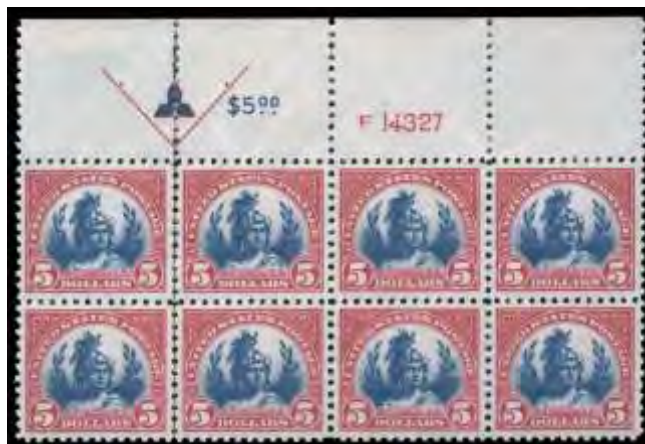
165 ★★田 1923, $5 Freedom Statue (Scott 573) , top block of 8 with plate number (almost but not quite a plate block), fresh and well centered throughout, o.g., never hinged, Extremely Fine. Scott $1,440. Estimate $750 - 1,000