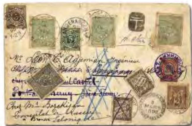
380 ☒ Turkey, 1898, mixed franking cover from Salonika via France to Württemberg, Germany, Salonika was then part of Turkey (now Greece). Note the Russian Offices in the Levant stamp at bottom right. Numerous transit cancels and 5 backstamps. Definitely well-traveled with a bit of history, Fine to Very Fine. Estimate $120 - 150