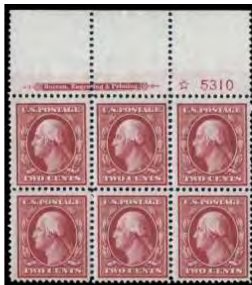
68 ★★田 1908, 2¢ Washington, D.L. watermark (Scott 332), plate block of 6, a handsome plate block, fresh and well centered, o.g., never hinged, Very Fine. Scott $150. Estimate $150 - 200