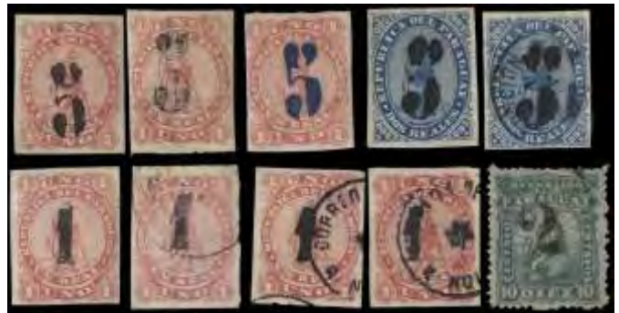
395 ○ Paraguay, 1878-84, Provisional Issues, nice selection of 10 (Scott 4//19) , neat cancels, Fine to Very Fine; several signed. Scott $900. Estimate $200 - 300