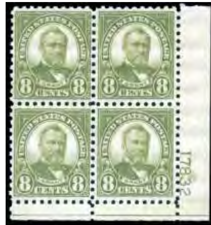
172 ★★/★田 1926, 8¢ Grant, rotary press, perf 10 (Scott 589), plate block of 4, well centered, o.g., lightly hinged at top, never hinged at bottom, Very Fine. Scott $300. Estimate $200 - 300