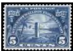
176 ★★ 1924, 5¢ Huguenot-Walloon (Scott 616), select centering that is essentially perfect, o.g., never hinged, Extremely Fine. Scott $28. Estimate $60 - 80