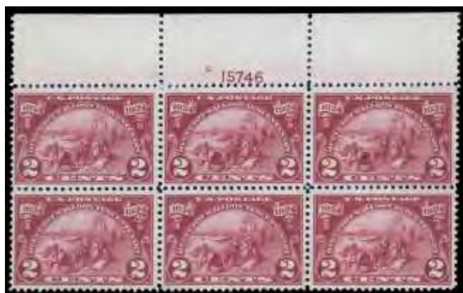
175 ★★田 1924, 2¢ Huguenot-Walloon (Scott 615), plate block of 6, uncommonly choice, o.g., never hinged, Very Fine to Extremely Fine. Scott $85. Estimate $100 - 150