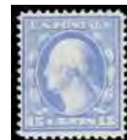
70 ★★ 1909, 15¢ Washington, D.L. watermark (Scott 340), lovely fresh color, o.g., never hinged, almost Very Fine; with photocopy of 2019 P.F. certificate for block. Scott $150. Estimate $75 - 100