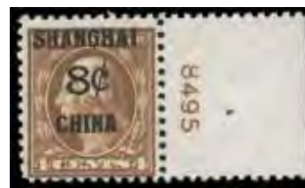
293 ★★ Offices in China, 1919, 8¢ on 4¢ brown (Scott K4), plate number single, rich bright color, o.g., never hinged, Fine to Very Fine. Scott $140. Estimate $60 - 80