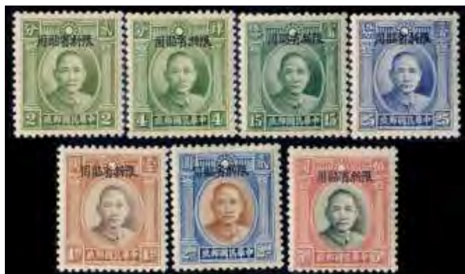
341 ★★ Chinese Provinces: Sinkiang, 1932, "Limited for Use in Sinkiang Province" London overprints on Dr. Sun Yat-sen, 2nd London printing, 2¢-$5 complete, very fresh colors, full o.g., never hinged, Very Fine. Scott 89-97 vars. Chan PS91-97. Estimate $75 - 100