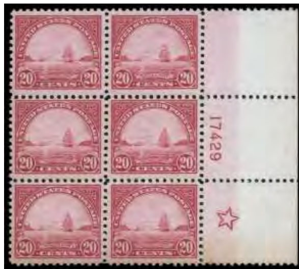
160 ★★田 1923, 20¢ Golden Gate (Scott 567) , plate block of 6, with star (a premium), fresh and attractive, o.g., never hinged, Fine to Very Fine. Scott $860. Estimate $500 - 750