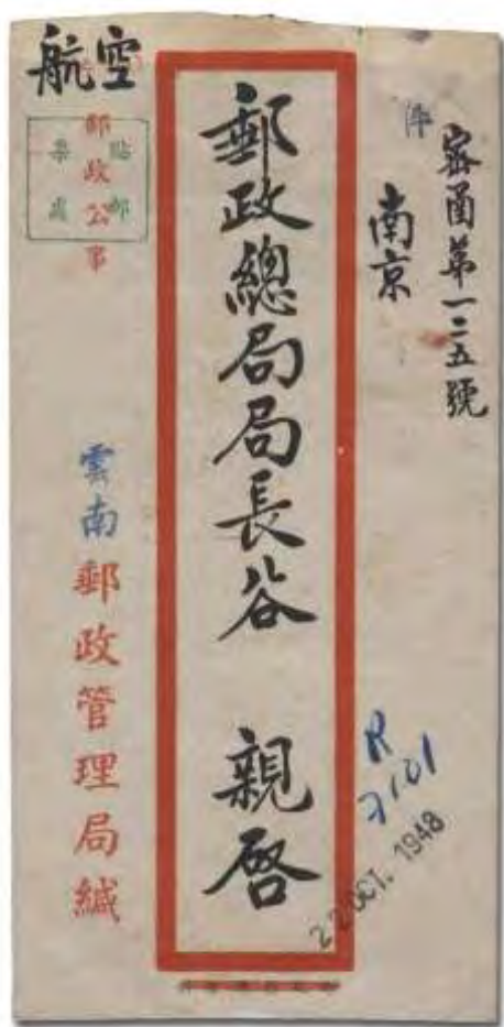
338 ☒ China, 1948, registered airmail cover from Yunnan to Nanking , backstamped, Fine to Very Fine. Estimate $100 - 150