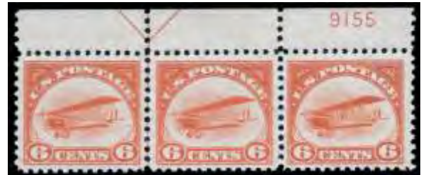
223 ★★/★ Airmail, 1918, 6¢ orange (Scott C1), plate number and imprint strip of 3, well centered throughout, o.g., 2 stamps never hinged, Very Fine. Scott $275 as singles. Estimate $150 - 200