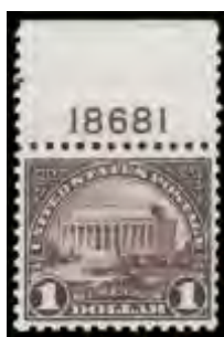
163 ★★ 1923, $1 Lincoln Memorial (Scott 571) , a spectacularly choice plate number single, perfectly centered, o.g., never hinged, Extremely Fine to Superb. Scott $75. Estimate $60 - 80