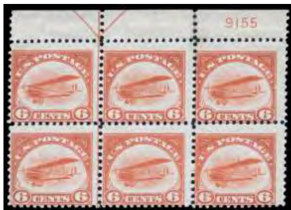
226 田 Airmail, 1918, 6¢ orange (Scott C1), plate block of 6, nice color, o.g., lightly hinged at top, never hinged at bottom, Fine. Scott $700. Estimate $250 - 350