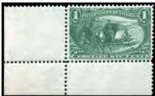
37 ★★ 1898, 1¢ Trans-Miss. (Scott 285), a beautiful corner margin single, perfectly centered and outstandingly choice, o.g., never hinged, Extremely Fine to Superb. Scott $83. Estimate $150 - 200