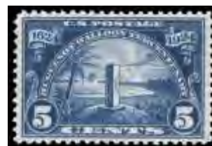
178 ★★ 1924, 5¢ Huguenot-Walloon (Scott 616), select centering that is essentially perfect, o.g., never hinged, Extremely Fine. Scott $28. Estimate $40 - 60