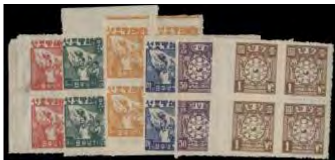
366 ★★田 Korea (South), 1946, Liberation from Japan issue complete (Scott 61-66) , blocks of 4, o.g., never hinged, Fine to Very Fine. Scott $74. Michel 7-12. Estimate $30 - 40