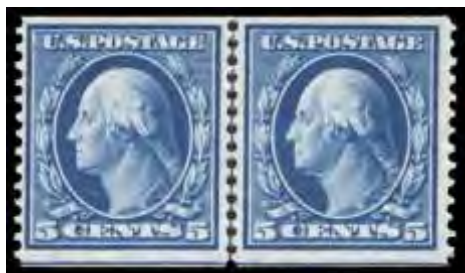
73 ★★ 1909, 5¢ Washington, D.L. watermark, horizontal coil (Scott 355), guide line pair, a superior example of this scarce and very difficult coil line pair, with lovely centering that is almost never seen this nice, pristine o.g., never hinged, Very Fine; with 1997 P.F. certificate for strip. Scott $3,250. Estimate $2,000 - 3,000