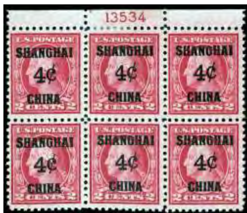
292 ★田 Offices in China, 1919, 4¢ on 2¢ rose (Scott K2), top plate block of 6, a fresh and attractive example of this elusive plate block, o.g., middle two lightly hinged, others never hinged, Very Fine. Scott $300. Estimate $150 - 200