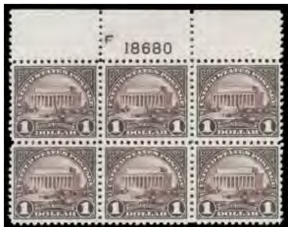
164 ★★田 1923, $1 Lincoln Memorial (Scott 571) , plate block of 6, immaculate and perfectly centered, a gem plate block, o.g., never hinged (couple tiny gum skips), Extremely Fine. Scott $525. Estimate $350 - 500