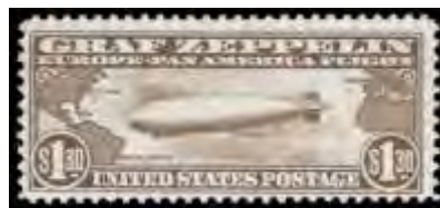
250 ★★ Airmail, 1930, $1.30 Graf Zeppelin (Scott C14) , o.g., never hinged, Fine to Very Fine; with 1995 P.F. certificate. Scott $575. Estimate $300 - 400