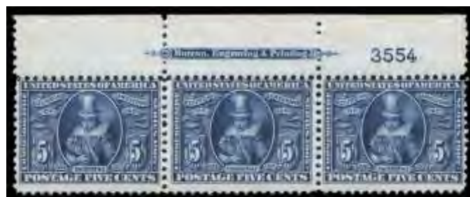
67 ★★ 1907, 5¢ Jamestown (Scott 330), plate number and imprint strip of 3, lovely color, nicely centered for this very difficult issue, immaculate Post Office fresh o.g., never hinged, Fine. Scott $1,300. Estimate $350 - 500