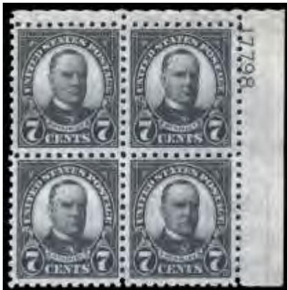
170 ★★田 1926, 7¢ black, rotary press, perf 10 (Scott 588), plate block of 4, outstandingly choice, o.g., never hinged, Very Fine to Extremely Fine. Scott $425. Estimate $300 - 400