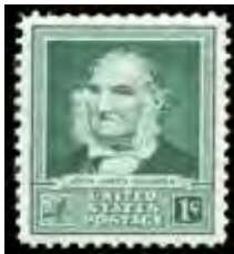
219 ★★ 1940, 1¢ Audubon (Scott 874), a gorgeous gem, perfect in every respect, o.g., never hinged, Superb; with P.S.E. certificate (encapsulated) graded SUP 98. SMQ $50. Estimate $35 - 50