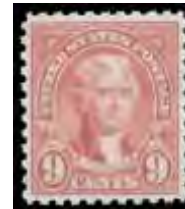
173 ★★ 1926, 9¢ Jefferson, rotary press, perf 10 (Scott 590), a beautiful gem, perfect in every respect and extraordinarily choice, o.g., never hinged, Extremely Fine to Superb. Estimate $35 - 50