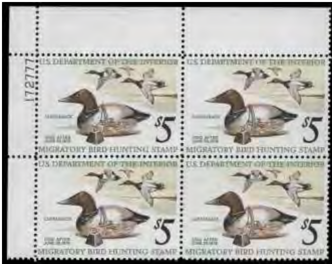
322 ★★田 Hunting Permit, 1975, $5 Canvas-backs (Scott RW42), plate block of 4, perfectly centered, o.g., never hinged, Extremely Fine and choice. Scott $65. Estimate $40 - 60