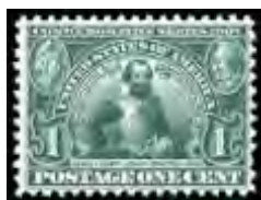
66 ★★ 1907, 1¢ Jamestown (Scott 328), a lovely example with bright fresh color, o.g., never hinged, nearly Very Fine; with photocopy of 2018 P.F. certificate. Scott $70. Estimate $40 - 60