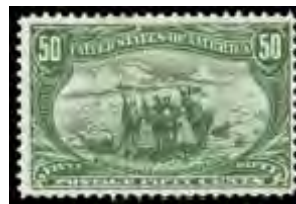
41 ★ 1898, 50¢ Trans-Miss. (Scott 291), lovely fresh color and attractive centering, o.g., previously hinged, almost Very Fine. Scott $600. Estimate $250 - 350