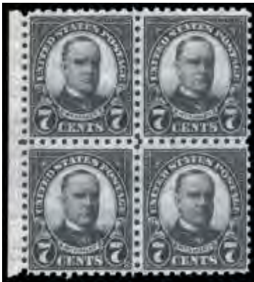
169 ★★田 1926, 7¢ McKinley, rotary press, perf 10 (Scott 588), block of 4, well centered throughout, a gem block, o.g., never hinged, Extremely Fine to Superb. Scott $104. Estimate $50 - 75