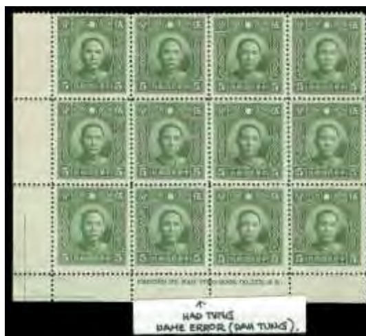
339 ★★田 China, 1940, Dr. Sun Yat-sen, Dah Tung printing, unwatermarked, 5¢ green, printing error (Scott 381 var.) , corner margin block of 12 showing inscription error "HAD TUNG", o.g., never hinged, Fine to Very Fine. Chan 403d. Estimate $75 - 100