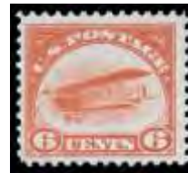
222 ★★ Airmail, 1918, 6¢ orange (Scott C1), lovely fresh color, o.g., never hinged, Fine to Very Fine. Scott $110. Estimate $50 - 75