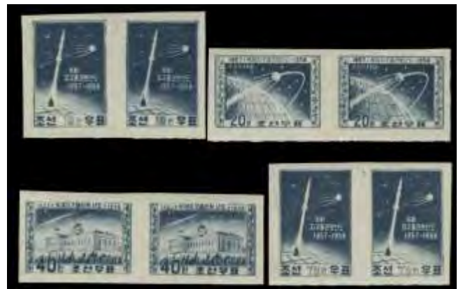
365 Korea (North), 1958, International Geophysical Year complete, imperf (Scott 134a-137a), pairs, o.g., never hinged, Very Fine, a scarce set of topical interest. Scott $590. Michel 141B-144B. Estimate $150 - 200