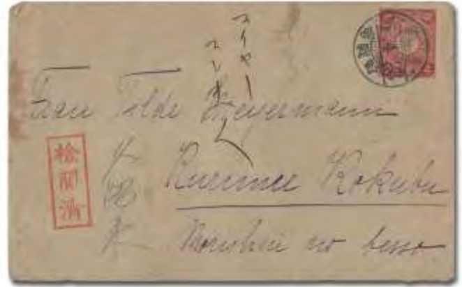
364 Japanese Offices in China, 1916, censored cover from a German P.O.W. to Kurume, franked with 3 sen overprinted Chrysanthemum tied by Tsingtau field PO c.d.s, Kurume arrival backstamp, boxed red "Inspected" censor's mark. Unusual to a woman, Fine to Very Fine. Scott 8. Estimate $50 - 75