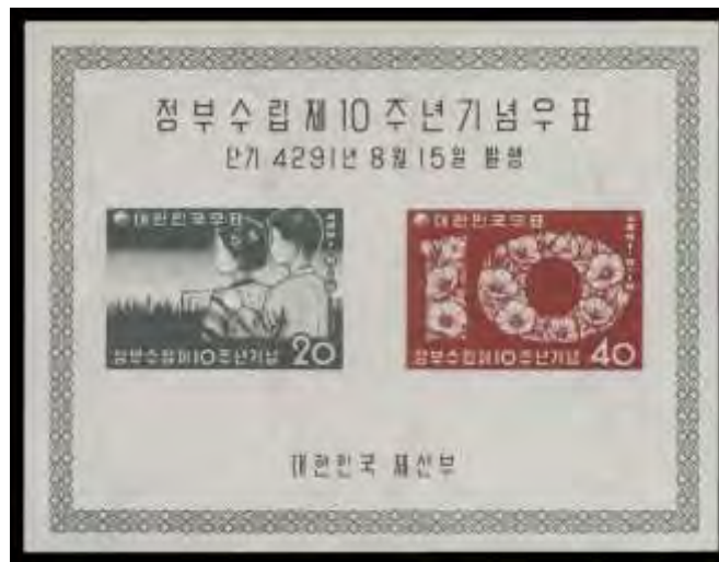
373 ★★ Korea (South), 1958, Tenth Anniversary of the Republic souvenir sheet (Scott 285a), o.g., never hinged, Very Fine. Scott $450. Michel BL 126. Estimate $200 - 300