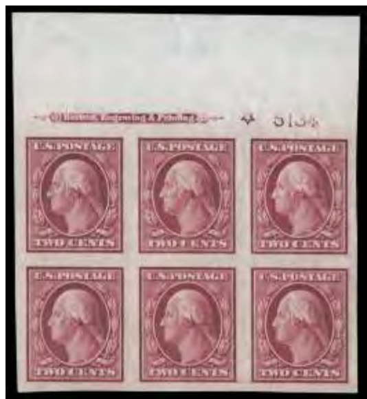
71 ★★田 1908, 2¢ Washington, D.L. watermark, imperf (Scott 344), wide top margin plate block of 6, immaculate and outstandingly choice, o.g., never hinged, Extremely Fine. Scott $120. Estimate $120 - 150