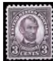
166 ★★ 1925, 3¢ Lincoln, rotary press, perf 10 (Scott 584) , a beautiful gem, perfect in every respect and extraordinarily choice, o.g., never hinged, Extremely Fine to Superb. Scott $60. Estimate $100 - 150