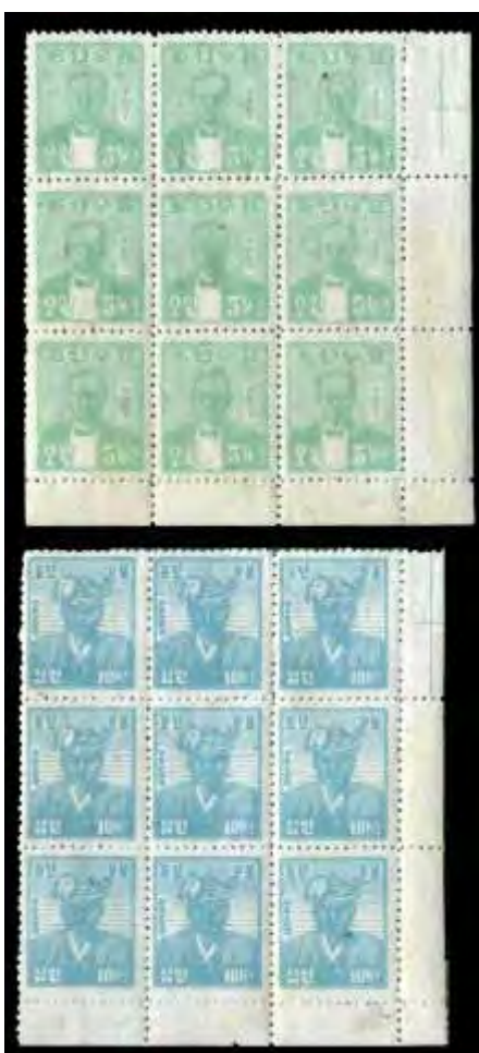
367 ★★田 Korea (South), 1947, Li Jun and Admiral Li Sun-sin complete (Scott 75-76) , blocks of 9, o.g., never hinged, Fine to Very Fine. Scott $225. Michel 21-22. Estimate $100 - 150