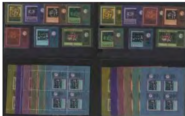
401 ★★ Sharjah, 1966, Soccer Championship "England Winners" issue complete, perf and imperf including souvenir sheets , o.g., never hinged, Fine to Very Fine. Michel 124-130, BL 5A-10B. Estimate $50 - 75