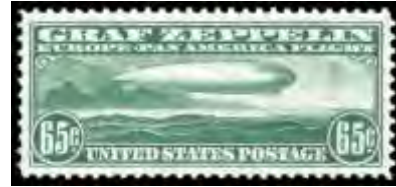
247 ★★ Airmail, 1930, 65¢ Graf Zeppelin (Scott C13) , mathematically perfect centering, a premium example, o.g., never hinged (minor gum skips), Extremely Fine. Scott $250. Estimate $250 - 350