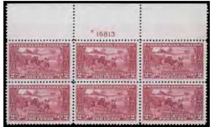
183 ★★田 1925, 2¢ Lexington-Concord (Scott 618), plate block of 6, perfect in every respect and uncommonly choice, o.g., never hinged, Extremely Fine to Superb. Scott $85. Estimate $100 - 150