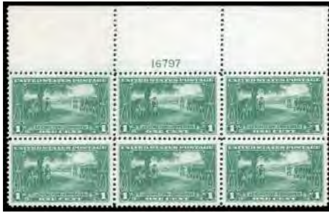
181 ★★田 1925, 1¢ Lexington-Concord (Scott 617), plate block of 6, perfect in every respect and uncommonly choice, o.g., never hinged, Extremely Fine to Superb. Scott $68. Estimate $75 - 100