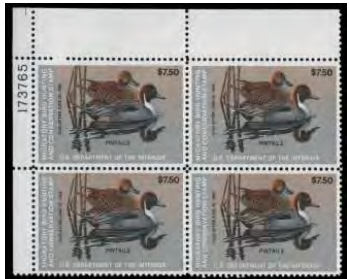
325 ★★田 Hunting Permit, 1983, $7.50 Pintails (Scott RW50), plate block of 4, perfectly centered, o.g., never hinged, Extremely Fine and choice. Scott $60. Estimate $40 - 60