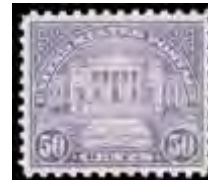
210 ★★ 1931, 50¢ Arlington Amphitheater, rotary press (Scott 701), perfect in every respect, o.g., never hinged, Extremely Fine to Superb. Scott $50. Estimate $75 - 100