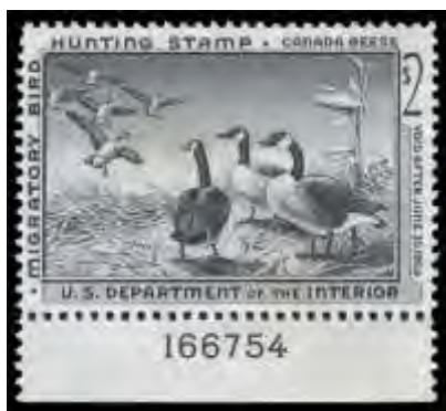
318 ★★ Hunting Permit, 1958, $2 Canada Geese (Scott RW25), plate number single, beautifully well centered, o.g., never hinged, Extremely Fine. Scott $85. Estimate $40 - 60