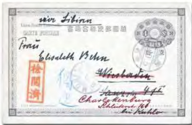
363 Japanese Offices in China, 1915, IJPO stationery card from Tsingtau via Siberia to Germany, showing red censor handstamp, Fine to Very Fine. J.S.C.A. ZC3. Estimate $100 - 150