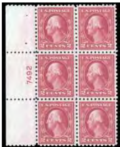
105 ★★田 1914, 2¢ Washington, S.L. watermark, perf 10 (Scott 425), plate block of 6, immaculate and most impressive, o.g., never hinged, Extremely Fine to Superb. Scott $75. Estimate $150 - 200