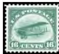
227 ★ Airmail, 1918, 16¢ green (Scott C2), gem centering that is just about perfect, a beauty! o.g., lightly hinged, Extremely Fine to Superb; with 2017 P.S.E. certificate graded XF-SUP 95. Scott $60. SMQ $150. Estimate $100 - 150