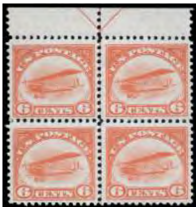
224 ★★田 Airmail, 1918, 6¢ orange (Scott C1), arrow block of 4, lovely fresh color, o.g., never hinged, Fine to Very Fine. Scott $440. Estimate $200 - 300