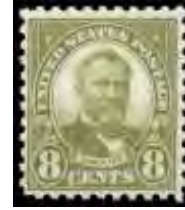
171 ★★ 1926, 8¢ Grant, rotary press, perf 10 (Scott 589), a beautiful gem, perfect in every respect and extraordinarily choice, o.g., never hinged, Extremely Fine. Scott $58. Estimate $60 - 80