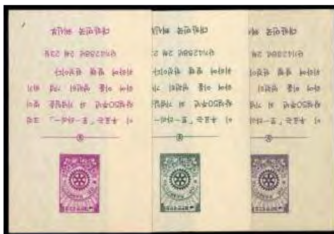
369 (★) Korea (South), 1955, Rotary souvenir sheets complete (Scott 213-215 vars.) , without gum as issued. Michel BL. 81/83. Estimate $400 - 600