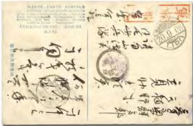
362 Japanese Offices in China, 1908, picture post card from Shanhaikwan, reverse shows real photo of "Barracks of French Landing party, Chin-Wang-Tao", Fine to Very Fine. Estimate $100 - 150