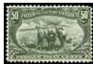
42 ★ 1898, 50¢ Trans-Miss. (Scott 291), rich fresh color, o.g., lightly hinged, Fine to Very Fine. Scott $600. Estimate $200 - 300