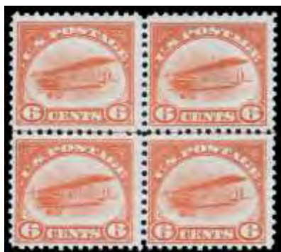
225 ★★田 Airmail, 1918, 6¢ orange (Scott C1), block of 4, a fresh attractive block, o.g., never hinged, Fine to Very Fine. Scott $440. Estimate $150 - 200