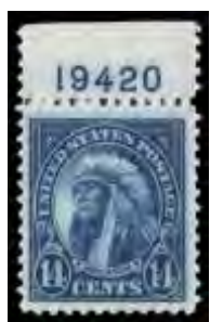
158 ★★ 1923, 14¢ American Indian (Scott 565) , top plate number single, a flawless gem in superlative condition, beautifully well centered, o.g., never hinged, Extremely Fine to Superb. Estimate $40 - 60