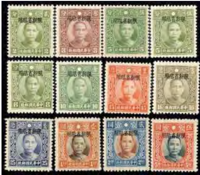
345 ★ Chinese Provinces: Sinkiang, 1940-45, overprints on Dr. Sun, Series 4 complete, unwatermarked, o.g., lightly hinged, Fine to Very Fine. Scott 115-126; $40. Chan PS147-155, PS243-245. Estimate $30 - 40