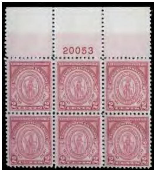
206 ★★田 1930, 2¢ Massachusetts Bay Colony (Scott 682), plate block of 6, a beautiful gem, perfect in every respect and extraordinarily choice, o.g., never hinged, Extremely Fine to Superb. Scott $26. Estimate $50 - 75