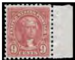
174 ★★ 1926, 9¢ Jefferson, rotary press, perf 10 (Scott 590), a lovely example, beautifully well centered, and showing natural gripper cuts at right, o.g., never hinged, Extremely Fine and choice; with photocopy of 2001 P.S.E. certificate for block. Scott $13. Estimate $30 - 40