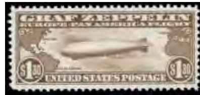
249 ★★ Airmail, 1930, $1.30 Graf Zeppelin (Scott C14) , well centered and choice, o.g., never hinged, Very Fine to Extremely Fine; with photocopy of 2016 P.F. certificate for block. Scott $575. Estimate $400 - 600