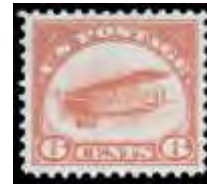
221 ★ Airmail, 1918, 6¢ orange (Scott C1), near perfect centering, bright fresh color, o.g., very lightly hinged, Extremely Fine and choice; with 2017 P.S.E. certificate graded XF 90. Scott $55. SMQ $90. Estimate $60 - 80