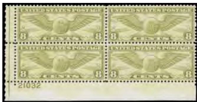
258 ★★田 Airmail, 1932, 8¢ Winged Globe (Scott C17), plate block of 4, perfect in every respect, o.g., never hinged, Extremely Fine to Superb. Scott $38. Estimate $40 - 60