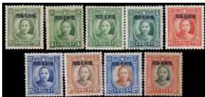
342 ★ Chinese Provinces: Sinkiang, 1932-34, Dr. Sun, Series 2, overprints nearly complete, 2¢-$5, 9 values (missing only the 1938 20¢), mixed printings, fresh, full o.g., Fine to Very Fine. Scott 89//97; $75. Michel 73-77, 79-82. Chan PS91//PS112. Estimate $40 - 60