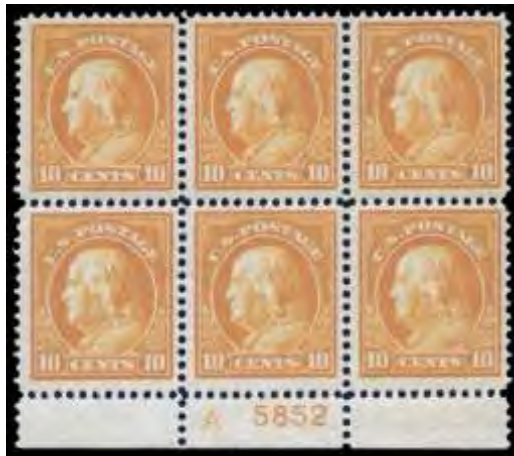
101 ★★田 1912, 10¢ Franklin, S.L. watermark, perf 12 (Scott 416), plate block of 6, nicely centered throughout, o.g., never hinged; light gum skips at left, Very Fine. Scott $825. Estimate $500 - 750