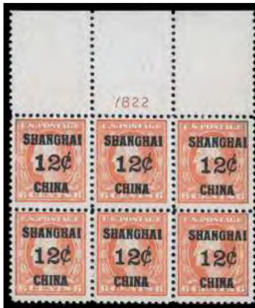
295 ★★田 Offices in China, 1919, 12¢ on 6¢ red orange (Scott K6), plate block of 6, a handsome and very fresh plate block, uncommonly choice, o.g., never hinged (couple tiny gum skips), Very Fine for the issue. Scott $1,500. Estimate $750 - 1,000