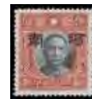
349 ★★ China: Japanese Occupation of Honan, 1941, Large Characters Ovpt. on Dr. Sun, $5 gray green & scarlet (Scott 3N27), choice, o.g., never hinged, consignor noted "no DAH in button". Chan JN199. Estimate $40 - 60