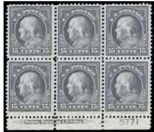
103 ★★/★田 1912, 15¢ Franklin, S.L. watermark, perf 12 (Scott 418), plate block of 6, well centered, a lovely plate block, o.g., top center stamp lightly hinged, other 5 stamps never hinged; minor gum crease at top left, Very Fine. Scott $953 as singles. Estimate $500 - 750