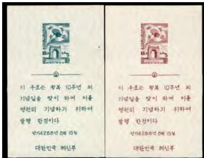
370 (★) Korea (South), 1955, 10th Anniversary of Independence souvenir sheets complete (Scott 218-219 vars.), without gum as issued, Very Fine. Michel BL 87-8. Estimate $500 - 750