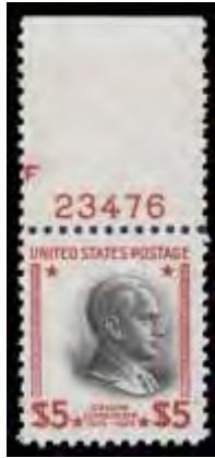
217 ★★ 1938, $5 Coolidge (Scott 834), plate number single, o.g., never hinged, Very Fine. Scott $85. Estimate $50 - 75