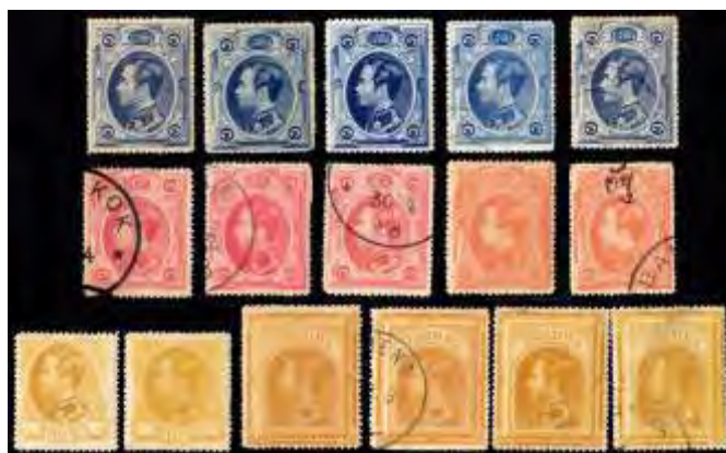
378 ★/O Thailand, 1883-89, King Chulalongkorn issues, selection of mint and used (Scott 1-5, 19), mostly Very Fine. Scott $400+. Estimate $120 - 150