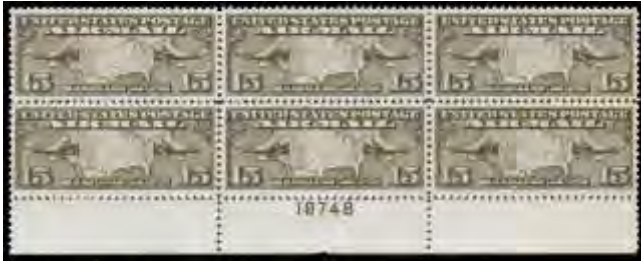
244 ★★田 Airmail, 1926, 15¢ Map & Planes (Scott C8) , plate block of 6, an uncommonly choice plate block, o.g., never hinged, Very Fine to Extremely Fine. Scott $45. Estimate $50 - 75