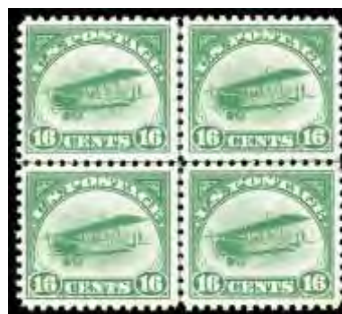
228 ★★/★田 Airmail, 1918, 16¢ green (Scott C2), centerline block of 4, o.g., previously hinged (2 stamps never hinged), Very Fine to Extremely Fine; with 2018 P.F. certificate. Scott $275. Estimate $200 - 300