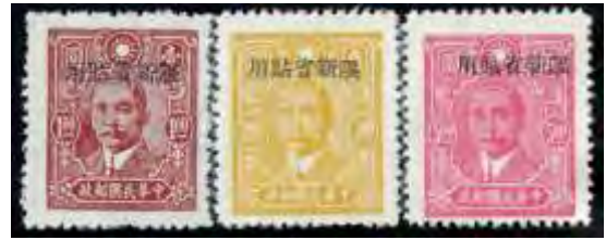
347 (★) Chinese Provinces: Sinkiang, 1942, overprints on Dr. Sun on Chinese wood free paper, $1 to $5 complete, without gum as issued, Fine to Very Fine. Chan PS203-205. Estimate $40 - 60