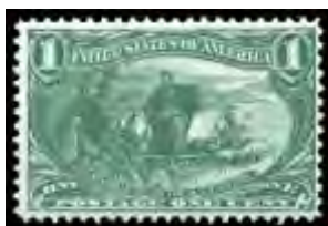
38 ★★ 1898, 1¢ Trans-Miss. (Scott 285), fresh and well centered, o.g., never hinged, Fine to Very Fine. Scott $83. Estimate $30 - 40