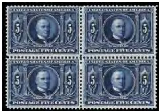
65 ★★/★田 1904, 5¢ Louisiana Purchase (Scott 326), block of 4, an attractive, nicely centered block, o.g., lightly hinged at top, never hinged at bottom, almost Very Fine. Scott $500. Estimate $200 - 300