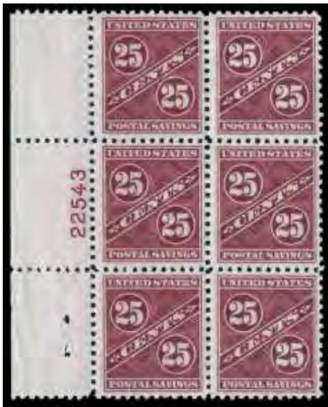
308 ★★/★田 Postal Savings, 1940, 25¢ dark carmine rose (Scott PS8), plate block of 6, fresh and attractive, o.g., 2 stamps never hinged, Fine to Very Fine, seldom offered. Scott $220. Estimate $100 - 150