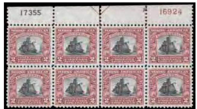
185 ★★田 1925, 2¢ Norse-American (Scott 620), an outstandingly choice plate block of 8, perfectly centered, o.g., never hinged (light gum bend at left), Extremely Fine. Scott $275. Estimate $300 - 400