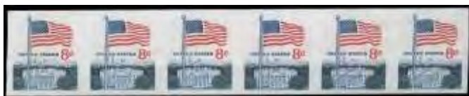
220 ★★ 1971, 8¢ Flag over White House, imperf (Scott 1338Fi var.), horizontal strip of 6, immaculate, o.g., never hinged, Extremely Fine. Scott $105+. Estimate $50 - 75