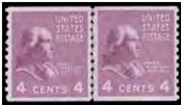
218 ★★ 1939, 4¢ Madison, horizontal coil (Scott 843), line pair, perfect in every respect, o.g., never hinged, Extremely Fine to Superb. Scott $28. Estimate $50 - 75