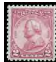
209 ★★ 1930, 2¢ Von Steuben (Scott 689), a magnificent example, perfectly centered and with huge jumbo margins, o.g., never hinged, Superb. Estimate $30 - 40