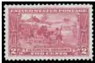
182 ★★ 1925, 2¢ Lexington-Concord (Scott 618), perfect in every respect and with oversized margins, o.g., never hinged, Extremely Fine to Superb. Estimate $40 - 60