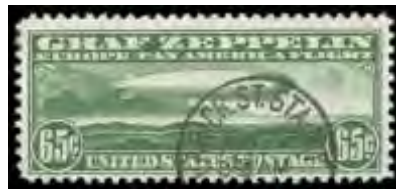
248 ○ Airmail, 1930, 65¢ Graf Zeppelin (Scott C13) , nicely centered and with a lovely c.d.s., almost Very Fine. Scott $150. Estimate $75 - 100