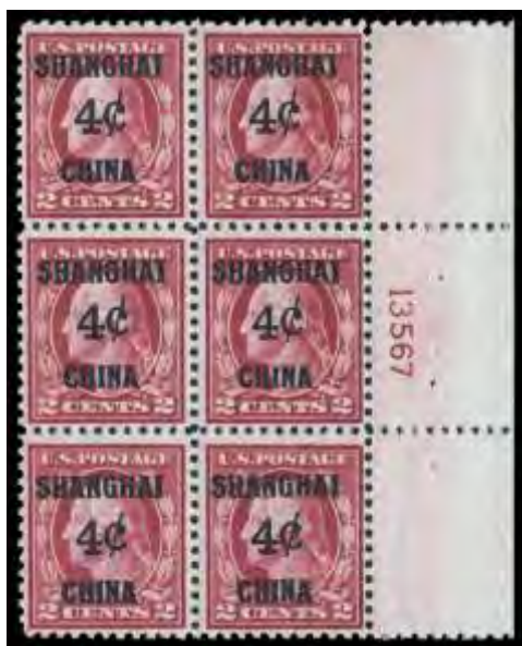
291 ★★田 Offices in China, 1919, 4¢ on 2¢ rose (Scott K2), plate block of 6, attractive centering and very fresh, o.g., never hinged, Very Fine. Scott $600. Estimate $250 - 350