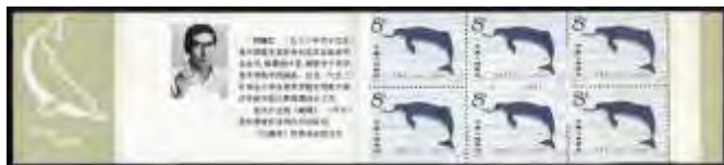
353 ★★ China (People's Republic), Booklet, 1980, Dolphin (SB2), complete unexploded booklet, o.g., never hinged, Very Fine. Scott 1645a, 1646a vars.; $100. Michel 1656/57 SB2. Yang SB2. Estimate $75 - 100