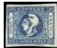
386 (★) Argentina: Buenos Aires, 1859, Liberty Head, 1p blue, partial double impression (Scott 10e) , unused without gum, Fine to Very Fine. Scott $325. Estimate $60 - 80