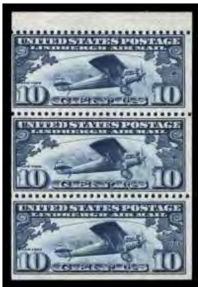
246 ★★ Airmail, 1928, 10¢ Lindbergh (Scott C10a) , booklet pane of 3, fresh, o.g., never hinged, Fine to Very Fine. Scott $115. Estimate $30 - 40