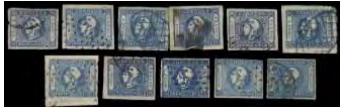
385 ○ Argentina: Buenos Aires, 1859-62, Liberty Head, 1p blue and 2p blue (Scott 10, 13) , 11 used stamps with a good variety of printings, and showing double prints as well. An interesting selection, Fine to Very Fine. Scott $510. Estimate $150 - 200