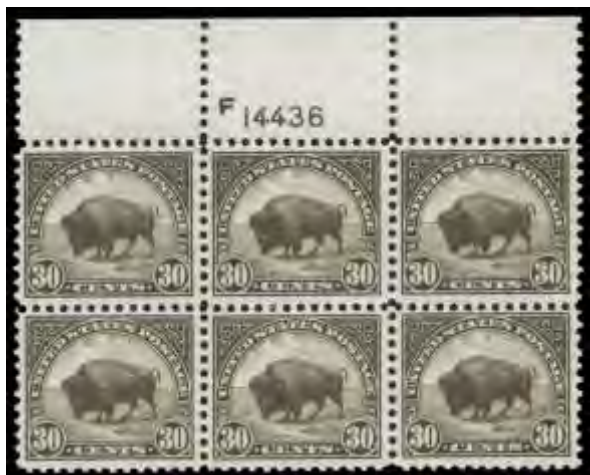
162 ★田 1923, 30¢ Buffalo (Scott 569) , plate block of 6, fantastically well centered, o.g., very lightly hinged, Extremely Fine. Scott $325. Estimate $250 - 350