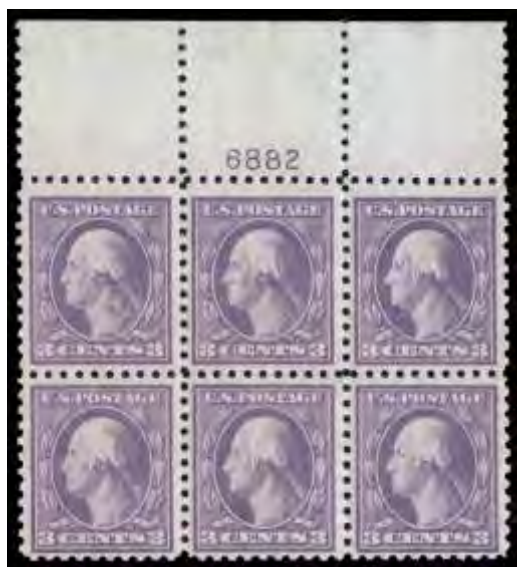
106 ★★田 1914, 3¢ Washington, S.L. watermark, perf 10 (Scott 426), plate block of 6, nicely centered throughout, a premium plate block, o.g., never hinged, Very Fine. Scott $400. Estimate $400 - 600