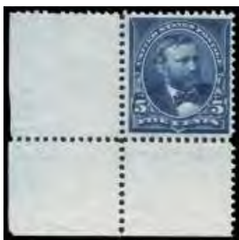
36 ★★ 1898, 5¢ Grant, dark blue (Scott 281), a spectacular corner margin single, with centering that is most impressive, o.g., never hinged, Extremely Fine and choice, a gem! with 2019 P.F. certificate for strip. Scott $100. Estimate $150 - 200