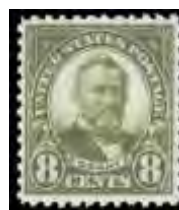
155 ★★ 1923, 8¢ Grant (Scott 560), exceptionally well centered, o.g., never hinged, Very Fine. Scott $80. Estimate $50 - 75