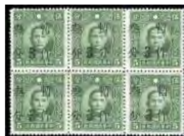
340 ★★田 China, 1940, Kiangsi surcharge on Dr. Sun Yat-sen, Dah Tung printing, 3¢ on 5¢ olive green, overprint error (Scott 444r) , bottom right character "Fun" instead of "Tso", as the top center stamp in a block of 6 with 5 normal, CHINA IMPERIAL - 1940 showing variety top center stamp (unwatermarked), o.g., never hinged; CHAN: 491h. Chan 491h. Estimate $60 - 80