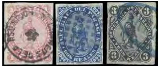
394 ○ Paraguay, 1870, First Issue complete (Scott 1-3) , neat cancels, Very Fine. Scott $380. Estimate $150 - 200