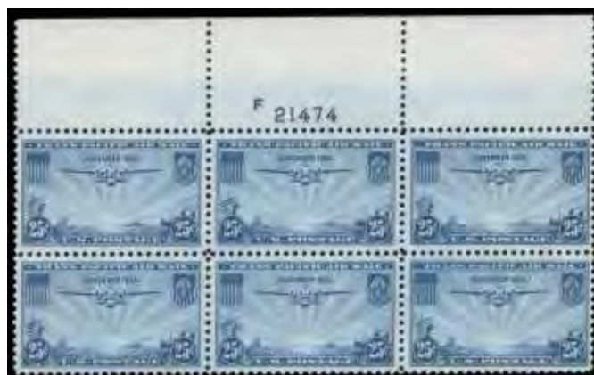
262 ★★田 Airmail, 1935, 25¢ China Clipper (Scott C20), wide top margin plate block of 6, just about perfect in every respect - uncommonly choice, o.g., never hinged, Extremely Fine to Superb. Scott $20. Estimate $30 - 40