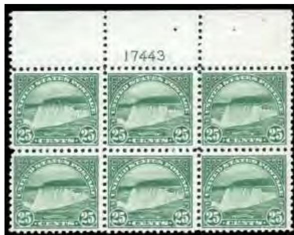
161 ★田 1922, 25¢ Niagara Falls (Scott 568) , plate block of 6, nicely centered with fresh bright color, a premium plate block, o.g., very lightly hinged, Very Fine. Scott $300. Estimate $200 - 300