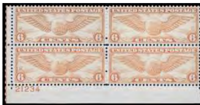
261 ★★田 Airmail, 1934, 6¢ Winged Globe (Scott C19), plate block of 4, flawless and uncommonly choice, o.g., never hinged, Extremely Fine. Scott $20. Estimate $30 - 40