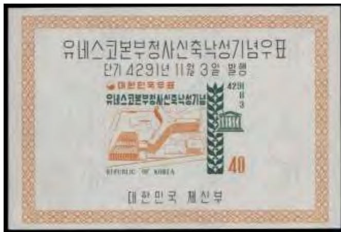
374 ★★ Korea (South), 1958, UNESCO souvenir sheet (Scott 286a), o.g., never hinged. Scott $170. Michel BL 127. Estimate $75 - 100