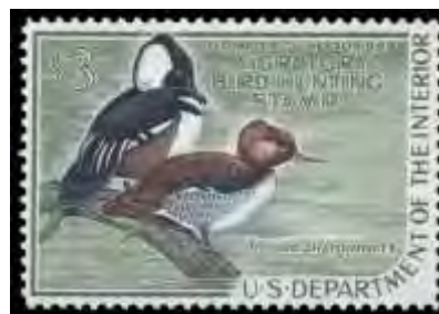
321 ★★ Hunting Permit, 1968, $3 Hooded Mergansers (Scott RW35), beautifully well centered, o.g., never hinged, Extremely Fine. Scott $65. Estimate $40 - 60