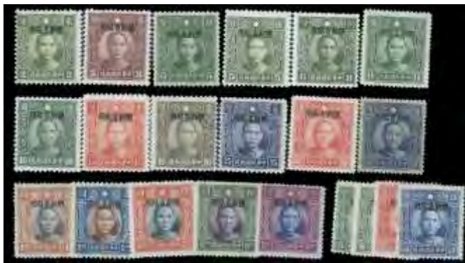
346 ★ Chinese Provinces: Sinkiang, 1940-45, overprints on Dr. Sun, Series 4 complete, set of 21, fresh colors, o.g., lightly hinged, Fine to Very Fine. Scott 115-135; $59. Chan PS147-159, etc. Estimate $40 - 60