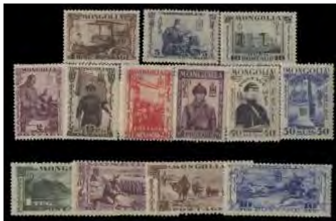
376 ★★/★ Mongolia, 1932, Pictorials, 1m-10t complete (Scott 62-74), o.g., couple low values lightly hinged, otherwise never hinged, Fine to Very Fine. Scott $89. Estimate $40 - 60