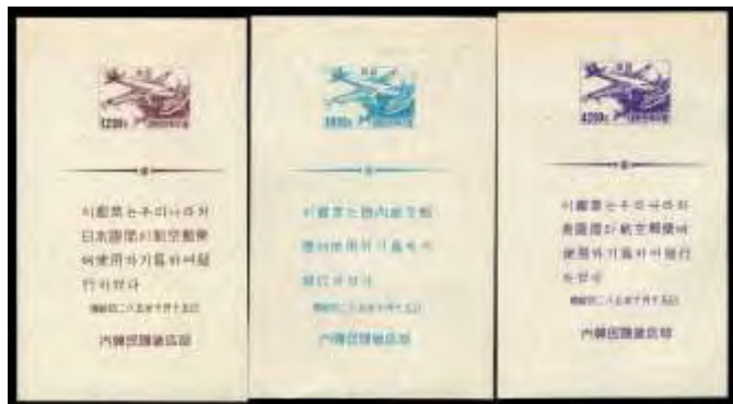
375 (★) Korea (South), Airmail, 1952, Airplane souvenir sheets complete (Scott C6-C8 vars.), without gum as issued, Very Fine, very scarce. Michel BL. 54/56. Estimate $500 - 750