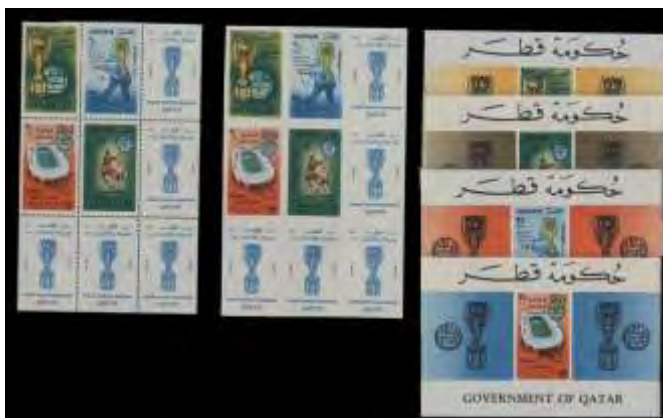
400 ★★ Qatar, 1966, Soccer Championship "England Winners" issue complete, perf and imperf including souvenir sheets , o.g., never hinged. Scott 107 vars. Michel 288-95A, BL 16-19. Estimate $100 - 150