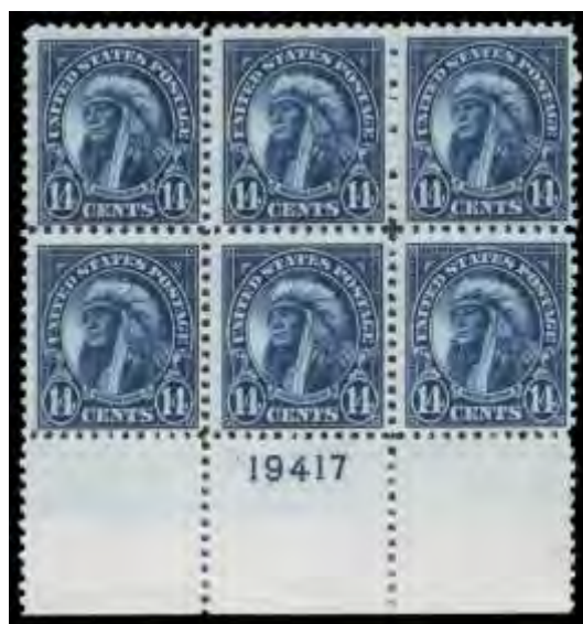
159 ★★田 1923, 14¢ American Indian (Scott 565) , plate block of 6, immaculate, pristine o.g., never hinged, nearly Very Fine. Scott $120. Estimate $75 - 100