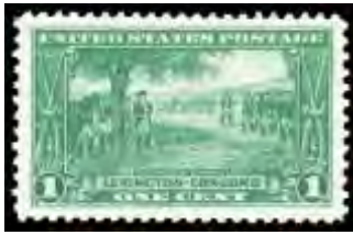
180 ★★ 1925, 1¢ Lexington-Concord (Scott 617), a one-in-a-million gem, o.g., never hinged, Superb. Estimate $30 - 40