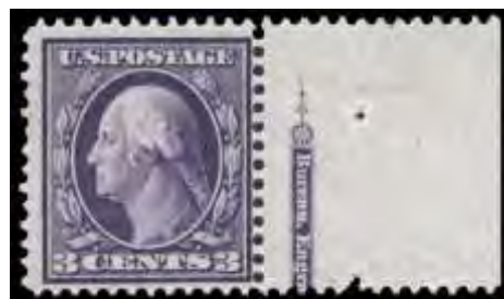
74 ★★ 1909, 3¢ Washington, bluish paper (Scott 359), part imprint single, a lovely fresh example of this scarce issue, o.g., stamp never hinged, hinged in selvage only, Fine; with 2018 P.F. certificate. Scott $4,000. Estimate $1,500 - 2,000