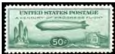
259 ★★ Airmail, 1933, 50¢ "Chicago" Zeppelin (Scott C18), beautifully well centered within large margins, o.g., never hinged, Extremely Fine to Superb. Scott $75. Estimate $75 - 100