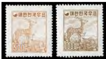
372 ★★ Korea (South), 1957, Watermarked Redrawn Definitives complete (Scott 249-262), set of 14, o.g., never hinged, Very Fine. Scott $290. Michel 243-256. Estimate $150 - 200