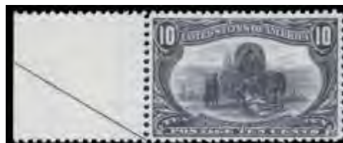
40 ★★ 1898, 10¢ Trans-Miss. (Scott 290), an exceptionally choice gem, bright and fresh and almost perfectly centered, o.g., never hinged, Extremely Fine. Scott $425. Estimate $300 - 400