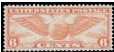
260 ★★ Airmail, 1934, 6¢ Winged Globe (Scott C19), almost perfectly centered, rarely seen this nice, o.g., never hinged, Extremely Fine. Estimate $30 - 40