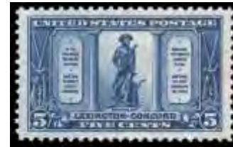
184 ★★ 1925, 5¢ Lexington-Concord (Scott 619), a one-in-a-million gem, o.g., never hinged, Superb. Scott $26. Estimate $50 - 75