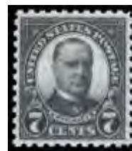
167 ★★ 1926, 7¢ McKinley, rotary press, perf 10 (Scott 588) , perfect in every respect, the margins and centering are most impressive, o.g., never hinged, Extremely Fine to Superb. Scott $26. Estimate $50 - 75