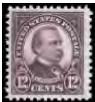
157 ★★ 1923, 12¢ Grover Cleveland (Scott 564) , an attractive example with unusually large margins, o.g., never hinged, Very Fine; with photocopy of 2002 P.S.E. certificate for block. Scott $11. Estimate $20 - 30