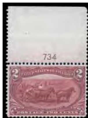
39 ★★ 1898, 2¢ Trans-Miss. (Scott 286), plate number single, fresh and beautifully well centered, o.g., never hinged, Very Fine to Extremely Fine. Scott $73. Estimate $60 - 80