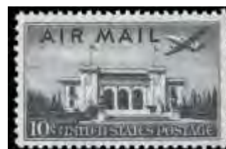
263 ★★ Airmail, 1947, 10¢ Pan-American Building (Scott C34), an exceptionally choice example, o.g., never hinged, Extremely Fine to Superb. Estimate $20 - 30