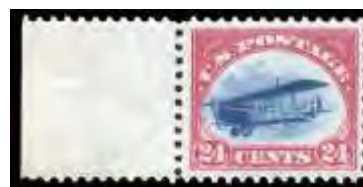
229 ★★ Airmail, 1918, 24¢ carmine rose & blue (Scott C3), a premium example boasting excellent centering, margins and color, o.g., never hinged, Extremely Fine; with photocopy of 2018 P.F. certificate for block. Scott $130. Estimate $100 - 150