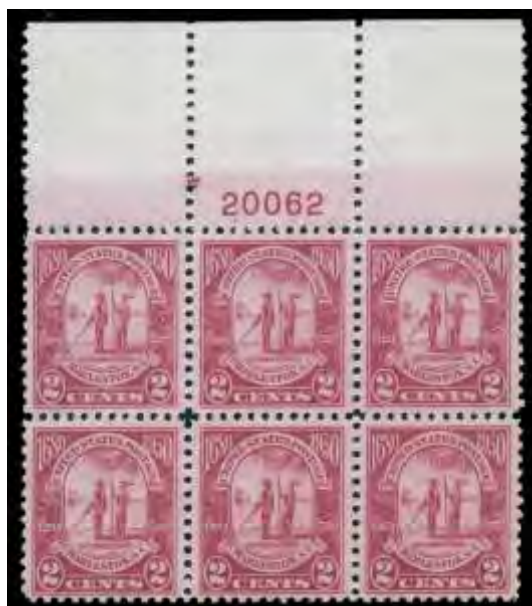
207 ★★田 1930, 2¢ Charleston (Scott 683), plate block of 6, extraordinarily choice, o.g., never hinged, Extremely Fine to Superb. Scott $50. Estimate $80 - 120