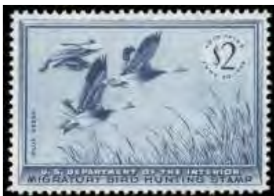
316 ★★ Hunting Permit, 1955, $2 Blue Geese (Scott RW22), perfectly centered, o.g., never hinged, Extremely Fine to Superb. Scott $85. Estimate $50 - 75