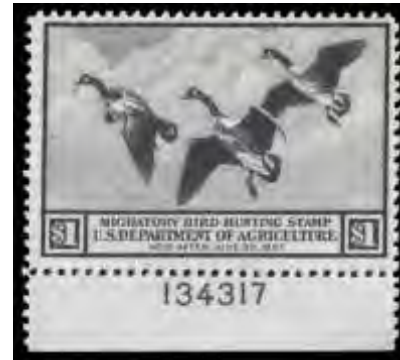
309 ★★ Hunting Permit, 1936, $1 Canada Geese (Scott RW3), plate number single, beautifully fresh and well centered, o.g., never hinged, Very Fine; with 2018 P.F. certificate. Scott $325. Estimate $200 - 300