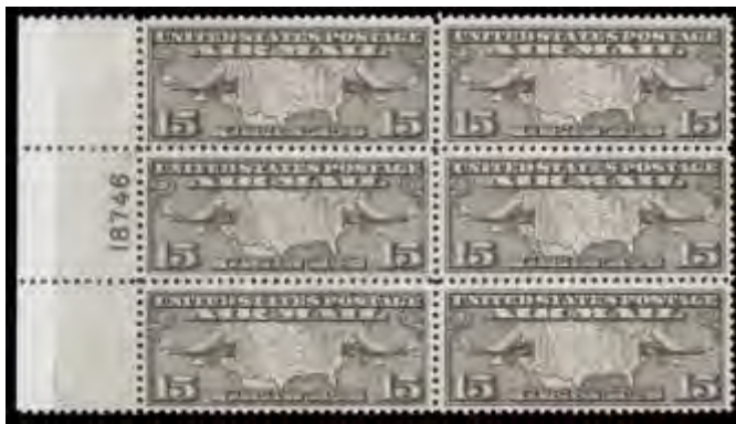
245 ★★田 Airmail, 1926, 15¢ Map & Planes (Scott C8) , plate block of 6, a beautiful plate block, well centered throughout, uncommonly choice, o.g., never hinged, Extremely Fine. Scott $45. Estimate $50 - 75