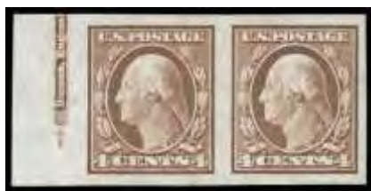
72 ★★ 1909, 4¢ Washington, D.L. watermark, imperf (Scott 346), horizontal pair with part imprint, a beautiful premium example, perfect in every respect, o.g., never hinged, Extremely Fine to Superb. Scott $55. Estimate $75 - 100