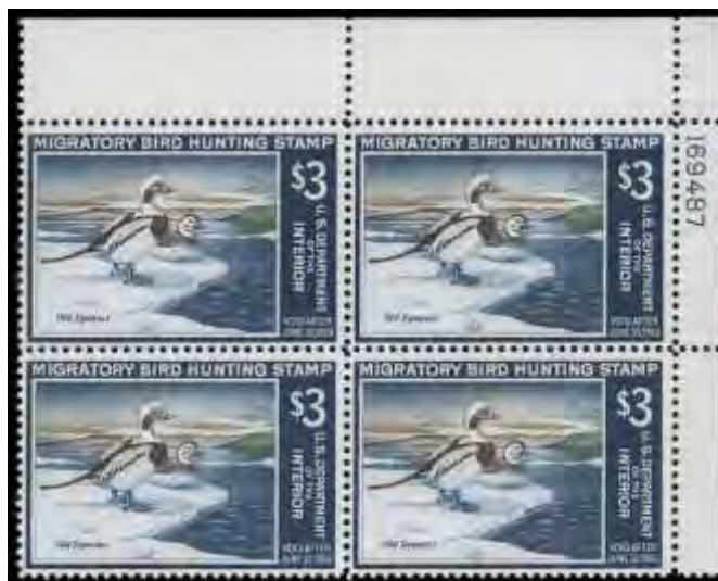
320 ★★ Hunting Permit, 1967, $3 Old Squaw Ducks (Scott RW34), plate block of 4, immaculate, o.g., never hinged, Very Fine. Scott $550. Estimate $250 - 350