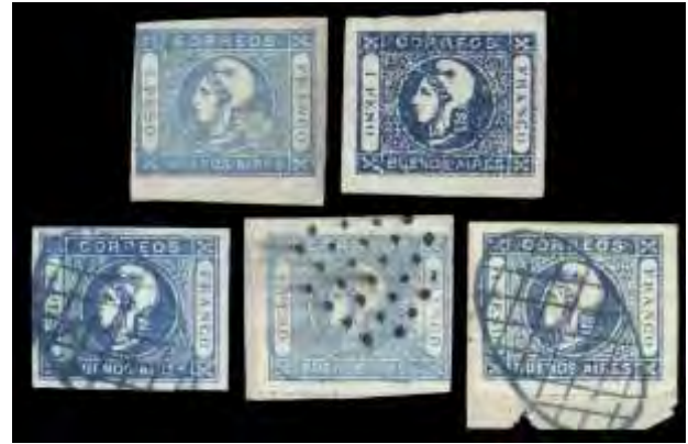
384 ★/○ Argentina: Buenos Aires, 1859, Liberty Head, 1p blue, fine impression, also 1p milky blue and 1p indigo (Scott 10, 10a, 10b) , unused & used, Fine to Very Fine. Scott $780. Estimate $150 - 200