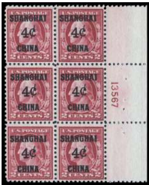
303 ★★田 Offices in China, 1919, 4¢ on 2¢ rose (Scott K2), plate block of 6, attractive centering and very fresh, o.g., never hinged, Very Fine. Scott $600. Estimate $350 - 500