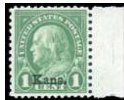
242 ★★ 1929, 1¢ Kans. (Scott 658), a lovely example, o.g., never hinged, Very Fine; with 2002 P.S.E. certificate for block. Estimate $20 - 30