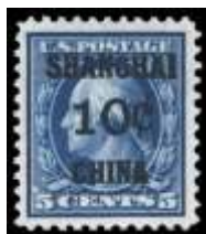
304 ★★ Offices in China, 1919, 10¢ on 5¢ blue (Scott K5), beautifully well centered with deep rich color on brilliant white paper, o.g., never hinged, Extremely Fine. Scott $160. Estimate $150 - 200