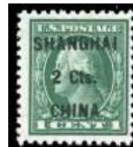
307 ★★ Offices in China, 1922, 2¢ on 1¢ green (Scott K17), lovely color and large margins, o.g., never hinged, Fine to Very Fine; with photocopy of 2019 P.F. certificate for block. Scott $225. Estimate $75 - 100