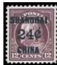
306 ★★ Offices in China, 1919, 24¢ on 12¢ brown carmine (Scott K11), mathematically perfect centering, a beautiful gem, o.g., never hinged, Extremely Fine and choice. Scott $190. Estimate $200 - 300