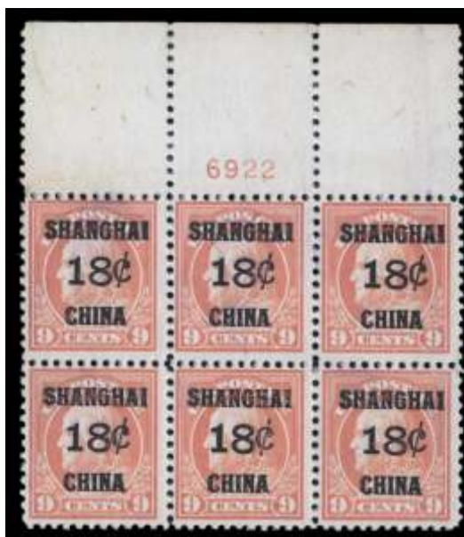
305 ★★田 Offices in China, 1919, 18¢ on 9¢ salmon red (Scott K9), plate block of 6, fresh, o.g., never hinged, Fine to Very Fine. Scott $1,200. Estimate $400 - 600