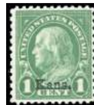
241 ★★ 1929, 1¢ Kans. (Scott 658), a lovely example, o.g., never hinged, Very Fine; with 2002 P.S.E. certificate for block. Estimate $20 - 30