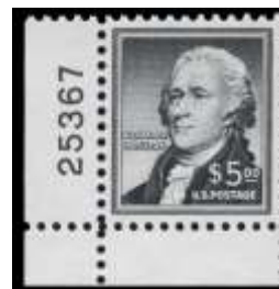
259 ★★ 1956, $5 Hamilton (Scott 1053), plate number single, o.g., never hinged, Extremely Fine. Scott $58. Estimate $40 - 60