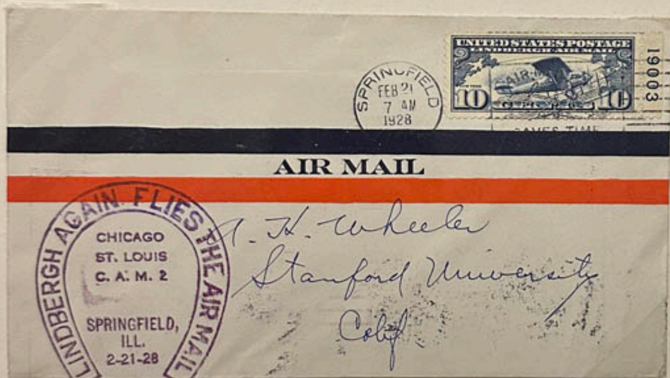
Lindbergh Again Flies The Air Mail 2-21-28 Springfield, Illinois