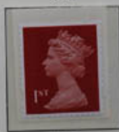
"M2L" and "MBL" 2 bands