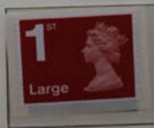
"MAI2" and "MBL" 2 bands