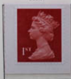
"M2L" and "MCL" 2 bands