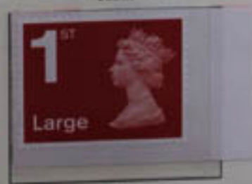
"MAI2" and "MPL" 2 bands