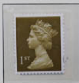
"MAI2" and "MRL" 2 bands

Self-adhesive stamps – Printed in photogravure with fluorescent phosphor bands – Perf. 14½ x 14 (with oval shaped perforation holes) With iridescent overprint "ROYALMAIL"; with source code and date code