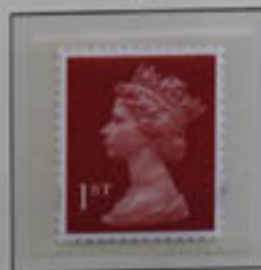
"MAI2" and "MRL" 2 bands