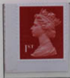
"M2L" and "MSL" 2 bands