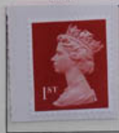
"M2L" and "MTL" 2 bands