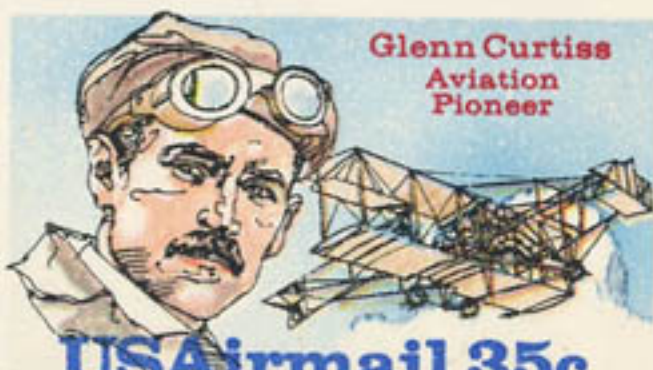
Glenn Curtiss Aviation Pioneer