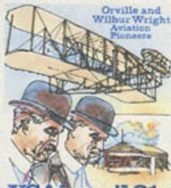
Orville and Wilbur Wright Aviation Pioneers