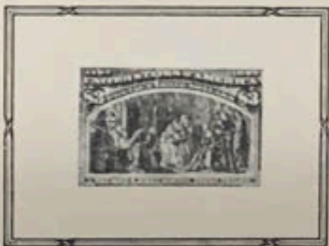
Columbus describing third voyage