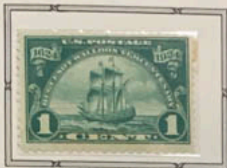
The New Netherlands