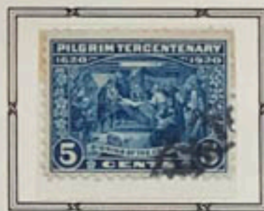
Signing of the Compact

Authorized by Congress, the Postmaster General first placed on sale in December, 1920, a set of three stamps commemorating the 300th anniversary of the landing of the Pilgrims at Provincetown and Plymouth, Mass.