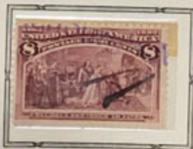
Columbus restored to favor