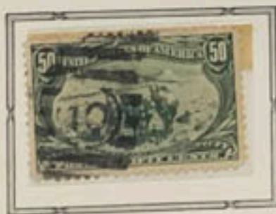
Western Mining Prospector