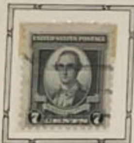
Portrait by Trumbull