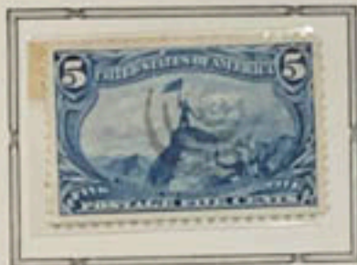
Freemont on Rocky Mountains