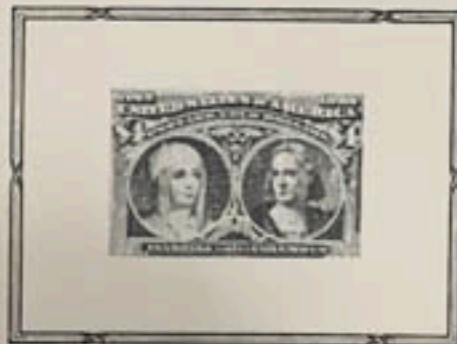
Isabella - Columbus