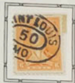
Painting by Trumbull