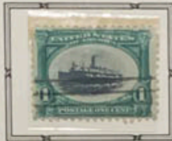
Fast Lake Navigation