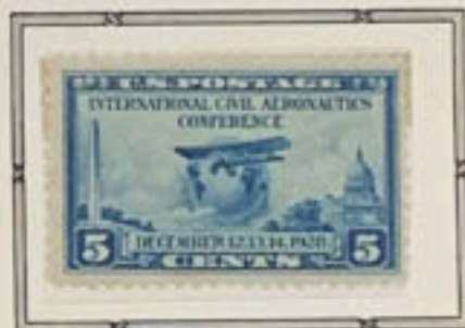
Globe and Plane

The International Civil Aeronautics Conference was held in Washington, D. C., December 12-14, 1928, to commemorate the 25th anniversary of the Wright Brothers Flight at Kitty Hawk, N. C.