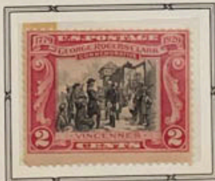
Surrender of Fort Sackville

A painting by Frederick C. Yohn showing the surrender of Fort Sackville near Vincennes, Ind., adorns the bicolor stamp honoring George Rogers Clark issued in 1929.