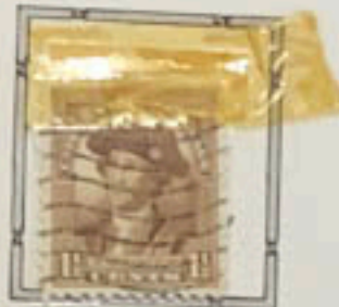
Painting by Peale