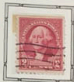
Painting by Stuart