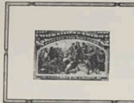
Columbus in chains