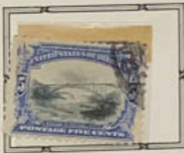
Bridge at Niagara Falls