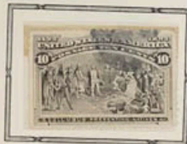
Columbus presenting natives