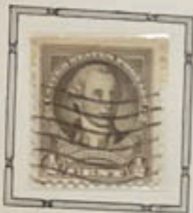
Miniature by Peale