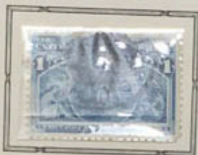
Columbus in sight of land