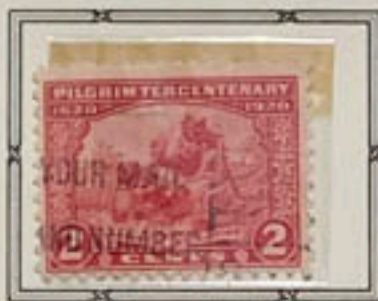
Landing of the Pilgrims