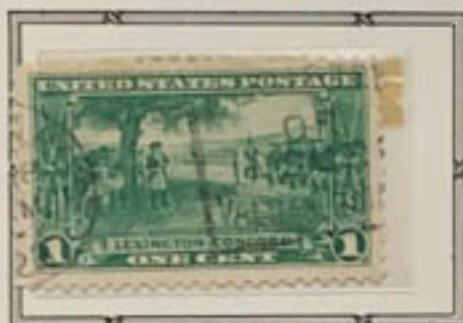
Washington at Cambridge