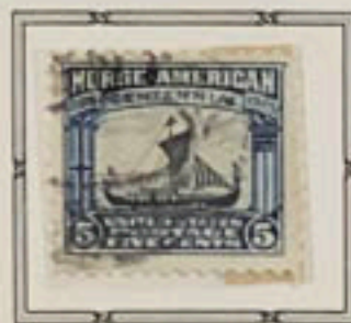
A Viking Ship

Two stamps of 2¢ and 5¢ denomination were issued to commemorate the 100th anniversary of the arrival in New York, on October 9, 1825, of the sloop Restaurationen with the first group of immigrants to the United States from Norway.