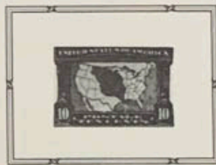
Map of Louisiana Purchase

Issued to commemorate and publicize the World's Fair, St. Louis, 1903 the purpose of which was to celebrate the 100th anniversary of the purchase of the Louisiana Territory from France. The stamps, in a set of five, were placed on sale May 1, 1904, to December 1, 1904, and honored those connected with its purchase, as well as a map of the territory.