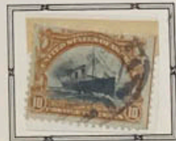
Fast Ocean Navigation

Coinciding with the opening and closing of the Pan American Exposition at Buffalo, N. Y., this set was placed on sale May 1, 1901, at Post Offices throughout the country and withdrawn from sale October 31, 1901. The stamps were issued to commemorate and publicize the exposition which had for its theme, "To illustrate the progress of the New World during the 19th Century." Pictures on the stamps are reproductions from current means of transportation.