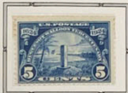
Monument at Mayport, Fla.

This series of postage stamps was issued to commemorate the three hundredth anniversary of the settling of the Walloons in New Netherlands in 1624. This is now the State of New York.