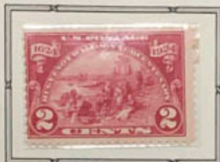
Landing at Fort Orange