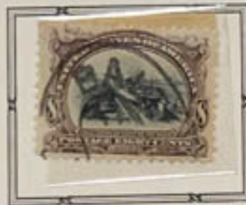
Canal Locks at Sault Ste. Marie