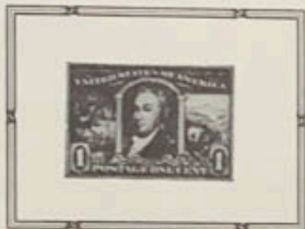
Robert R. Livingston