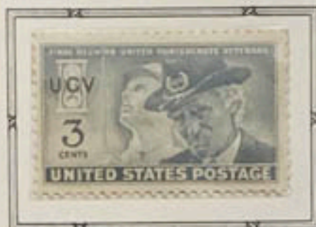
Confederate Soldier - Now and Then

Nevada became a Territory through the treaty of Guadalupe Hidalgo at the close of the Mexican War. It was later included in the Utah Territory. In 1861, the Territory was divided and the western half became Nevada.