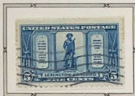
The Minute Man

These stamps commemorate the 150th anniversary of the Battle of Lexington and Concord—the birthplace of Liberty and the Minute Man, and where also, the famous eclogue, "By the rude bridge that arched the flood their flag to April's breeze unfurled. Here once the embattled farmers stood and fired the shot heard round the world", stands inscribed.