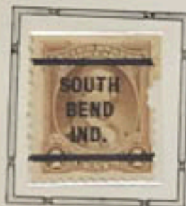
Painting by Polk