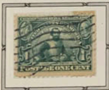
Captain John Smith