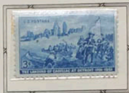
Landing of Cadillac

This stamp commemorates the 250th anniversary of the founding of Detroit by Antoine de la Mothe Cadillac in 1701. It is the oldest of the larger cities, west of the original seaboard colonies and is known as the Motor City.