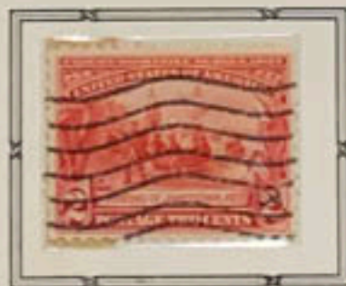
Founding of Jamestown