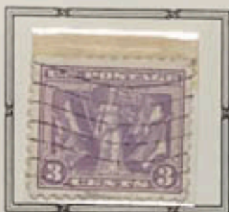
Victory and Flags

The successful termination of World War I brought forth a special 3¢ Victory Stamp with its first day sale at Washington, D. C., in March, 1919. A composite, featuring Liberty in front of massed flags, is the central design of the stamp.