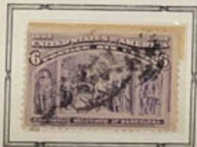
Columbus welcomed at Barcelona