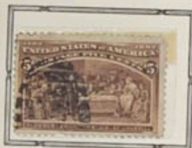
Columbus soliciting aid from Isabella