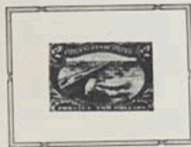
Mississippi River Bridge

This set of nine stamps was issued to commemorate the opening of the Trans-Mississippi and International Exposition at Omaha, Nebraska. The various scenes portrayed on the stamps were taken from art reproductions depicting the progress of the "Golden West." The Series was placed on sale June 15, 1898, and discontinued on December 31st of the same year.