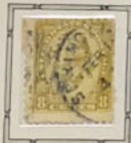
Drawing by St. Mevins