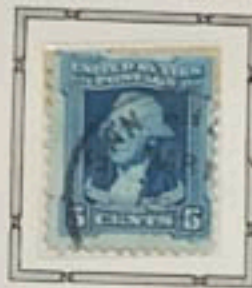
Painting by Peale