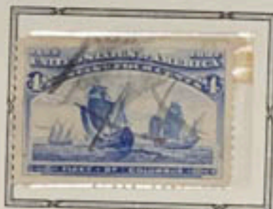
Fleet of Columbus