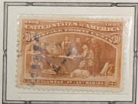
Columbus at La Rabida