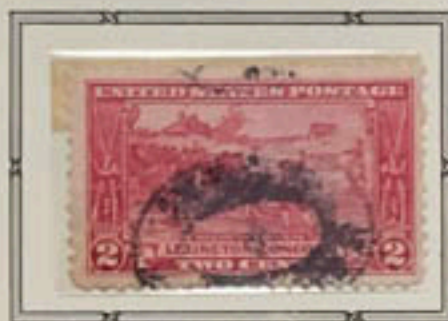
Birth of Liberty