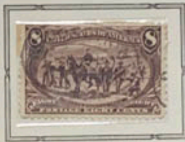
Troops Guarding Train