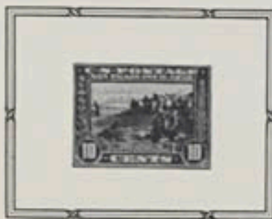
Discovery of San Francisco Bay