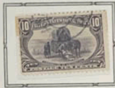
Hardships of Emigration