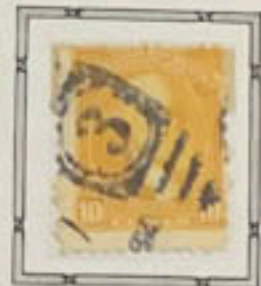
Painting by Stuart

In cooperation with the national celebration of the two hundredth anniversary of the birth of George Washington, a special series of twelve stamps in denominations of 1/2 cent to 10 cents was authorized. The stamps are of regular postage size, arranged vertically, and have as the central design portraits of Washington modeled from the works of noted artists.