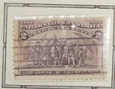
Landing of Columbus