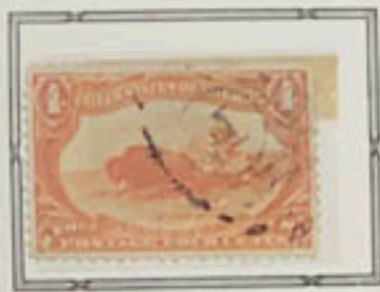
Indian Hunting Buffalo