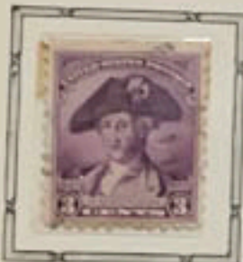
Portrait by Peale