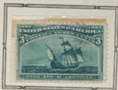
Flagship of Columbus