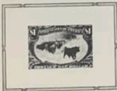
Western Cattle in Storm