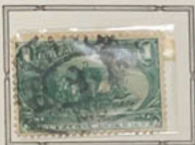
Marquette on the Mississippi