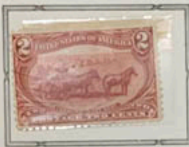
Farming in the West