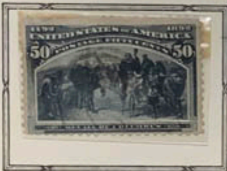
Recall of Columbus