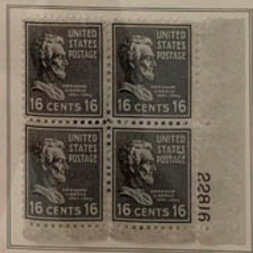
22816 Abraham Lincoln