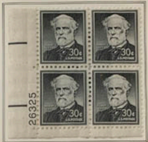
Robert E. Lee 1049