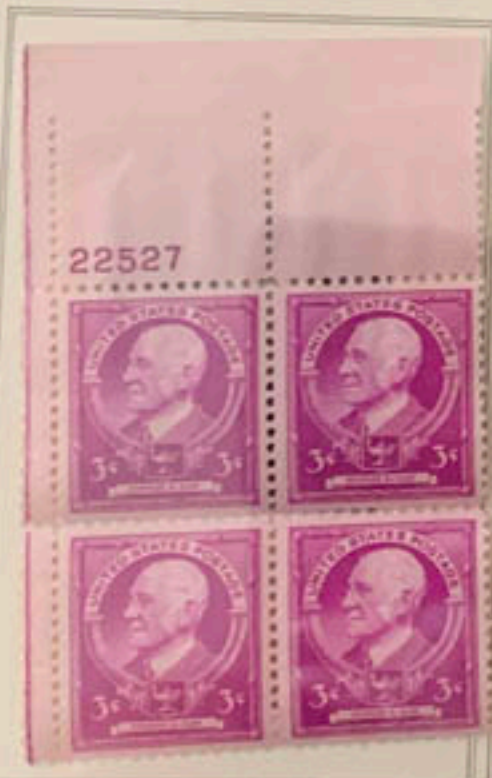
Charles W. Eliot