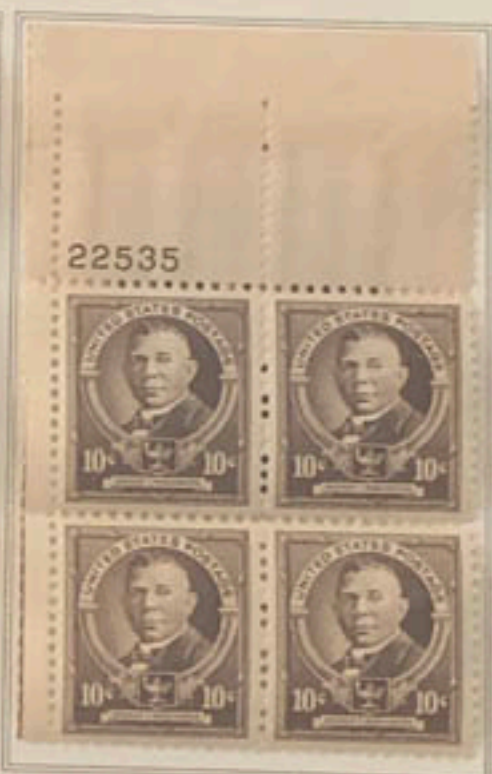
Booker T. Washington