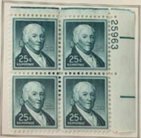
Paul Revere 1049