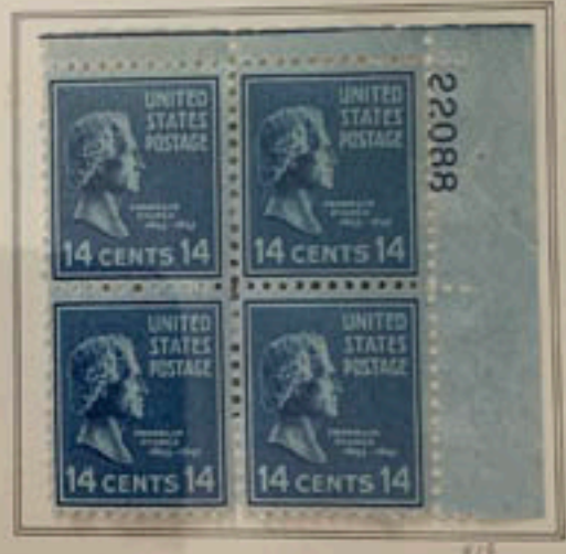
22088 Franklin Pierce