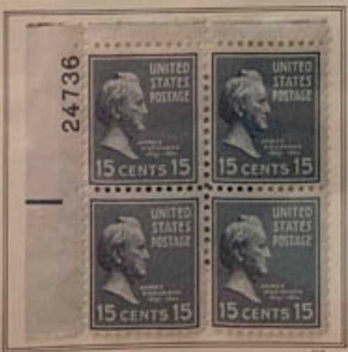
24736 James Buchanan