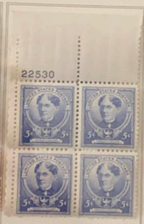
Frances E. Willard