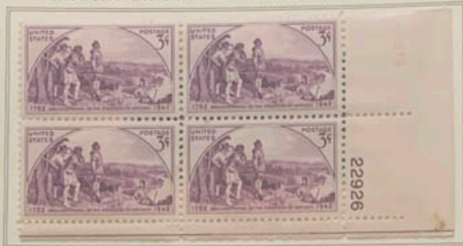
Daniel Boone and Frontiersmen from Mural in State Capital