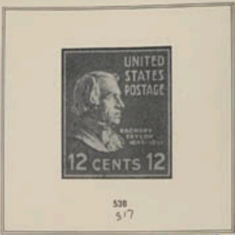
538 517 Zachary Taylor