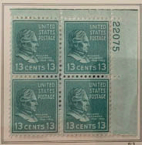
22075 Millard Fillmore