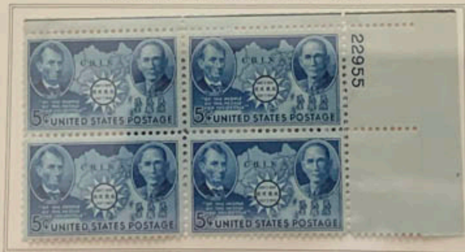
Abraham Lincoln, Sun Yat-Sen and Map of China