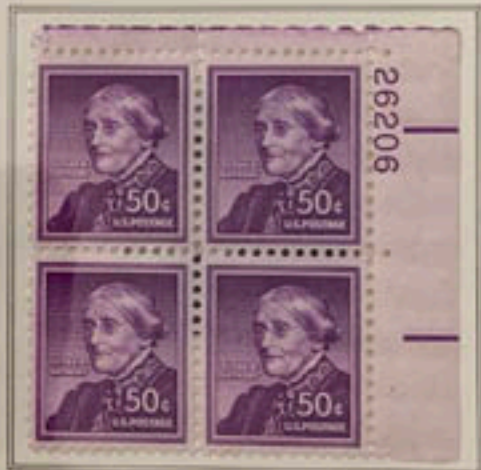
Susan B. Anthony 1051