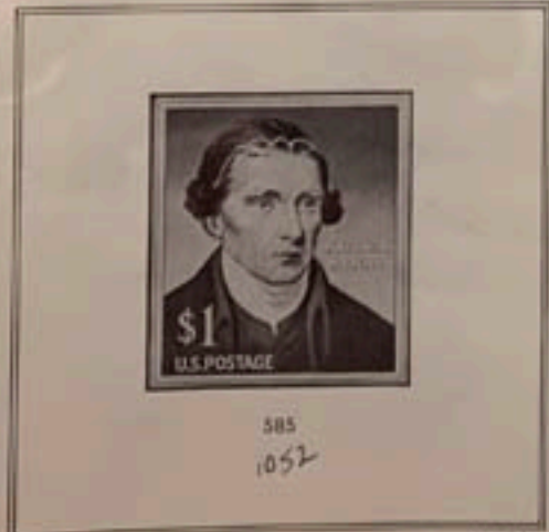
585 1052 Patrick Henry 1052