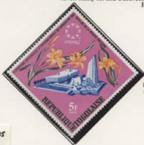
British Pavilion and Day Lilies