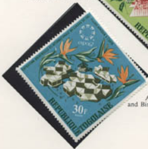
African Village and Bird-of-paradise flower