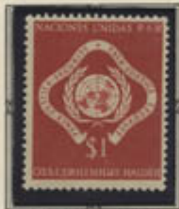
United Nations Emblem 11