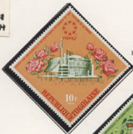
French Pavilion and Roses