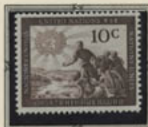
"Peoples of the World" 6