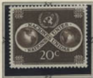
Hemispheres of the World 8