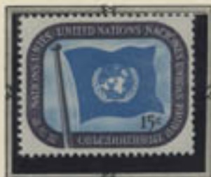
United Nations Flag 7