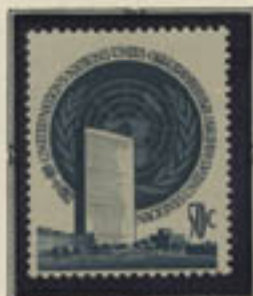
U. N. Headquarters Building 10