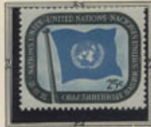
United Nations Flag 9