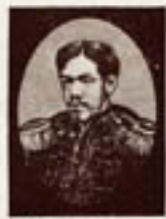
SI MITSURITO JAPAN