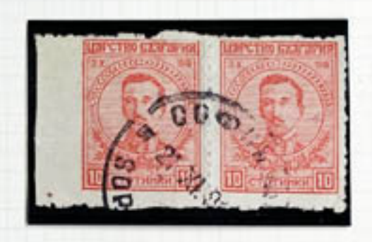
constitutions of seast