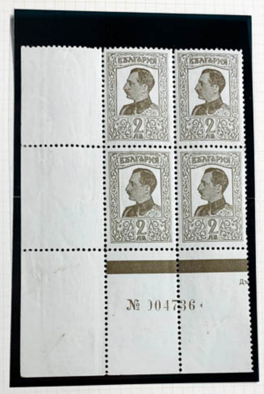
THIN PAPER SIGNED KAKTIVANOFF Michel 1944 EGOD block