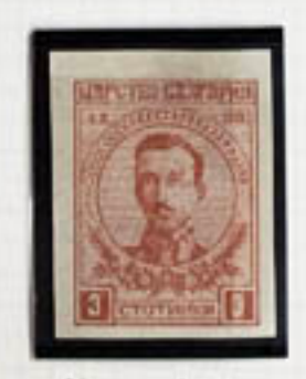
30s on resure