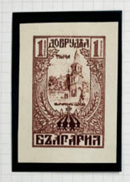
15 Escar possible briais