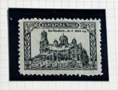
THE MAIOR DOUBLE TRANSFER