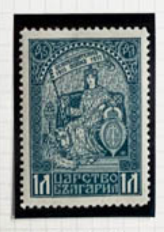
UNISTORD I ELV