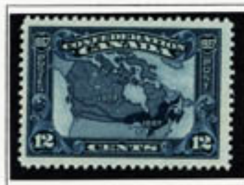
Map of Canada