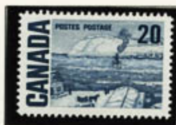
"The Ferry, Quebec" by I. W. Morrice