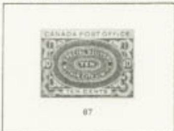
First special delivery stamp

Use restricted to city limits, just as first United States special delivery service was available only in major post offices.