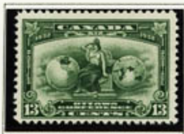
Allegory of Empire