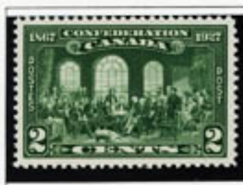
Fathers of Confederation