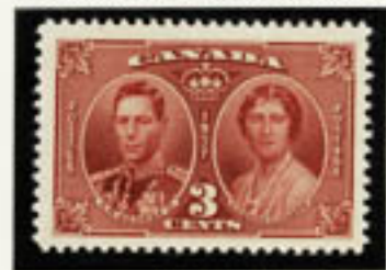
George VI and Elizabeth