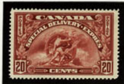
Allegory of Progress