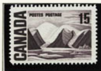
"Bylot Island" by Lawrence Harris