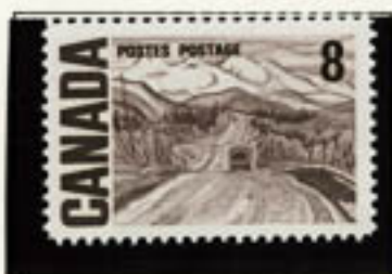
"Alaska Highway Between Watson Lake and Nelson" by A. Y. Jackson