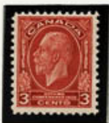
King George V