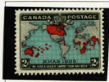
British Empire in scarlet on map.

Penny postage throughout empire began on Christmas Day 1898. Quotation is from Sir Lewis Morris' poem, Song of Empire.