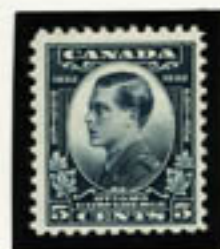
Edward, Prince of Wales

Imperial Economic Conference held in Ottawa in 1932.