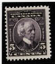
Sir Wilfred Laurier