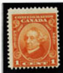
Sir John A. MacDonalld