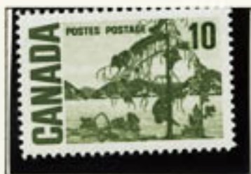
"The Jack Pine" by Tom Thomson