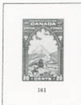
Modes of mail transportation

This issue tells the story of the Canadian Confederation. Sir John A. MacDonalld (1815-91), one of the framers of the British North America Act and the Dominion's first Prime Minister, is shown on the 1¢ stamp. The 5¢ stamp depicts Sir Wilfred Laurier (1841-1919), first French-Canadian to be elected prime minister.