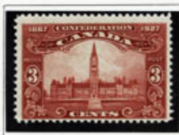
Parliament buildings, Ottawa