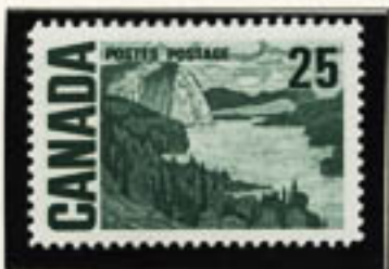
"The Solemn Land" by J. E. H. MacDonald