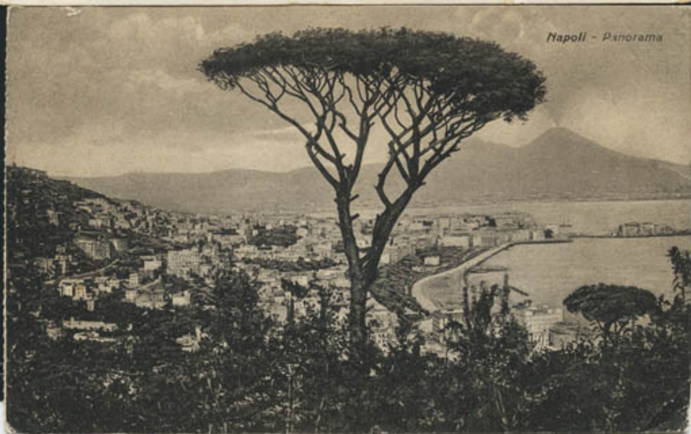
Napoli - Panorama