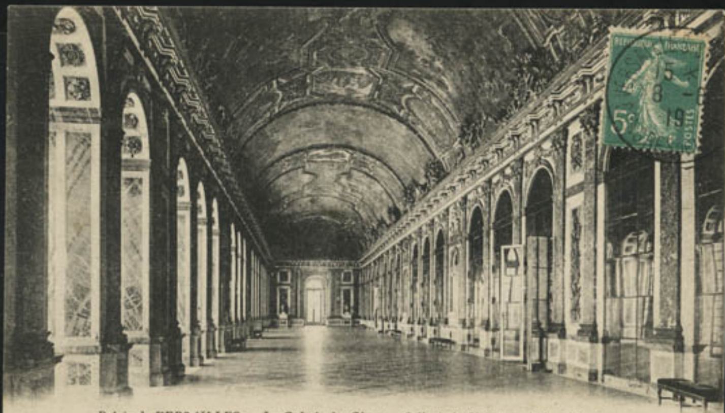
Palais de VERSAILLES. - La Galerie des Glaces - Salle de la Signature de la Paix de 1919 Palace of Versailles - Mirrors' Gallery - The Room where the Peace was signed in 1919