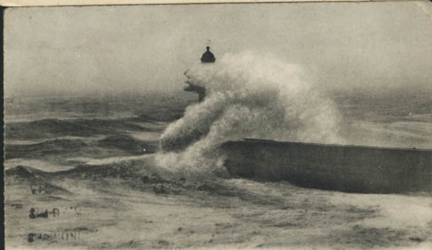
4039 LA PALICE-ROCHELLE. - Le Phare un Jour de Tempête. -- LL.