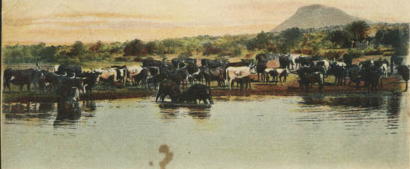
Rinderzucht der Firma Wecke & Voigts auf Farm Voigtland bei Windhoek