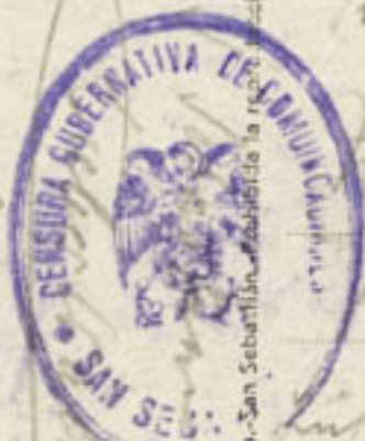
cobradora la red. Sección

DIRECCION GENERAL DE SEGURIDAD SAN SEBASTIAN CENSURADO