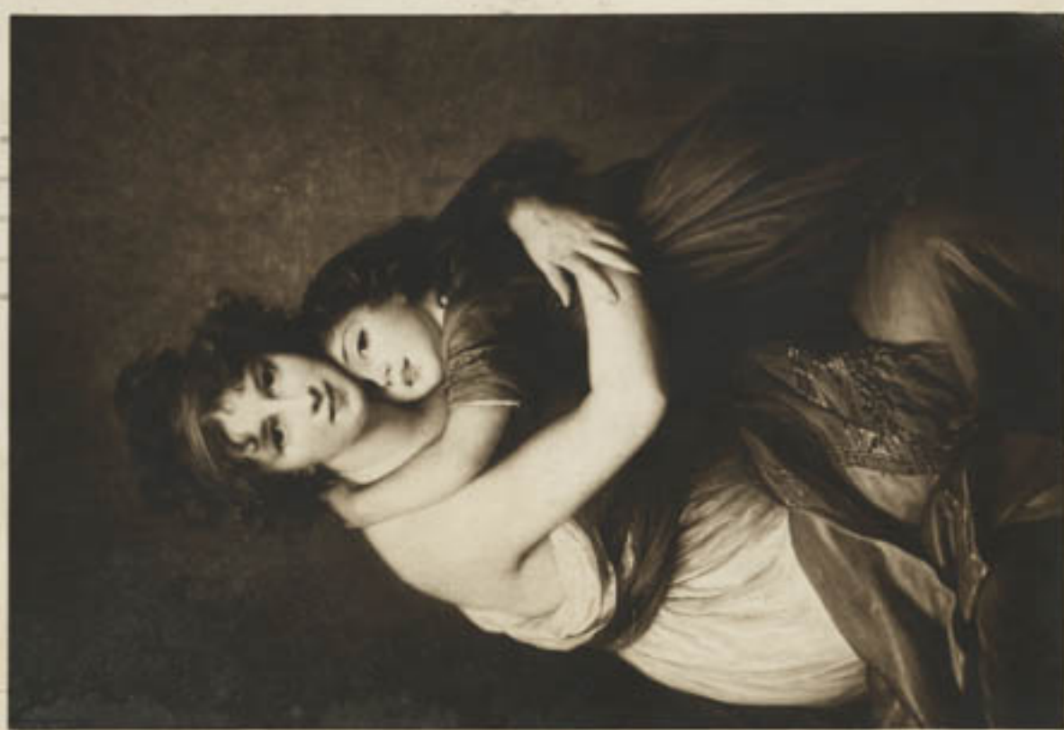
8 — MUSEE DU LOUVRE — M me VIGÉE LE BRUN ET SA FILLE PAR ELLE M me M me N o 581