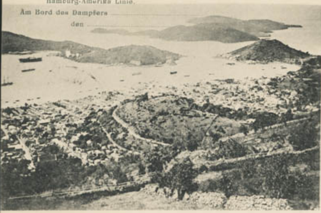
St. Thomas. Bahla y Ciudad

This is an fine landing place. Due there tonight about eleven o'clock. Said to be fine harbor in W.I. Both are well & enjoying ourselves.