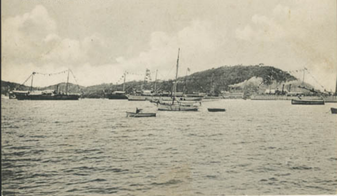
Harbour View, St. Thomas, D. W. I.