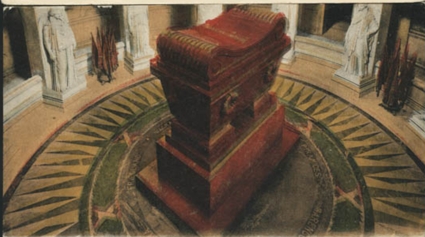
358 — PARIS — Le Tombeau de Napoléon I er aux Invalides A. P. Tomb of Napoleon I er at Invalides