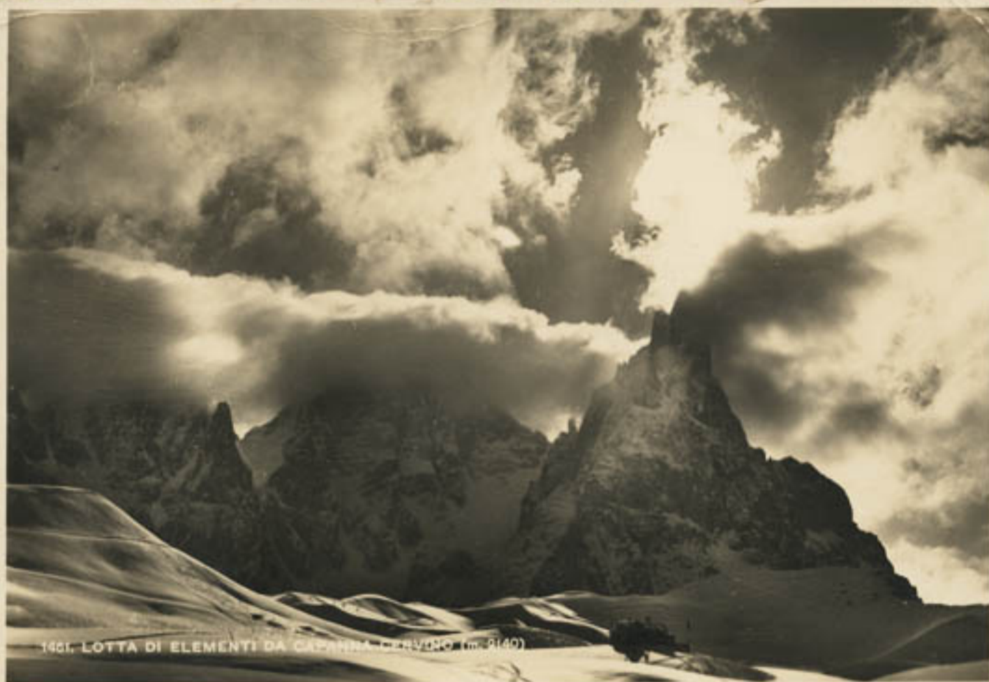
1401. LOTTA DI ELEMENTI DA CAPANNA (CERVINO) (m. 9140)