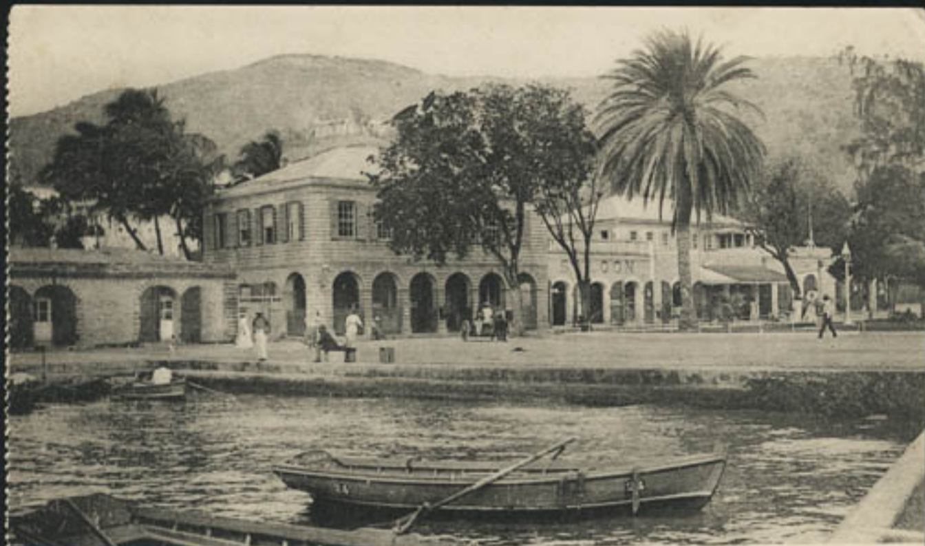
Custom House and Post Office, St. Thomas, D. W. I.