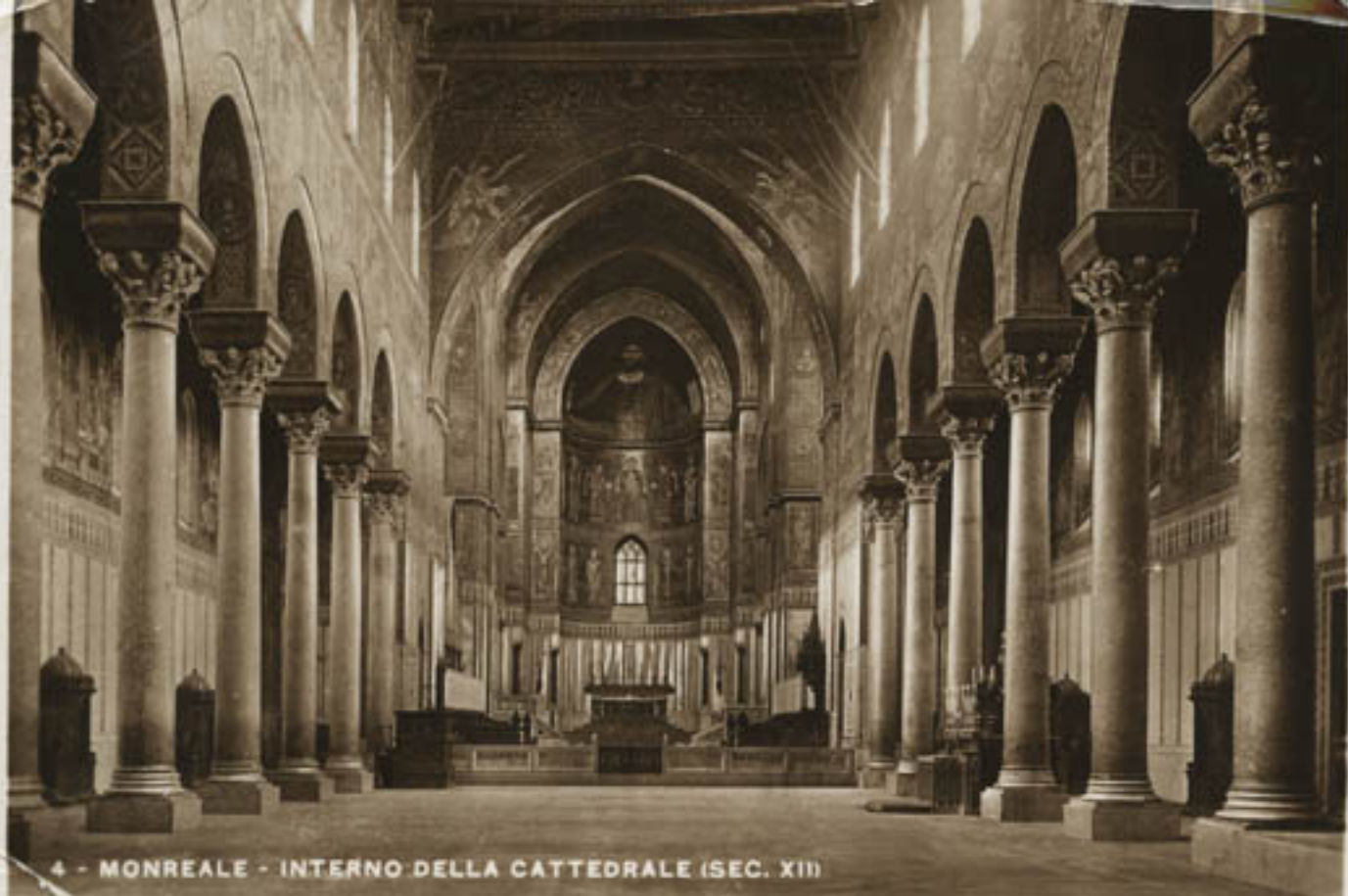
4 - MONREALE - INTERNO DELLA CATTEDRALE (SEC. XII)