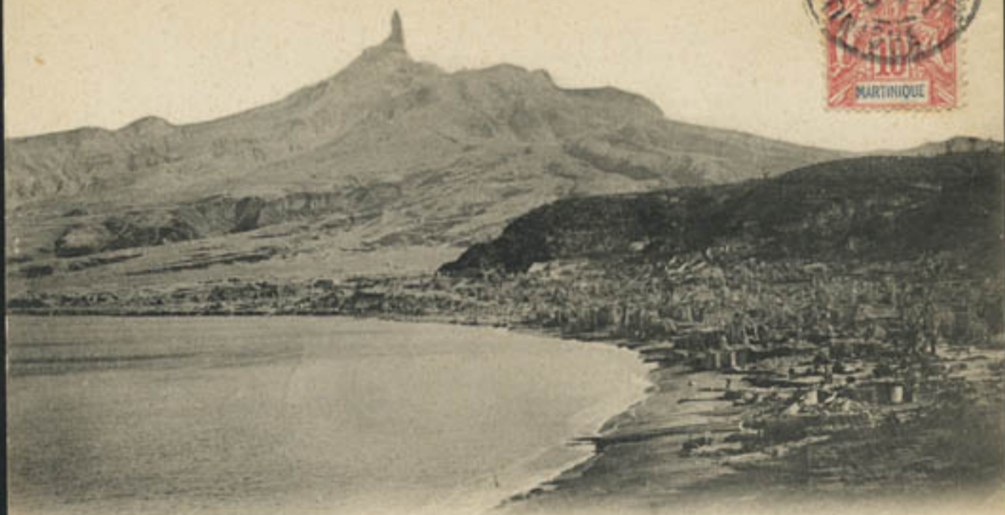
ST-PIERRE. - LA VILLE ET LA MONTAGNE PELÉE DEPUIS LA CATASTROPHE

Laboullanger, éditeur à Fort-de-France (Martinique) - 2832