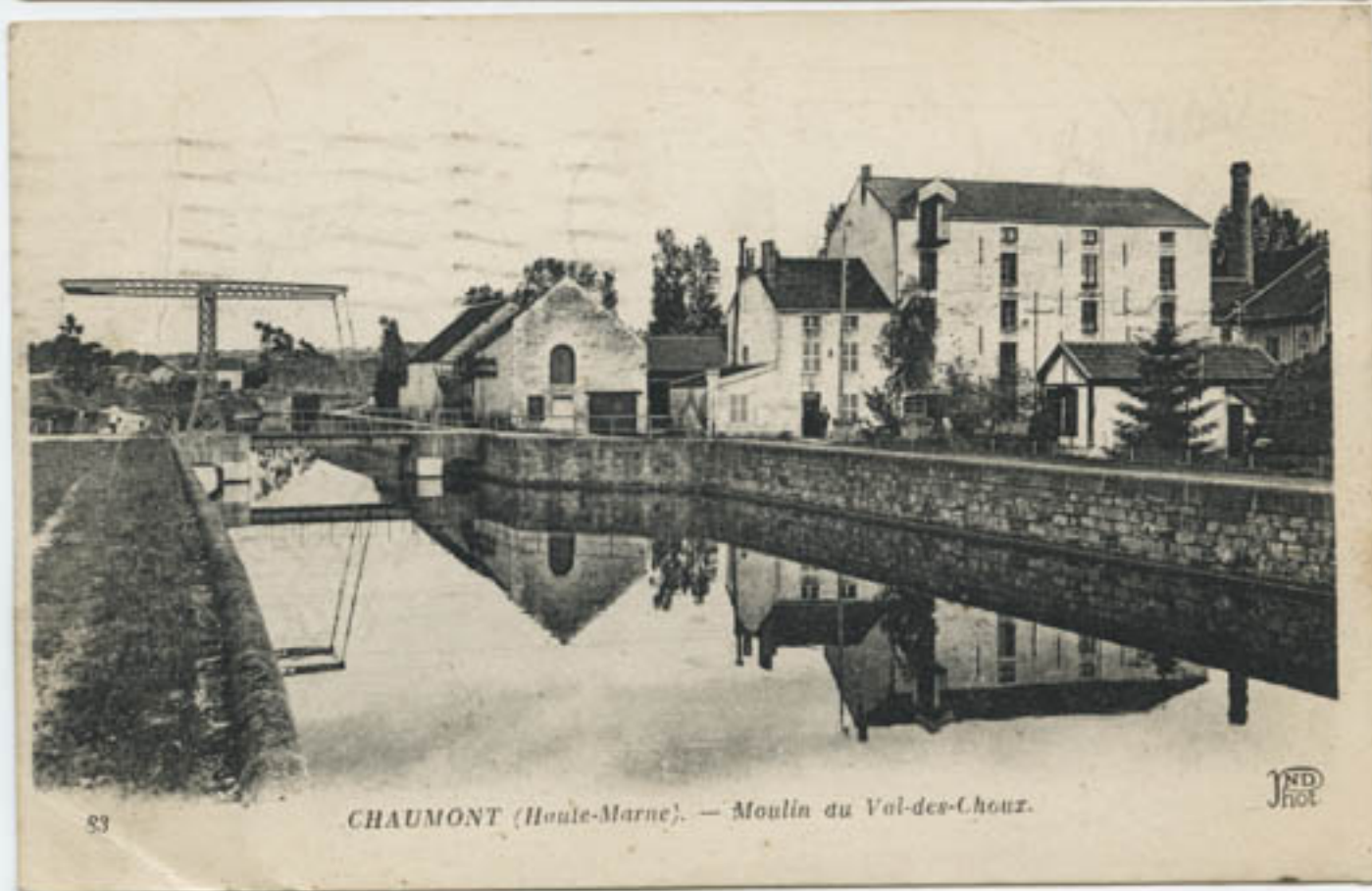
CHAUMONT (Houle-Marne). - Moulin du Val-des-Choux.