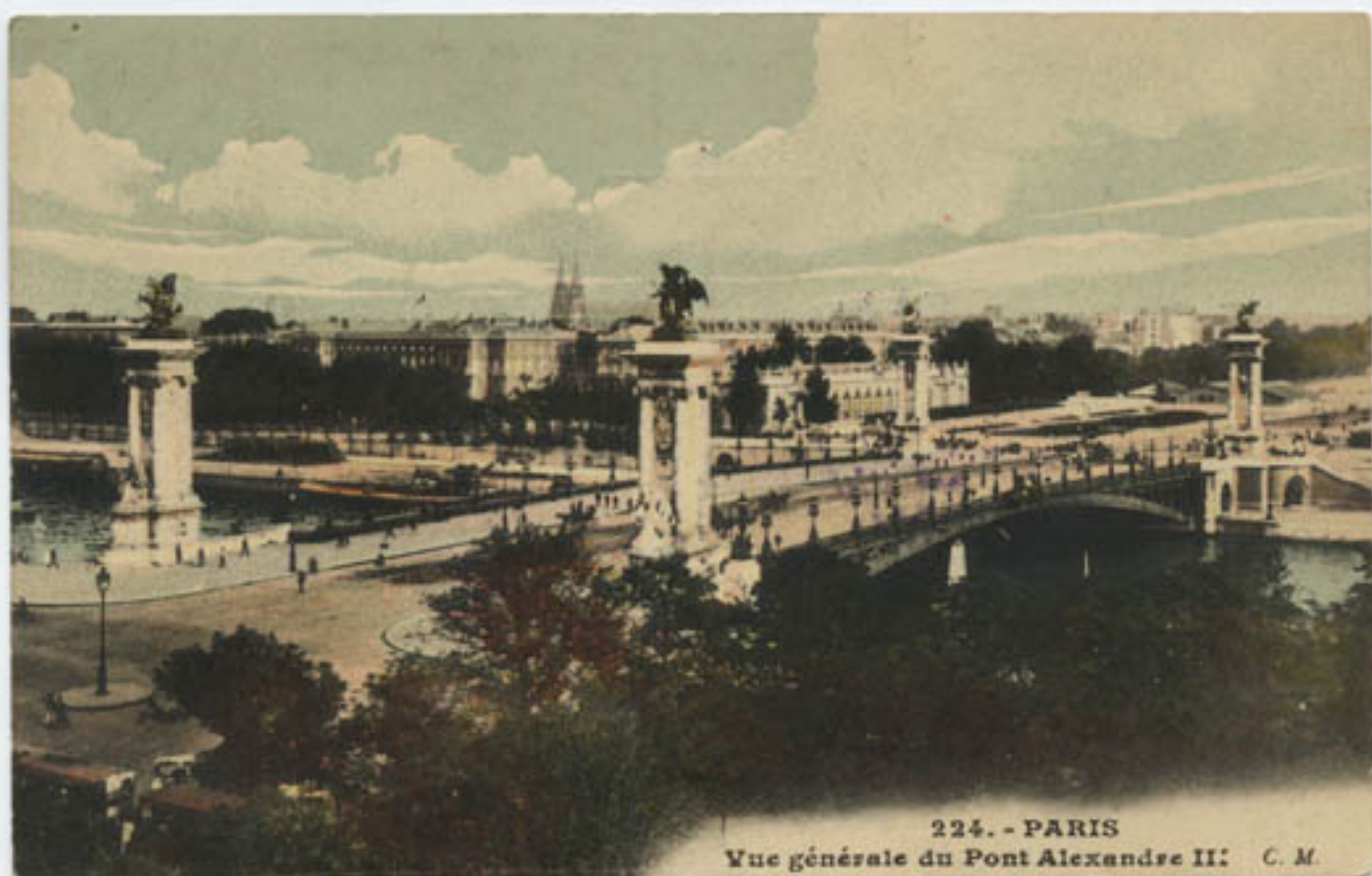
224. - PARIS Vue générale du Pont Alexandre II: C. M.