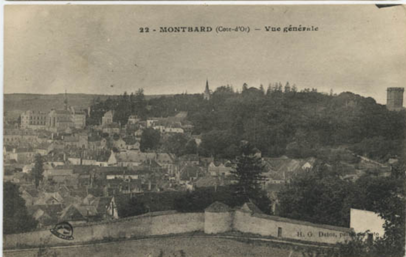
22 - MONTBARD (Cote-d'Or) - Vue générale