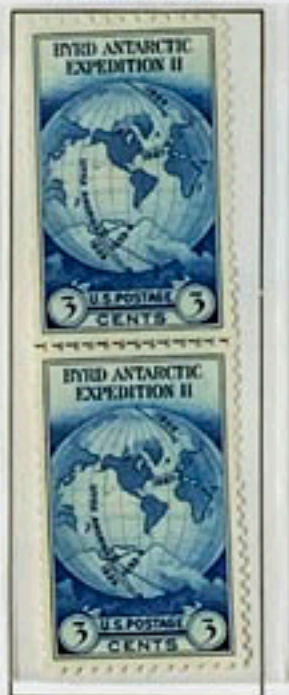
Perforated Line Pair