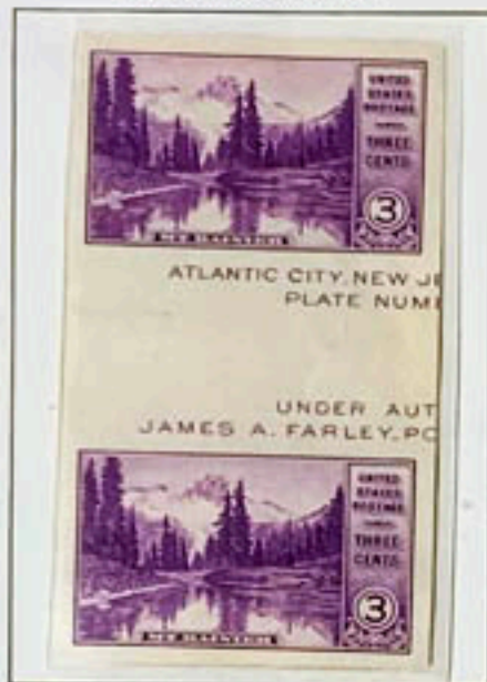
Imperforated Gutter Pair