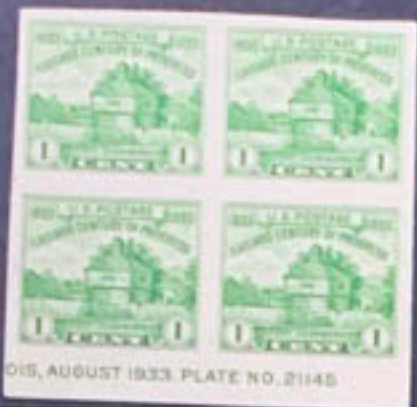
ST. LOUIS, AUGUST 1933. PLATE NO. 21145