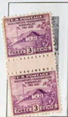
Perforated Gutter Pair