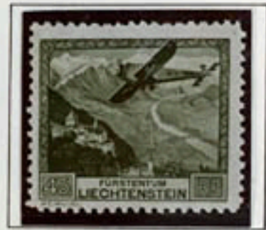
Plane over Vaduz castle & Rhine valley