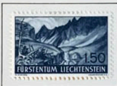
Lawena valley & Schwarzhorn Mountain