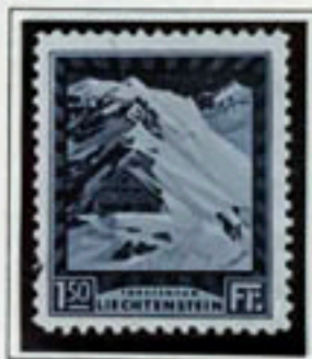
Pizalserhutte on Bettlerjoch