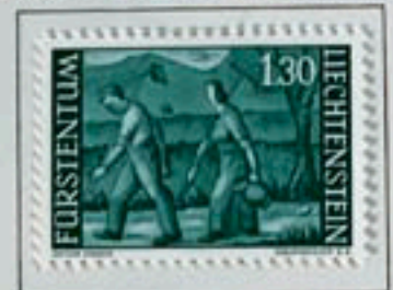
Return from the field