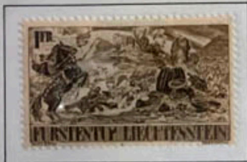
Battle of Gutenberg 1499 in Swabian war