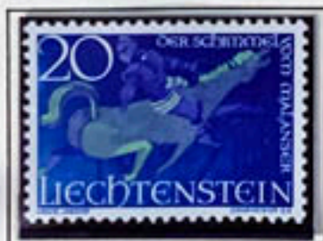
White Horse from Malanser.