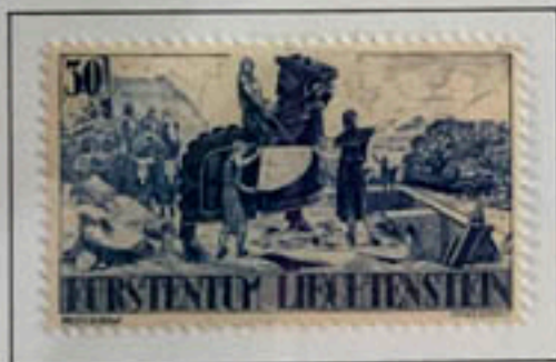
Count of Montfort rebuilding Vaduz castle