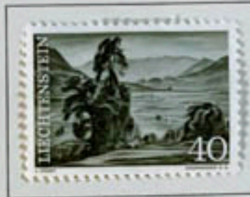
View from Schellenberg