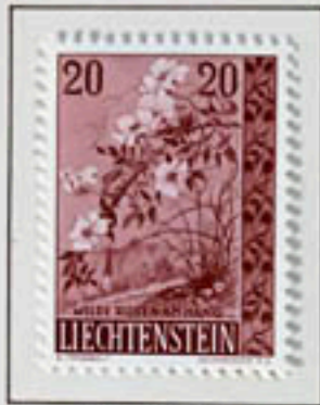
Wild rose bush