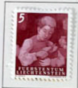
Boy cutting bread