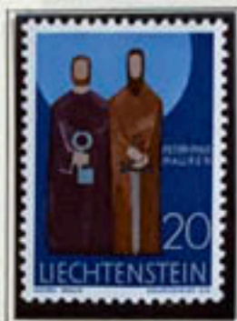
St. Peter & Paul, Mauren