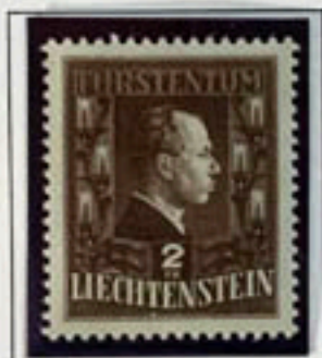
Francis Joseph II