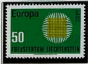
Woven fabric in shape of sun by Louis le Brocquy, Irish artist.