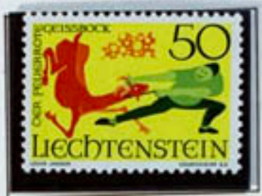
The Fiery Red Goat