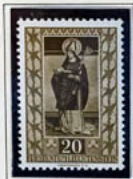
St. Nicholas (Zeitblom)