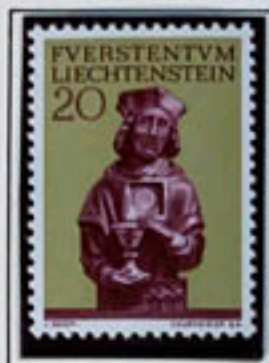
St. Florin, patron saint.