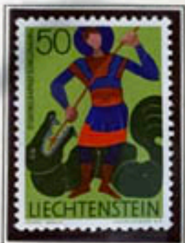
St. George, Schellenberg