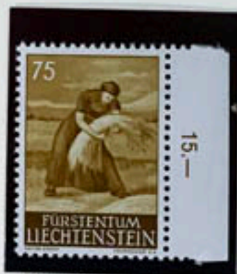
Woman Gathering Sheaves