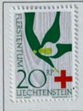
Angel of Annunciation