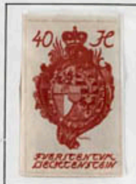
Gutenberg castle near Balzers