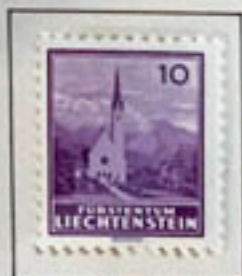
Parish Church & Lime Tree Square, Schaan