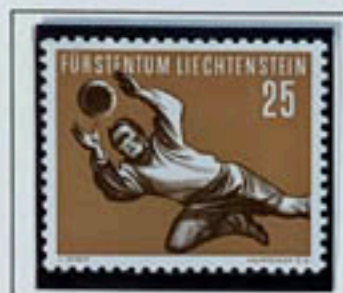
Goalie catching ball