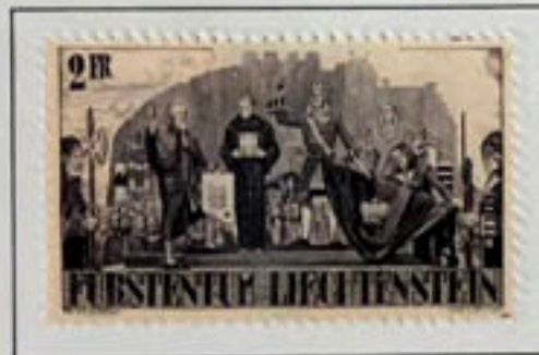
Homage to prince, 1718