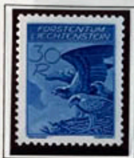
Eagle at nest