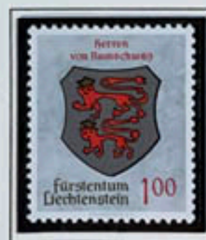
Herren von Ramschwag