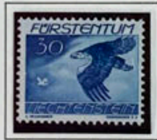
Buzzard pursuing pigeon