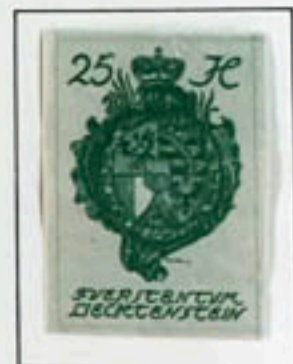
St. Mamertus chapel at Triesen