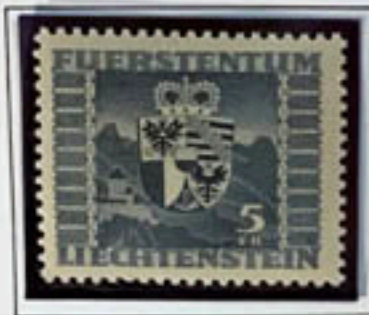
Arms & Vaduz castle