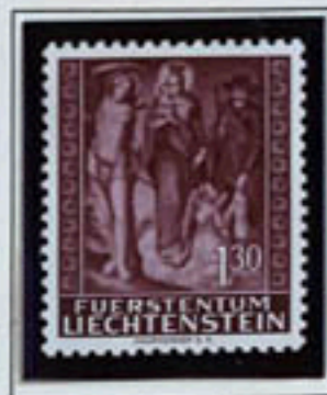
Saint Sebastian, Madonna and Saint Rochus.