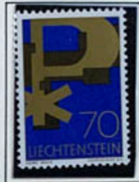
Monogram of Christ