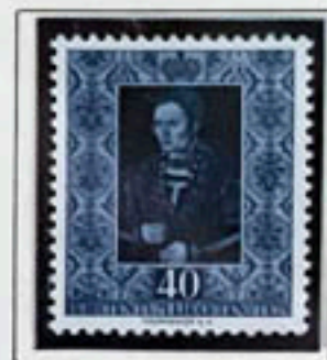
Leonhard Count of Hag (Kulmbach)