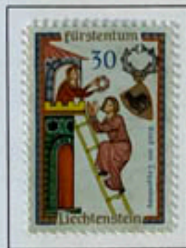
Kraft von Toggenburg