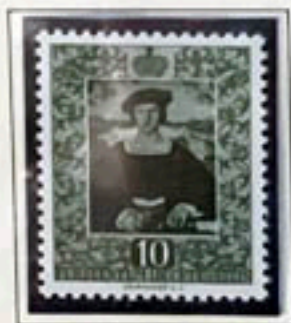
Portrait of a young man