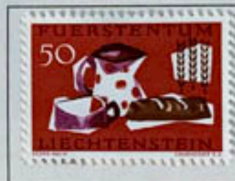
Bread, milk and ears of wheat