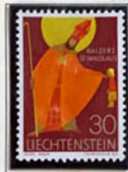
St. Nicholas, Balzers