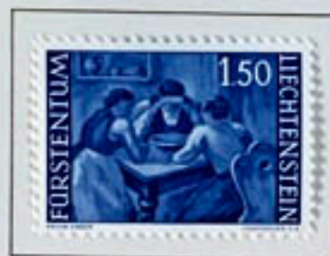
Saying grace at table