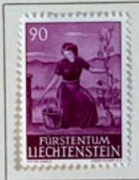
Work in Vineyard