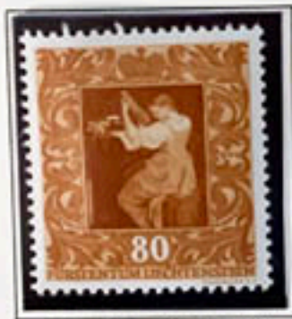
Lute player (Gentileschi)