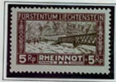
Rupture of Schaan Railroad Bridge