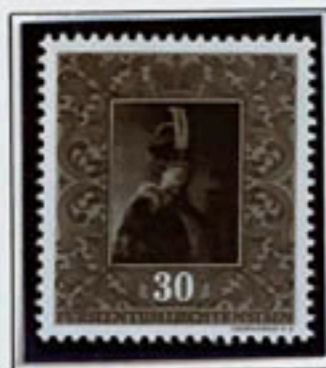
Self-portrait in plumed hat (Rembrandt)