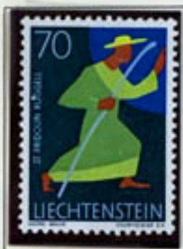
St. Fridolin, Ruggell