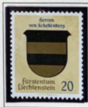
Herren von Schellenberg