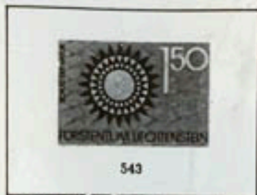
Sun, Symbolic of Preservation of Nature