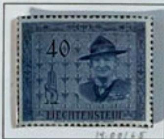
Scout, lilies, salute & Baden-Powell (1857-1941), founder of boy scouts and girl guides.