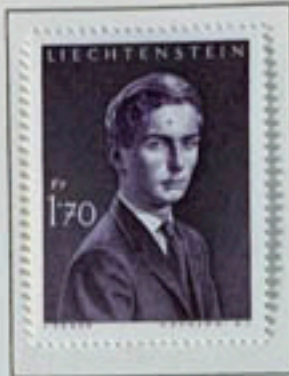
Hereditary Prince Johann Adam Pius