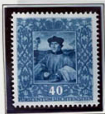
Portrait of a canon (Massys)