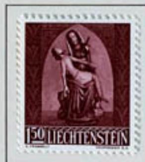
Pietà in chapel