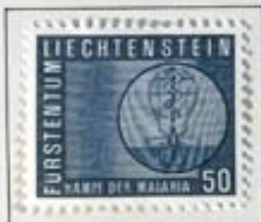
Anti Malaria Emblem