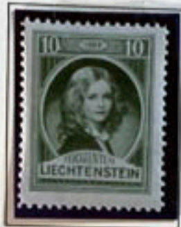
Francis I de Paula as youth