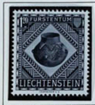
Pre-historic settlement Borscht near Schellenberg