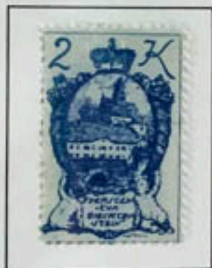
Benden parish church on Eschen hill.