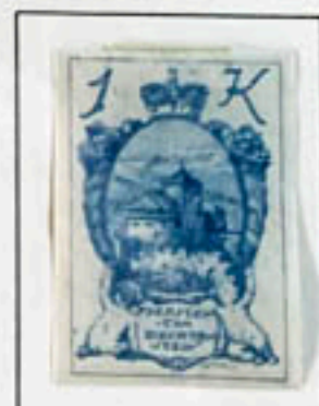
Vaduz castle, residence of reigning prince