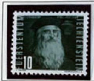
Da Vinci (Italian)