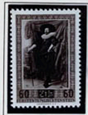
Willem v Heythuissen, mayor of Haarlem (Hals)