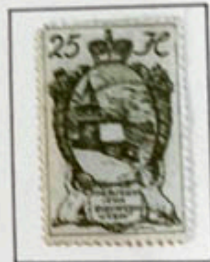
St. Mamertus chapel at Trüben