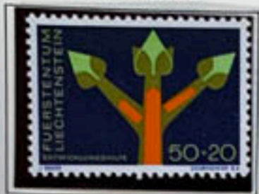
Symbol of Growth