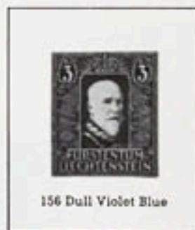
156 Dull Violet Blue