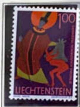
St. Theodul, Triesenberg