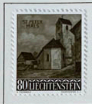
Chapel of St. Peter Mais, Balzers