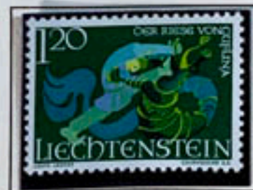
Giant from Gullina.