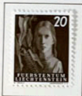
Girl with corn