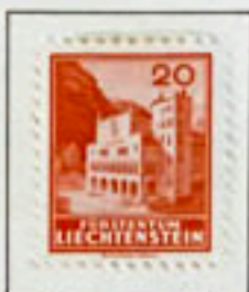
Vaduz town hall