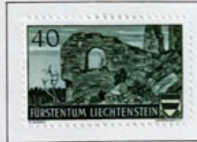
Schellenberg ruins & arms