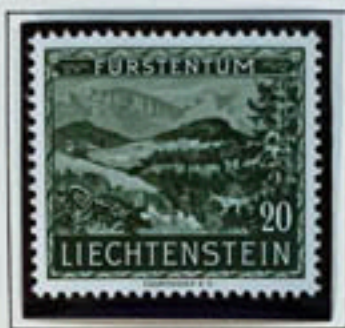
Rosens Jug (c3000 BC) found at Gutenberg-Balsers