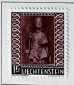
Sculpture on Tower of St. Lucius' Church