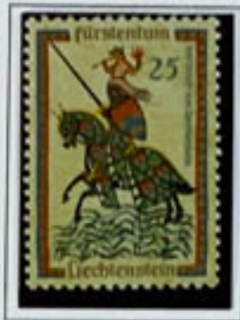
Ulrich von Liechtenstein