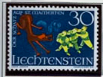
The Treasure of St. Maruerten