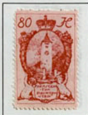
Steeple of St. Laurence