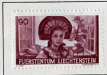
Girl in National Costume

These stamps were issued to promote domestic agriculture products.