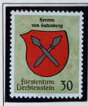
Herren von Gutenberg