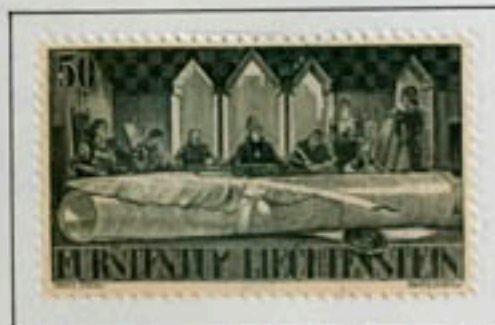
Signing treaty of 1342 which separated Vaduz & Schellenberg from vast Montfort lands