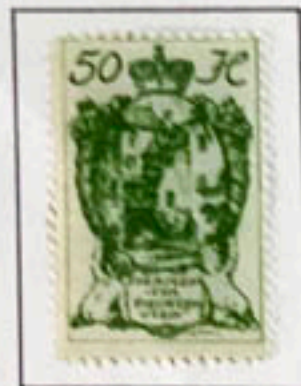
Courtyard, Vaduz castle