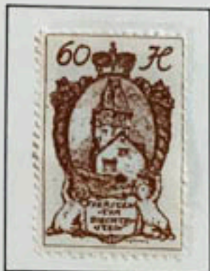
Red House, landmark of Vaduz