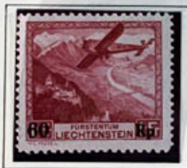
Overprinted for occasion of Vaduz-Innsbruck flight