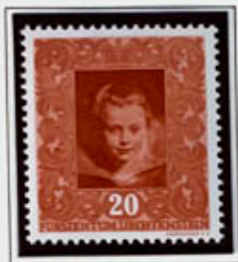
Portrait of a young girl (Rubens)