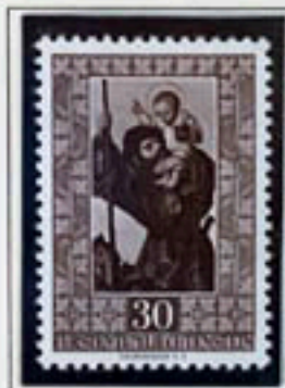
St. Christopher (Cranach the elder)