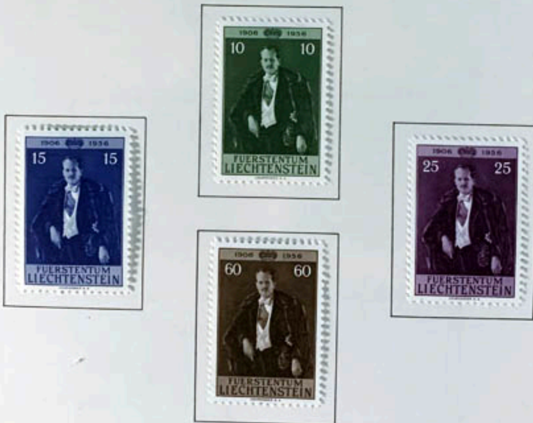
Francis Joseph II