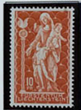
A wood sculpture carved about 1700.