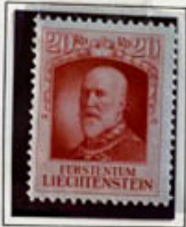
Francis I at time of accession