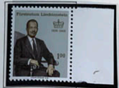
Prince Francis Joseph II