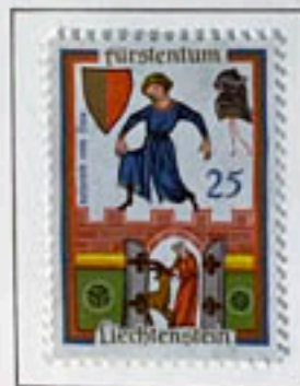
Heinrich von Sax