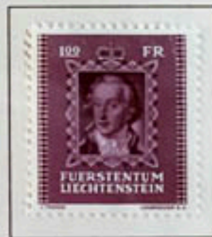
Alois Joseph I, son of Francis Joseph