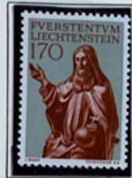
God the Father.