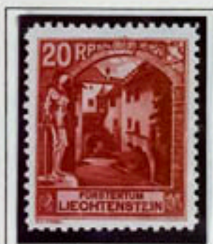
Vaduz courtyard: knight's armor