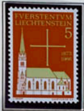
Parish Church at Vaduz.