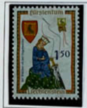
Walter von der Vogelweide