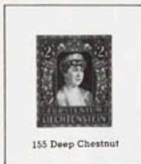
155 Deep Chestnut