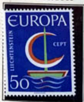
Stylized boat, travelling in full sail towards one common goal: The European Community