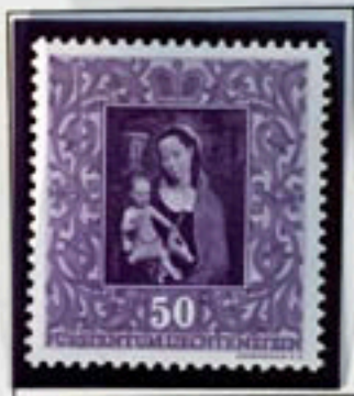
Madonna and Child (Memling)