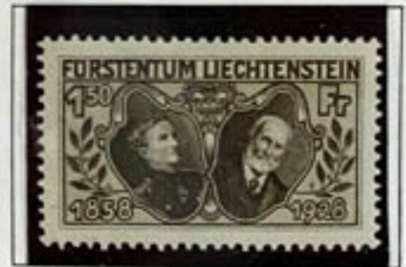
John II in 1858 & 1928