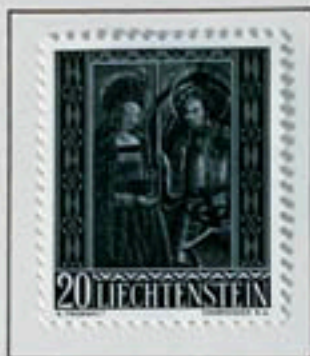
Sts. Moritz & Agatha