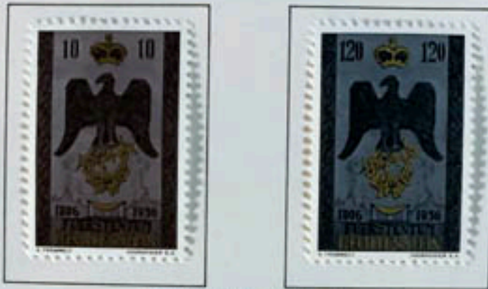
Crown, Eagle and Oak Leaves.