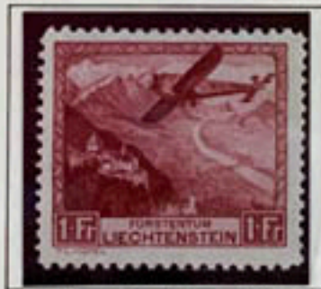
Plane over Vaduz castle & Rhine valley