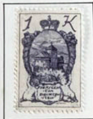
Vaduz castle, residence of reigning prince