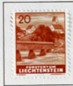
Benders & Rhine bridge