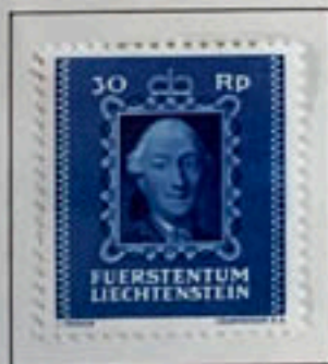
Francis Joseph I