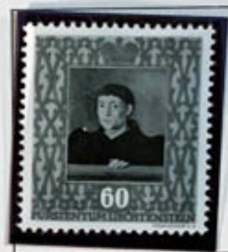
Franz Meister in 1456 (Fouquet)