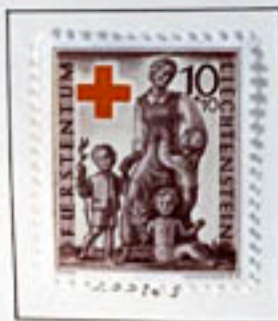
Care of children