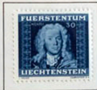
Joseph Wenzel, famous general, patron of arts and poor