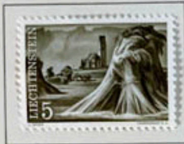
Church of Bendern