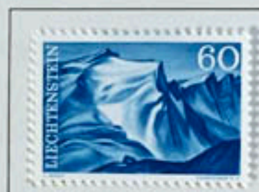
View of Naalkopf-Falknis-Range