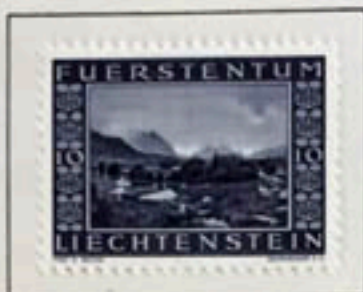
Bogs before drainage