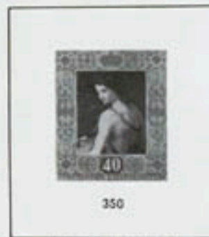
St. John (Del Sarto)