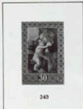
Madonna and Child (Botticelli)