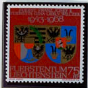
Coat of Arms of the Houses of Liechtenstein and Wilczek.