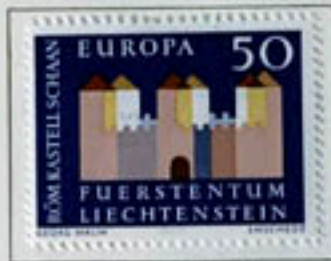
Roman Castle in Schaan