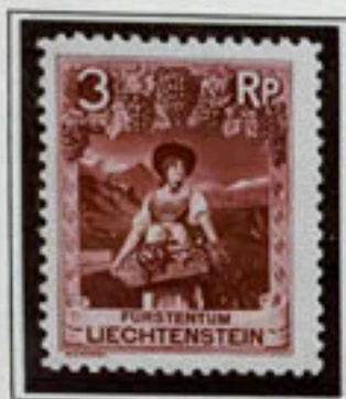
Woman Vintner, Vaduz