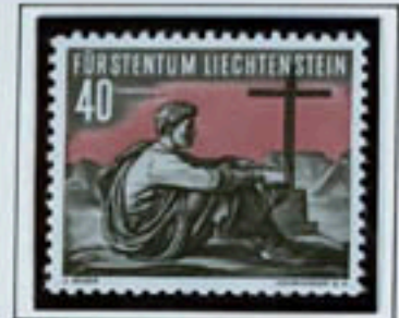
Climber resting at summit