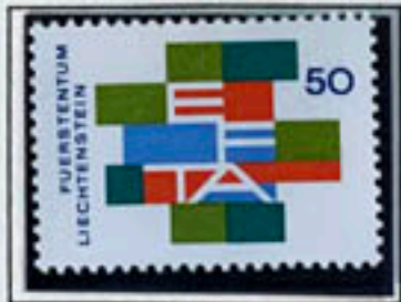
European Free Trade Association.