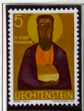
St. Joseph, Planken