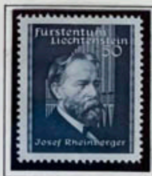
Joseph Gabriel Rheinberger