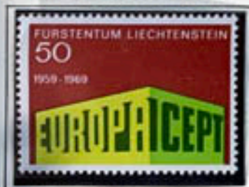
EUROPA CEPT based on Italian design by Luigi Gasbarra and Giorgio Belli.