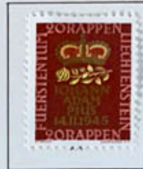
Crown and Rose