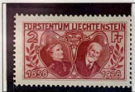
John II in 1858 & 1928