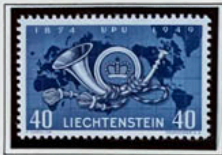
World Map, posthorn, globe