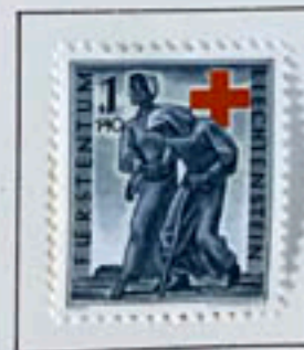
Care of aged