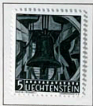
Bellry of Parish Church, Bendern