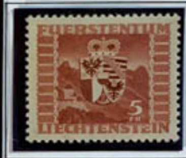
Arms & Vaduz castle