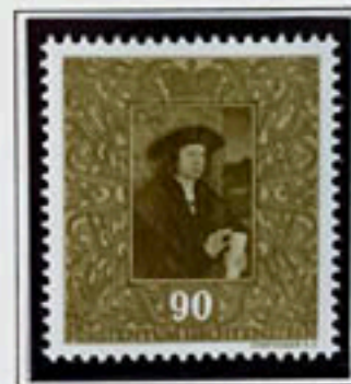
Portrait of a man (Strigel)