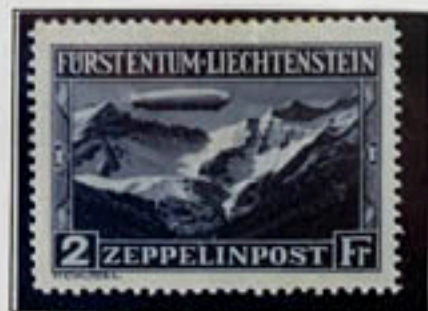
Zeppelin over Valuna valley