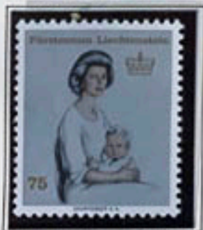
Princess Gina with Son, Prince Franz Josef Wenzel