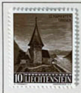
St. Mamertus Chapel