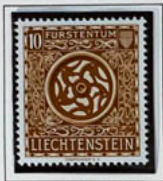
Alemanni disc (c600AD) found at Schaan 1934