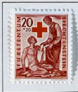
Care of sick