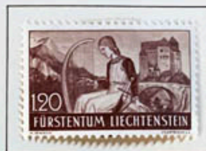
Ulrich v. Liechtenstein, Gutenberg Castle