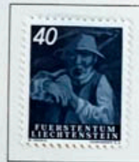
Man with scythe