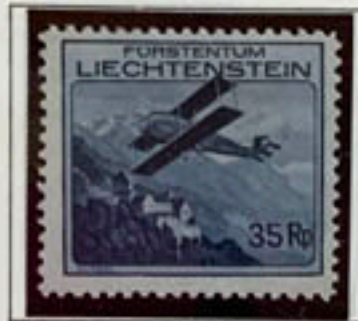
Plane over Vaduz castle