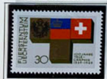
Letter "T" with the coats of arms of Austria-Hungary, Liechtenstein and Switzerland.