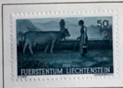
Milkmaid and Cow