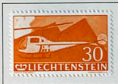
Helicopter Bell 47-J