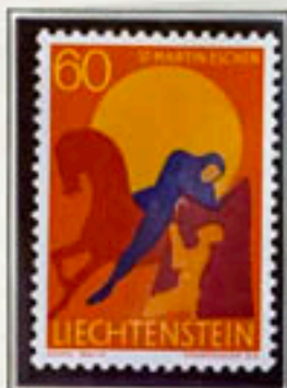
St. Martin, Eschen