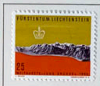
Relief map of Liechtenstein