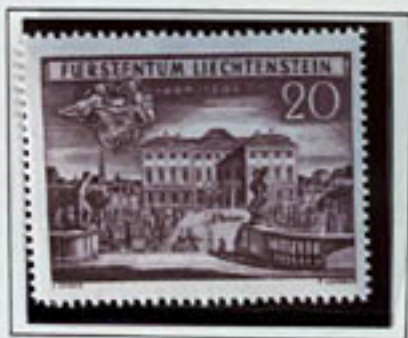
Liechtenstein gallery, Vienna

1949. 250TH ANNIV. PURCHASE OF SCHELLENBERG