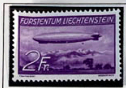
Graf Zeppelin over Schaan airfield