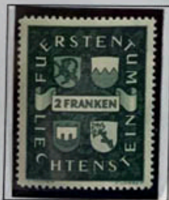
Arms of ruling families: Hohenems, Salza, Werdenberg- Sarggen, (Montfort), Brandis.