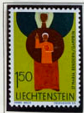
St. Maria, Bezdern-Gamprin