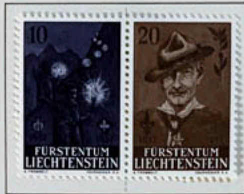
Scouts with torch light Lord Baden-Powell

Issued to commemorate 50th anniversary of Scout Movement and 100th anniversary of Baden-Powell's birth.