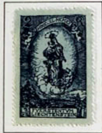
Madonna & Child over Liechtenstein