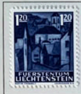
View of Mauren