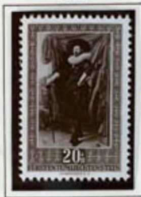
Willem v Heythuysen, mayor of Haarlem (Hals)