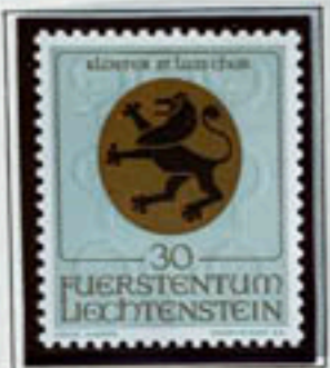
St. Luzi Monastery