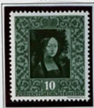
Portrait of a woman (Da Vinci)