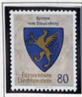
Herren von Frauenberg