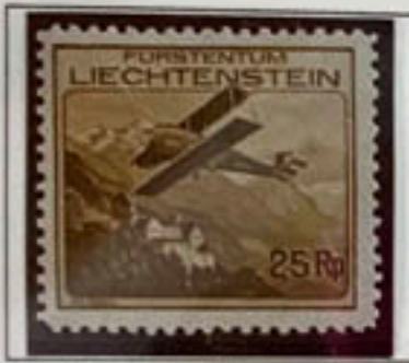
Plane over Vaduz castle