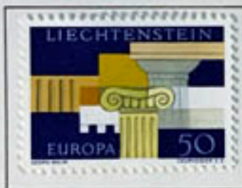
Supporting elements from Greek Architecture