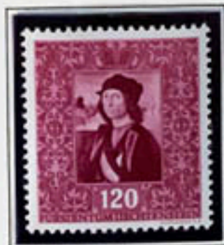
Portrait of a man (Raphael)