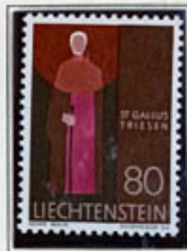
St. Gallus, Triesen