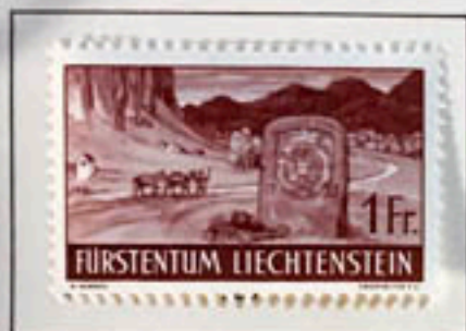
Border marker at Luziensteig & Flaschner Mountain