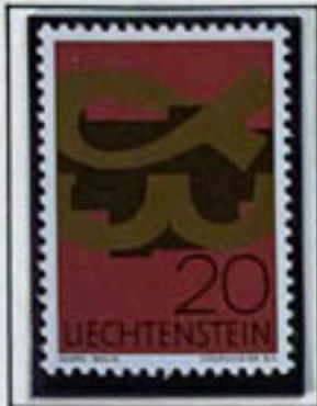
Alpha and Omega