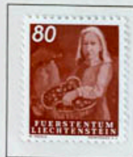
Woman with potatoes