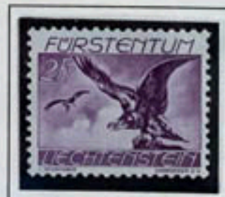
Great bearded vultures