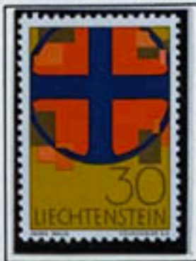
Cross as symbol of victory