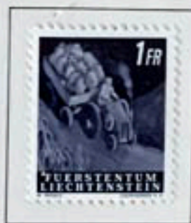
Tractor & potato load