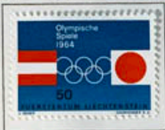
Olympic rings between flags of Liechtenstein and Japan