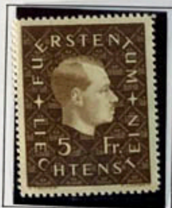
Francis Joseph II succeeded his great-uncle Francis I in 1939.