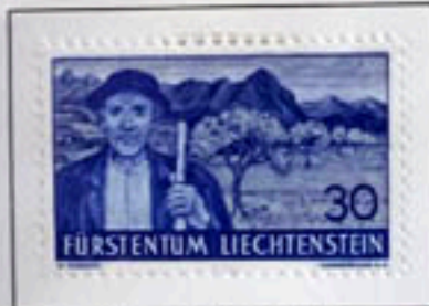
Farmer in Ober valley