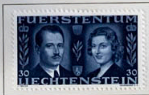
Prince & Princess