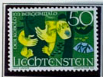
The Goblin in the Bergerwald