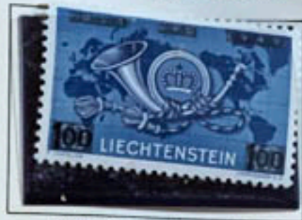
World Map, posthorn, globe

1949. 250TH ANNIV. PURCHASE OF SCHELLENBERG