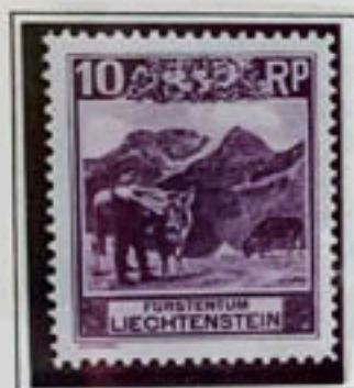
Cattle on Bettlerjoch