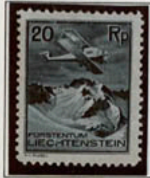
Plane over mountains