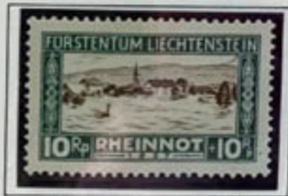
Inundated village Ruggell