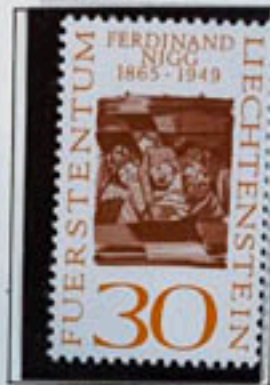
The Three Magi