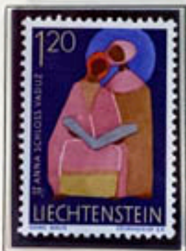
St. Anna, Vaduz, Castle