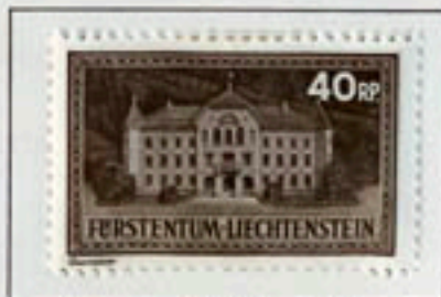
Government Building, Vaduz