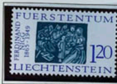
Jesus in the Temple