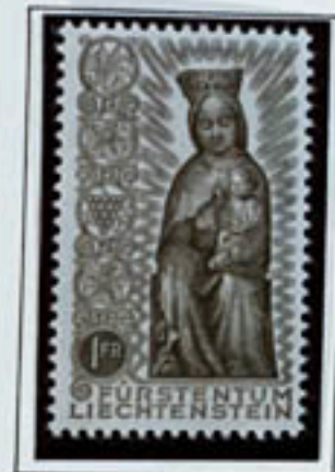
Madonna of Triesen: 14th century wood sculpture