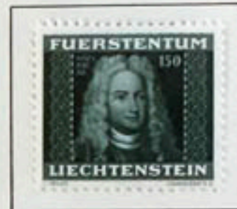
Joseph (reign 1721-32)