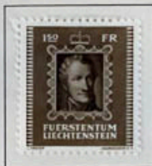
John Joseph I (reign 1805-36)