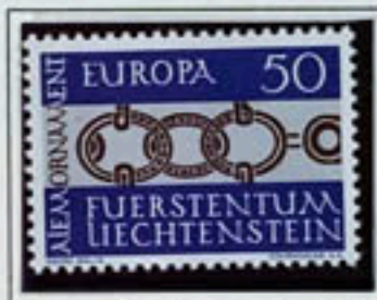
This design is from an Old German belt-buckle (c 600 A.D.) which was found in a tomb near Eschen.