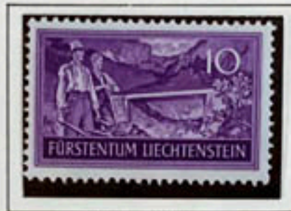
Bridge at Malbun