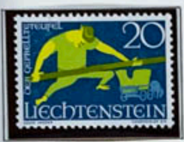
The Cheated Devil