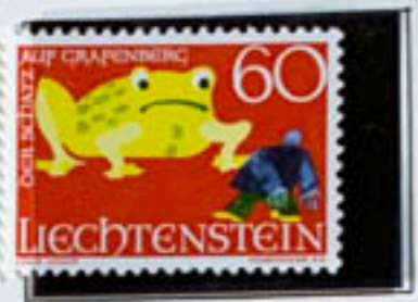
The Treasure at Grafenberg