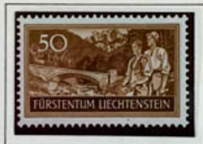
Prince Francis bridge near Planken