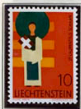
St. Laurentius, Schaan