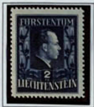
Francis Joseph II