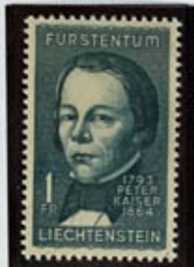
In honor of the 100th anniversary of the historian's death.