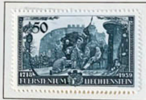
Homage to prince before Vaduz castle, 1718.