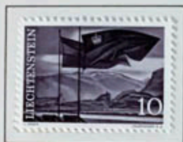
Flags in Vaduz Castle Rhine Valley