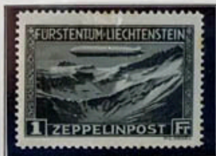
Zeppelin over Haafkopf