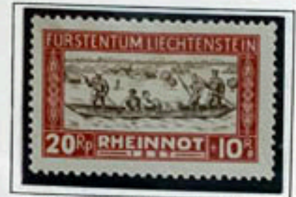
Rescue work by Austrian soldiers