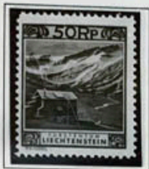
Lodge at Malbun