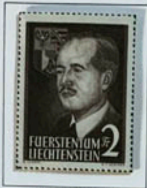
Francis Joseph II