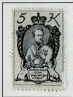
John Joseph I (1805-36) in Austrian Army uniform.