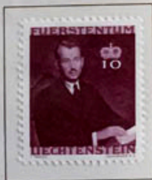
Francis Joseph II