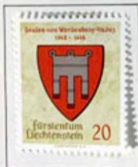
Count von Werdenberg-Vaduz (1342-1416)