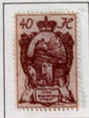
Gutenberg castle near Balzers