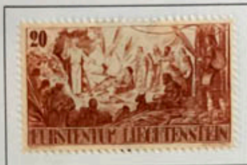
St. Lucius, apostle & patron of Leichtenstein, preaching