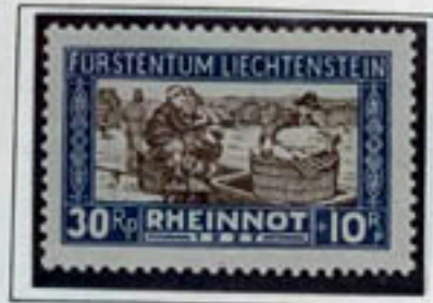
Salvage by Swiss soldiers