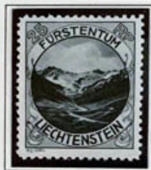
Samina valley & Naalkopf Mountain