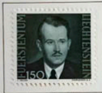
Francis Joseph II