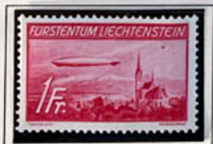
Hindenburg LZ-129 airship over Schaan church