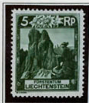
Hunter & Princes path on 3 Sisters mountains