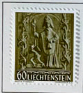
Sculpture on Bell of St. Theodul's Church