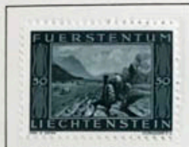
Plowing reclaimed land