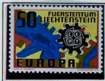
Meshed gears symbolize cooperation between CEPT nations.