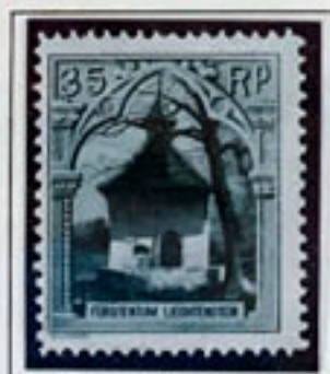
Holy Cross chapel