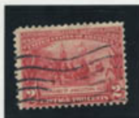
FOUNDING OF JAMESTOWN