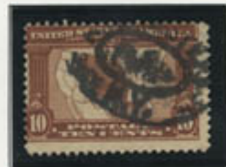
MAP OF LOUISIANA PURCHASE

This set was issued to commemorate the Louisiana Purchase (827,987 sq. mi.), the first major acquisition west of the Mississippi. Pictured on the stamps are the notables who negotiated the vast transaction: Livingston and Monroe bargained with Napoleon; President Jefferson officially approved the deal. President McKinley authorized the St. Louis World's Fair celebrating the centennial of the Purchase.