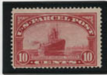
STEAMSHIP AND MAIL TENDER