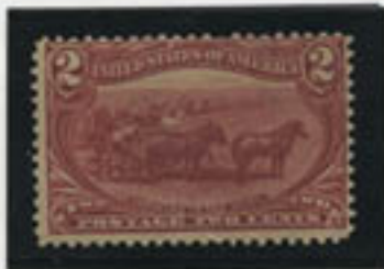
Grain harvesting with horse-drawn combines was slow and tedious.