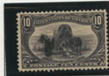
Death of a horse pulling a "Prairie Schooner" was a typical hardship.