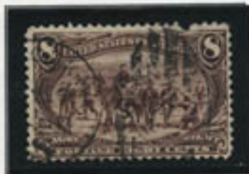
The U.S. Cavalry that protected settlers from fierce Indian attacks.