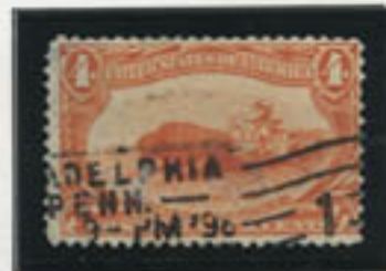
Buffalo were prized by the Indians for food and clothing.