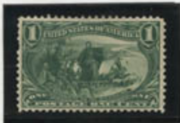
A scene from Father Marquette's explorations of the Mississippi River.