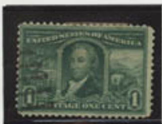
ROBERT R. LIVINGSTON