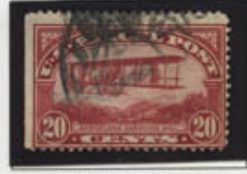
AIRPLANE CARRYING MAIL