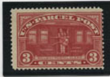
RAILWAY POSTAL CLERK