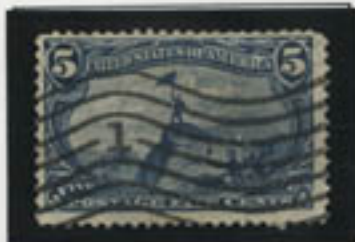
John Charles Frémont planted a U.S. flag on highest peak in Rocky Mts.