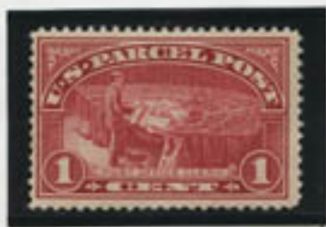
POST OFFICE CLERK