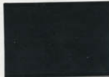
A marvel of the 1890's: bridge over the Mississippi at St. Louis, Mo.