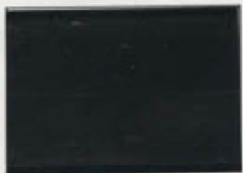
Here is a typical gold-mining prospector with his burros and dog.