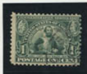
CAPTAIN JOHN SMITH