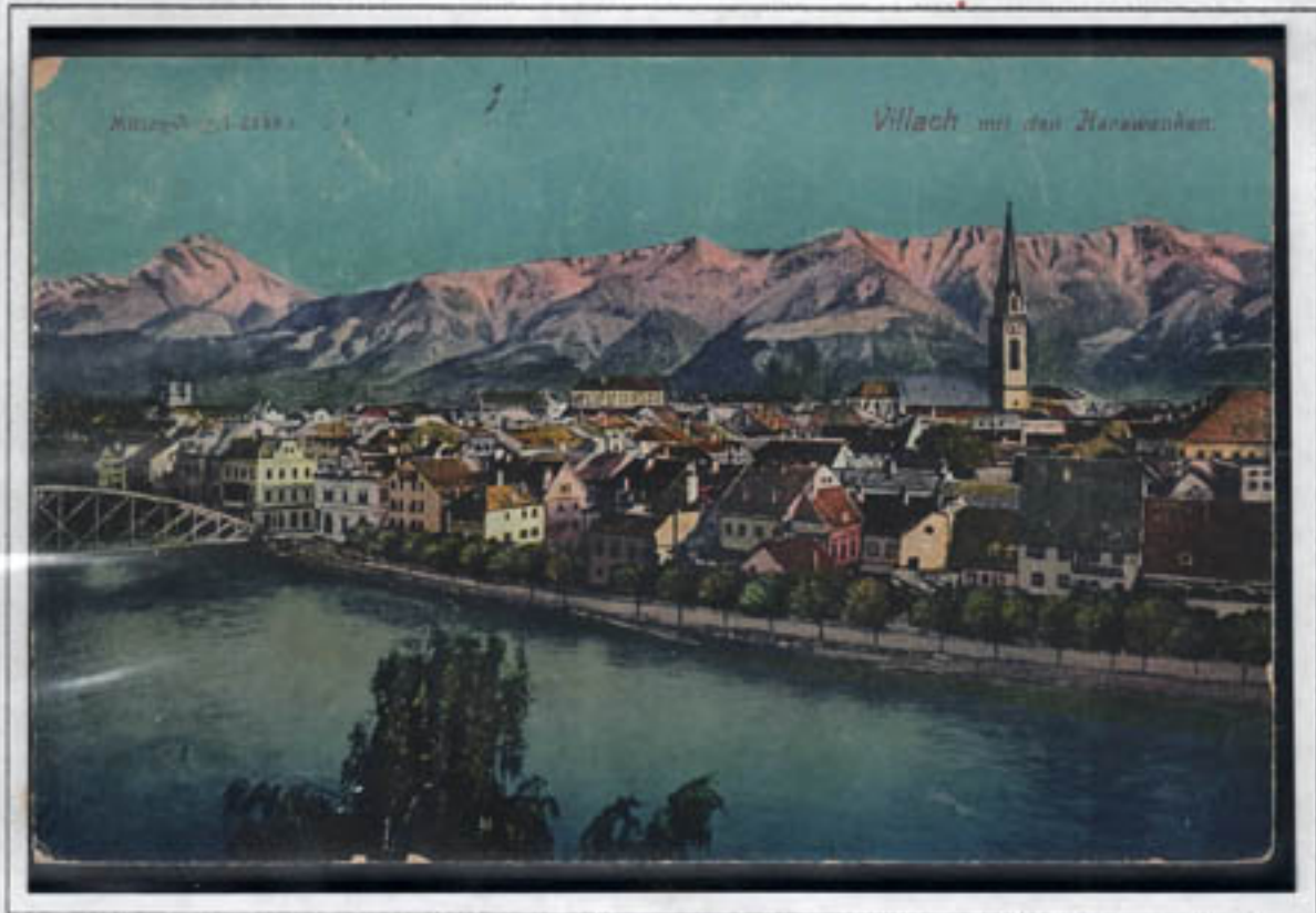
"Villach mit den Karawanken"